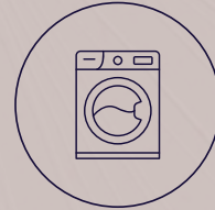
Laundry & Dry Cleaning