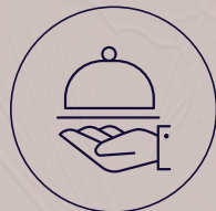
Food & Beverage Room Service