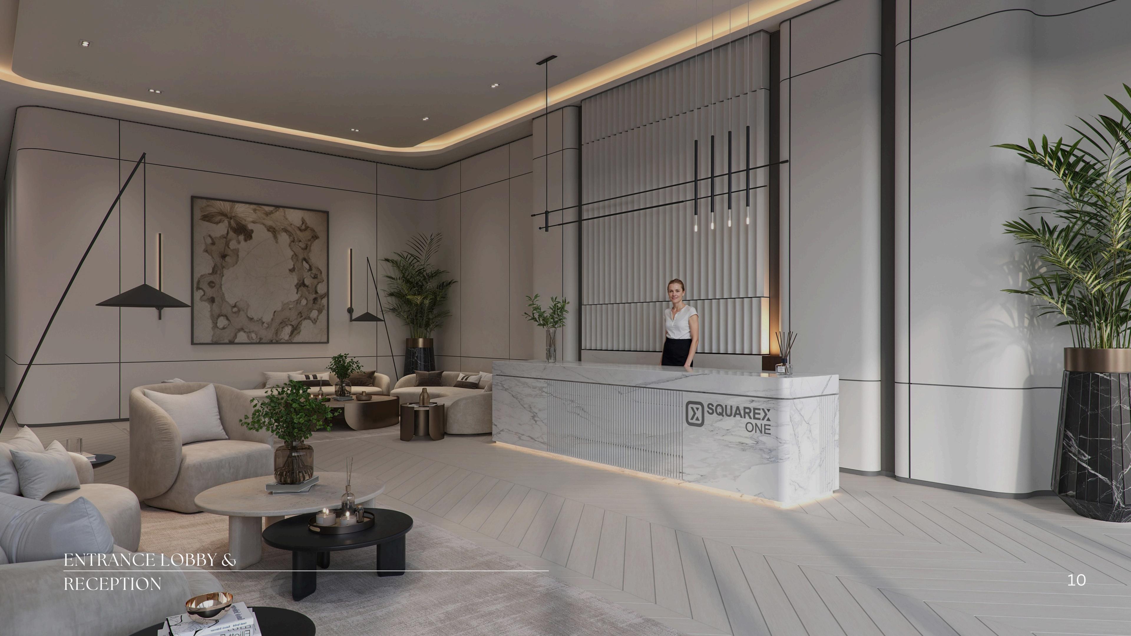
ENTRANCE LOBBY & RECEPTION