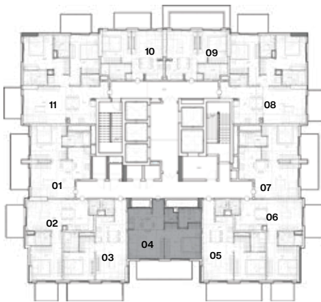
2 ND FLOOR PLAN