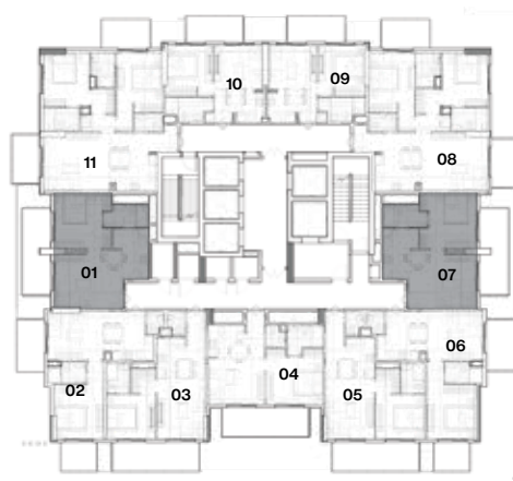
TYPICAL (3 RD -11 TH /13 TH -15 TH /17 TH -25 TH ) FLOOR