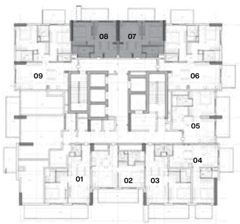
12 TH FLOOR PLAN