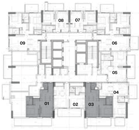
12 TH FLOOR PLAN