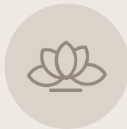
Rest & Retreat Decks