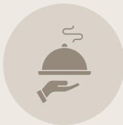
Rooftop Turf Deck & Terrace Banquet Space