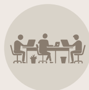
Multi-function Room and Co-working Space