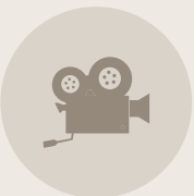
Skyline Silent Cinema