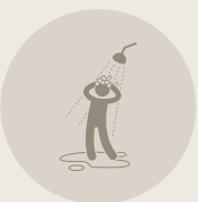
Poolside Rinse Stations & Grill Deck