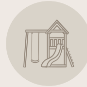
Kids' Play Zone with Climbing Wall