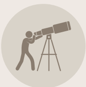
Rooftop Observatory Deck