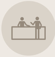
Reception & Lounge