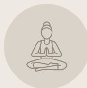
Open-Air Yoga & Meditation Deck