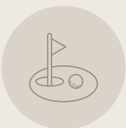
Signature Mini Golf Park