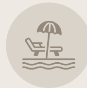
Floating Lounge & Glazed Edge Pool