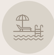
Resort-style Swimming Pool