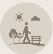
Nature Walks & Promenades