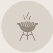
Outdoor BBQ Area