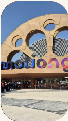
DUBAI PARK & RESORTS