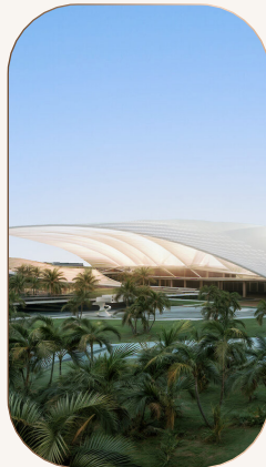
AL MAKTOUM AIRPORT