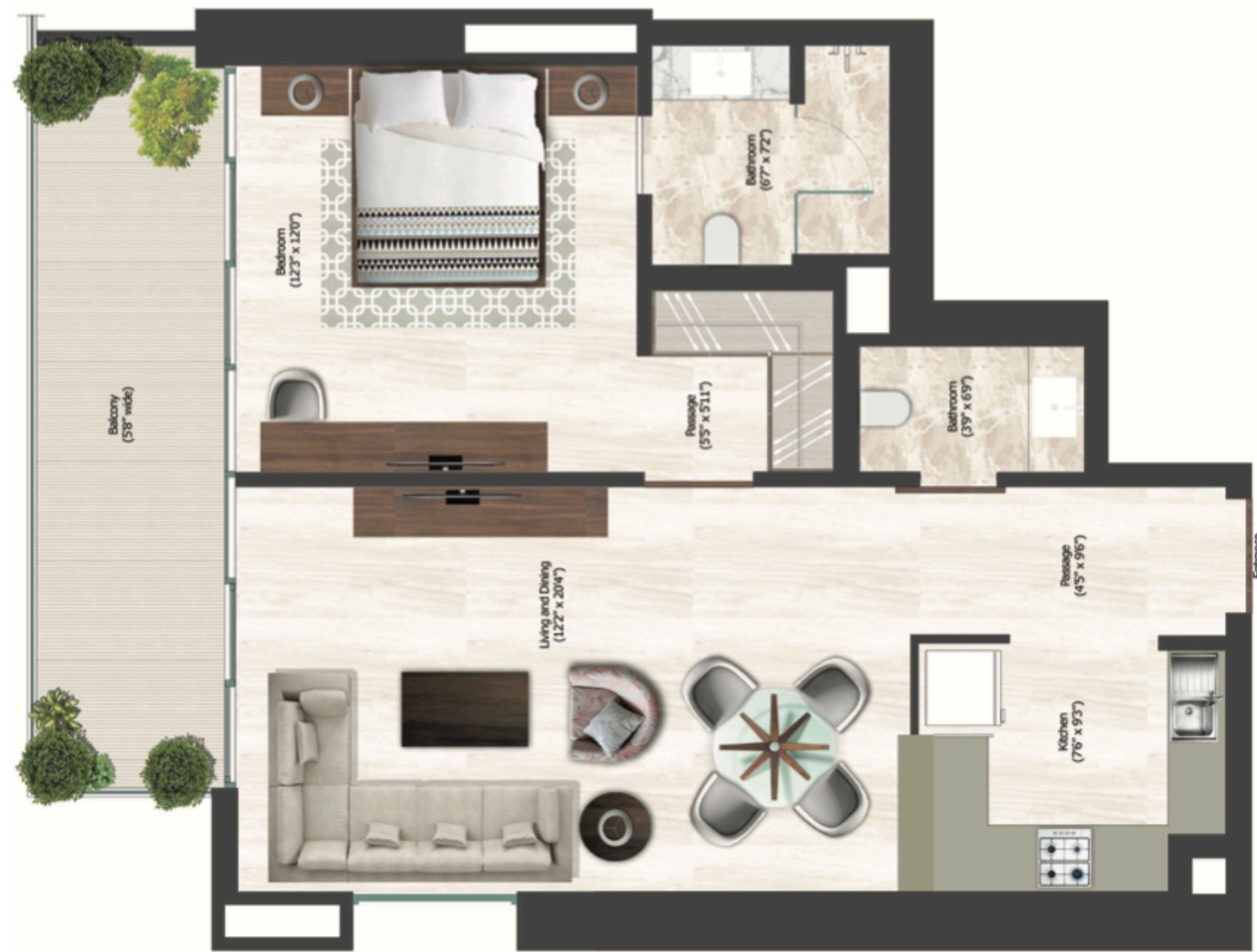
1 Bedroom — Type B