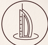
BURJ AL ARAB 15 min