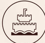
GLOBAL VILLAGE 10 min