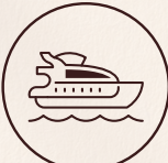
DUBAI MARINA 20 min