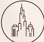
BURJ KHALIFAH 20 min