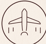
AL MAKTOUM INTL. AIRPORT 25 min