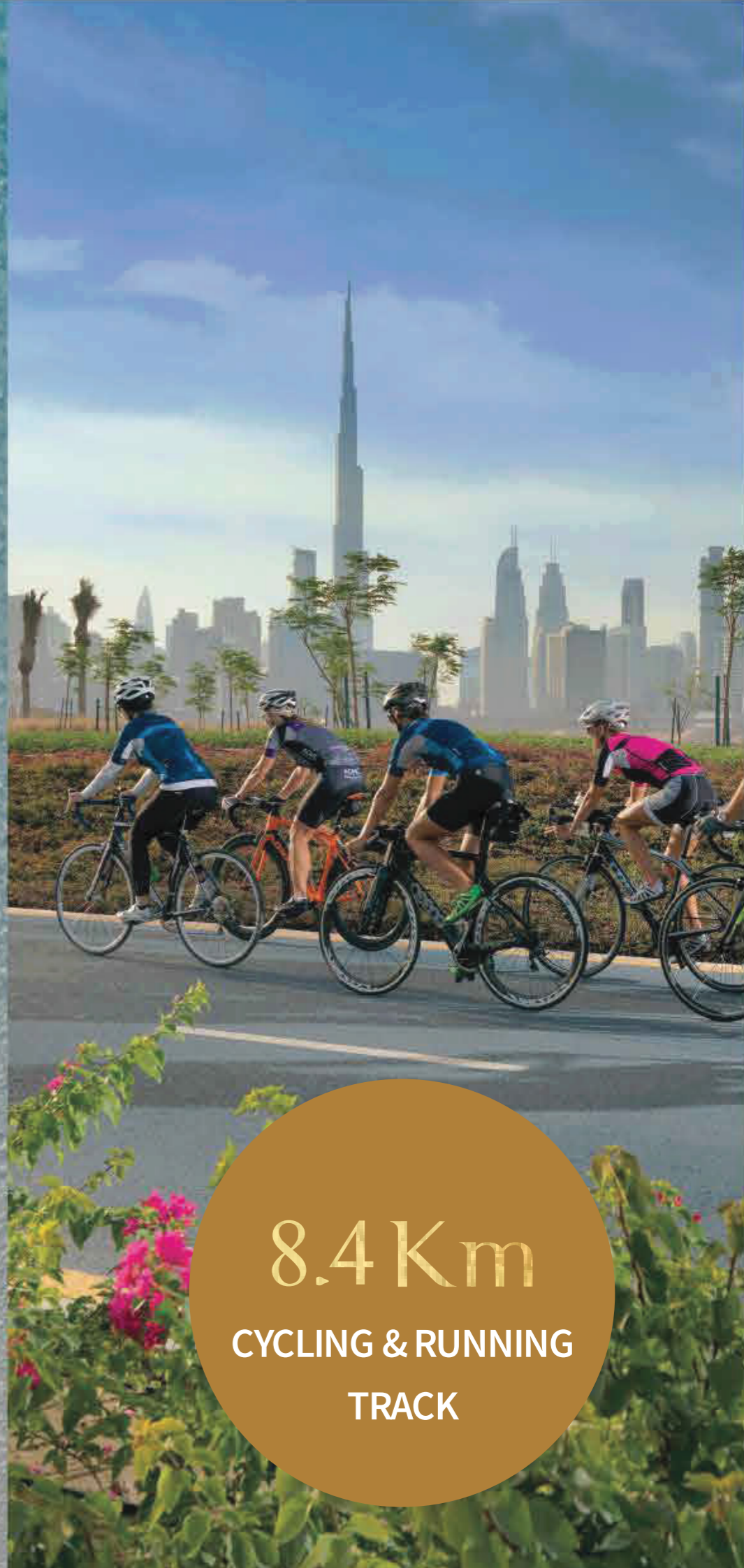
8.4 Km CYCLING & RUNNING TRACK