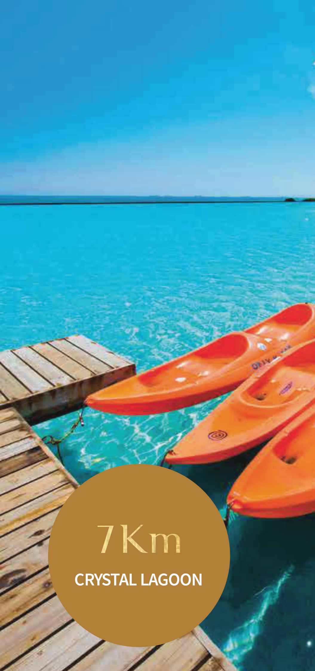
7Km CRYSTAL LAGOON