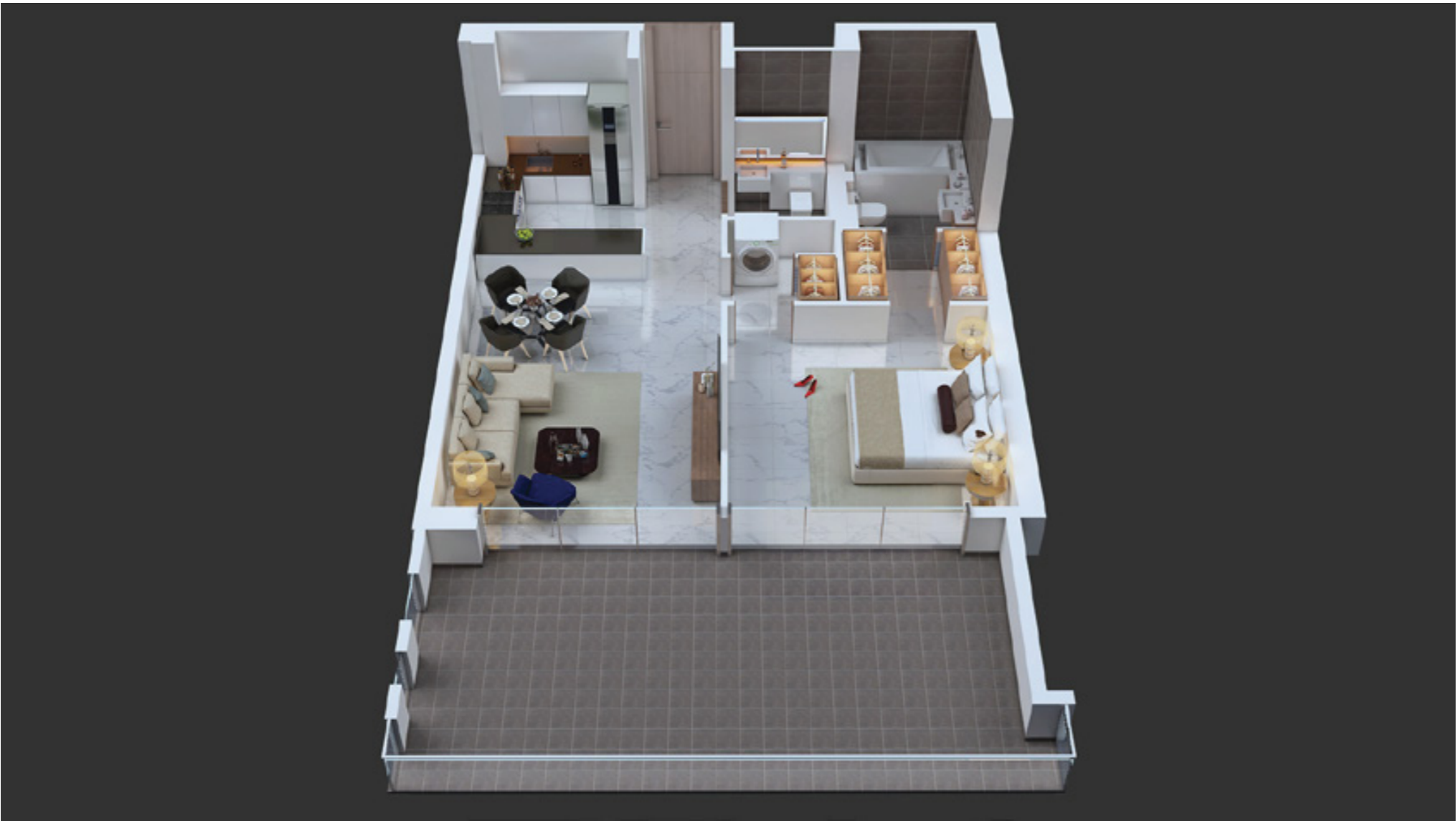
GROUND FLOOR UNIT RENDER