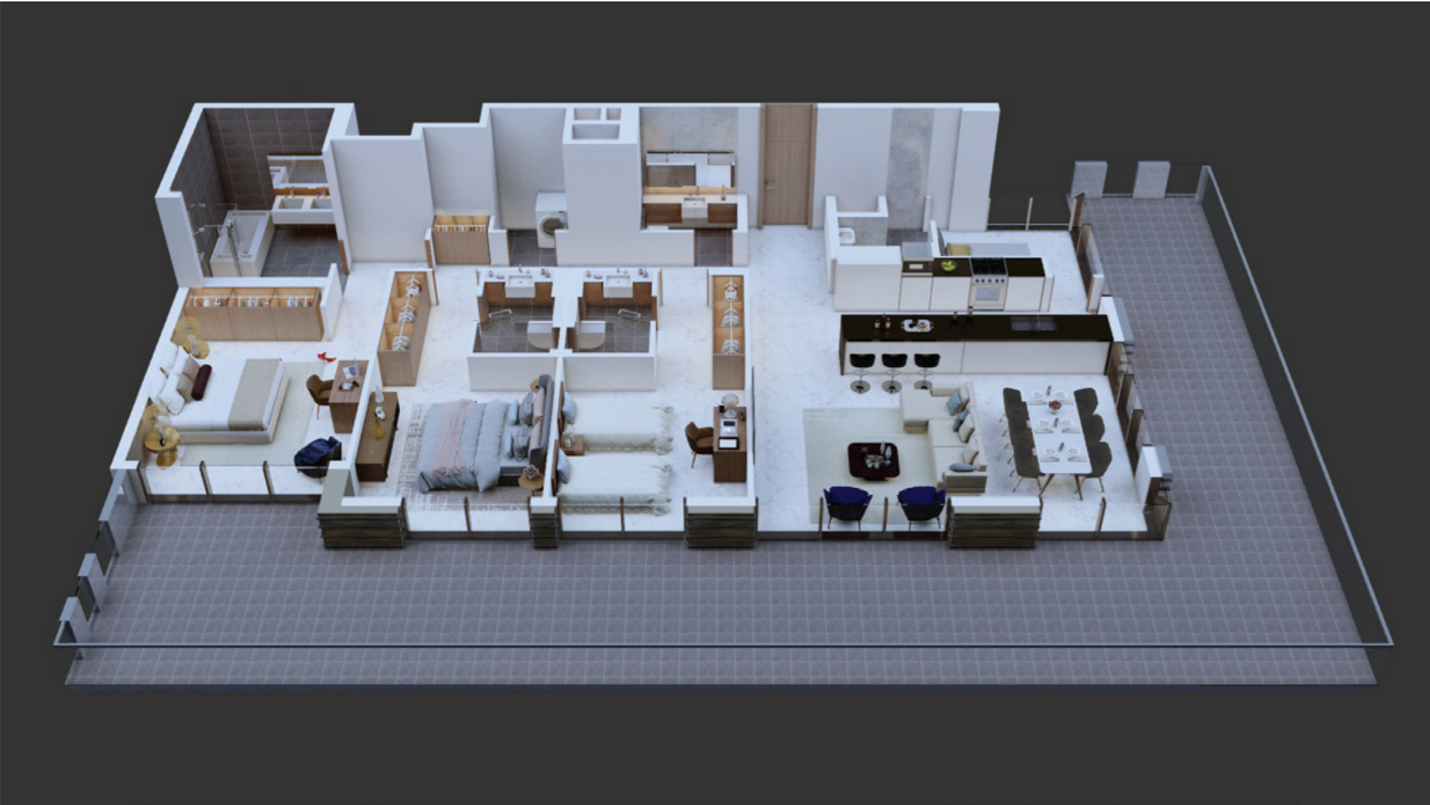
GROUND FLOOR UNIT RENDER