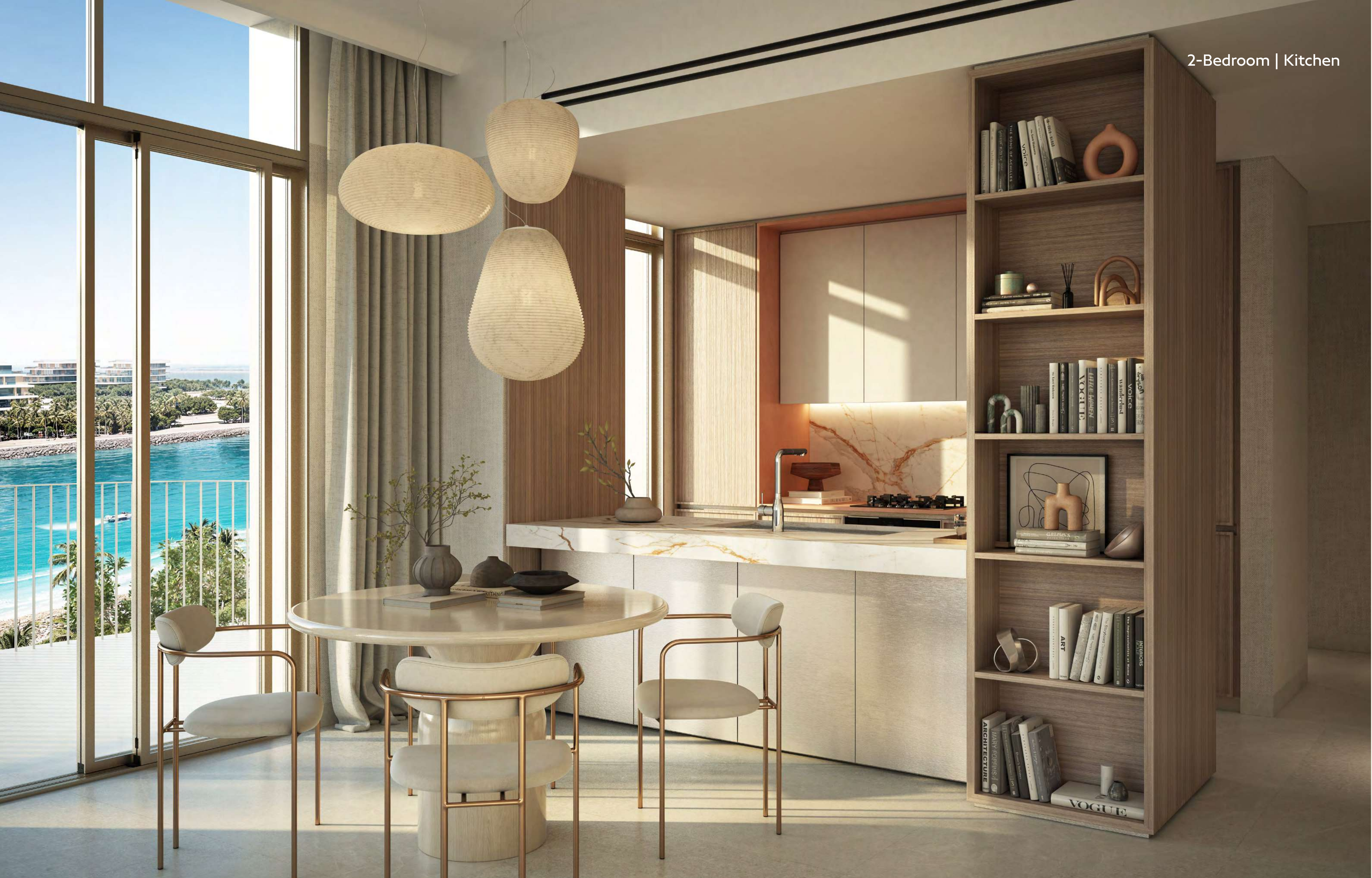
2-Bedroom | Kitchen