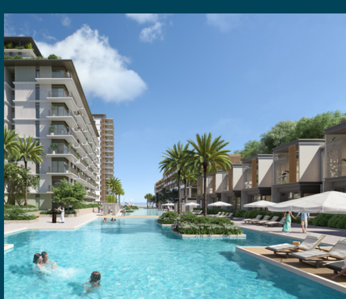
The Canal Pool