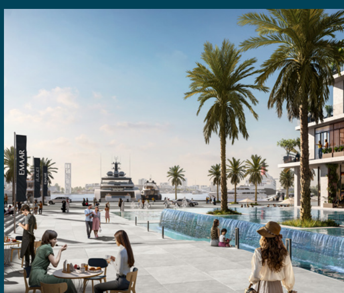
Direct Access to The Promenade