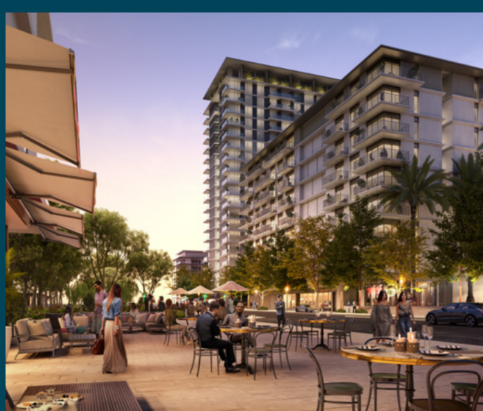
A Short Walk to Dining & Shopping Options