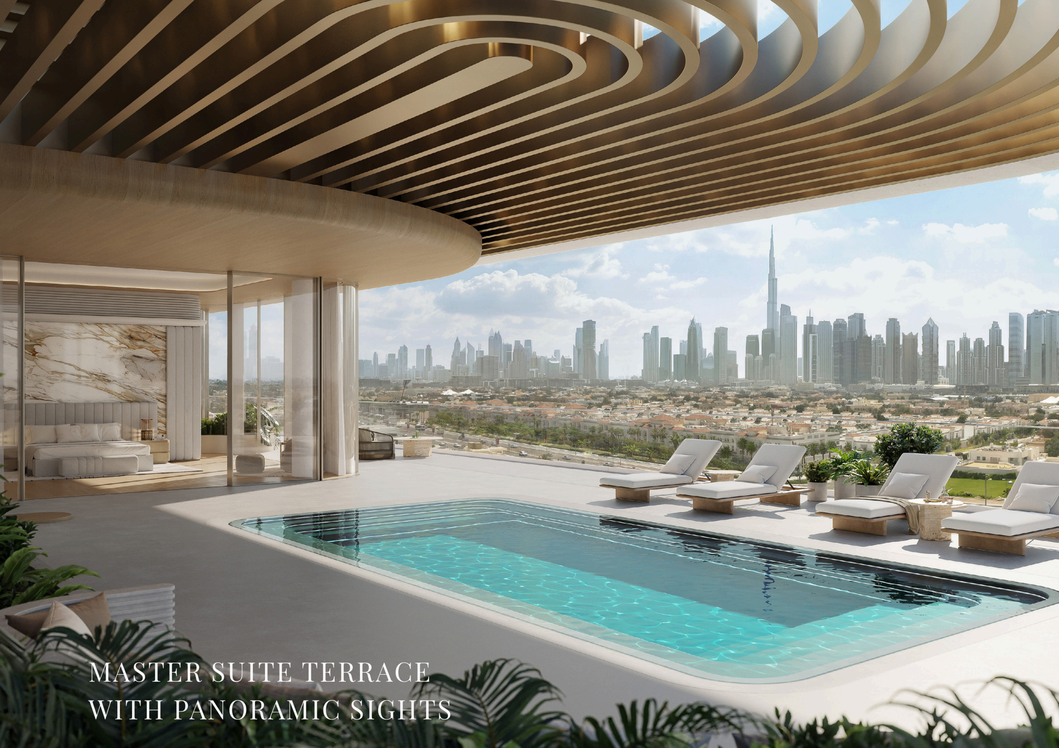
MASTER SUITE TERRACE WITH PANORAMIC SIGHTS