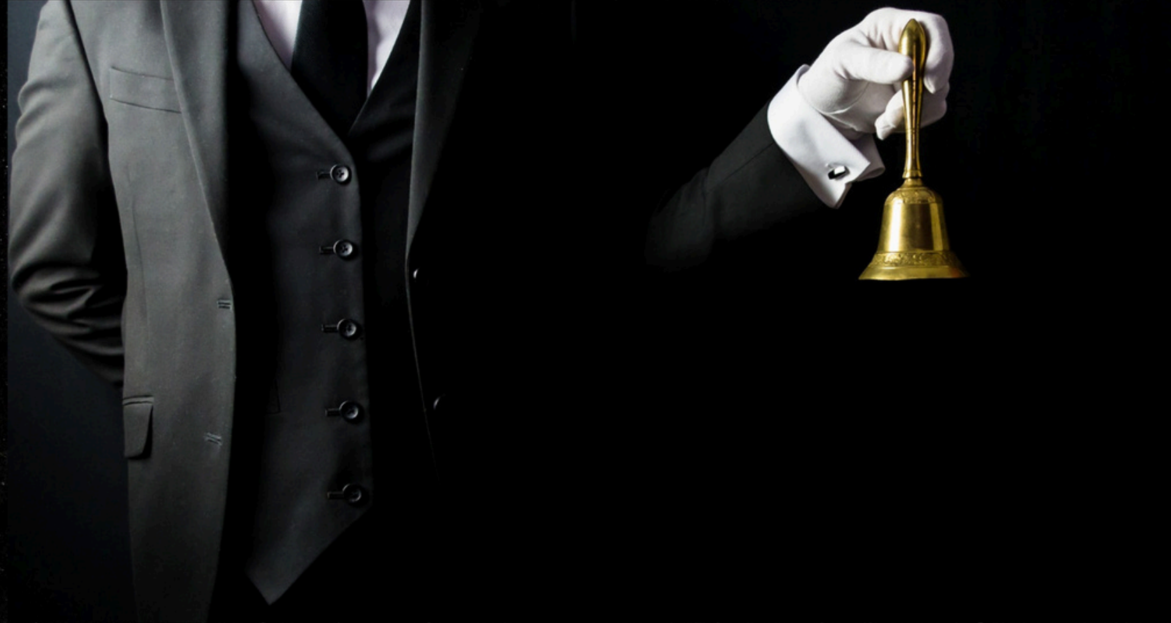
24/7 Luxury Concierge