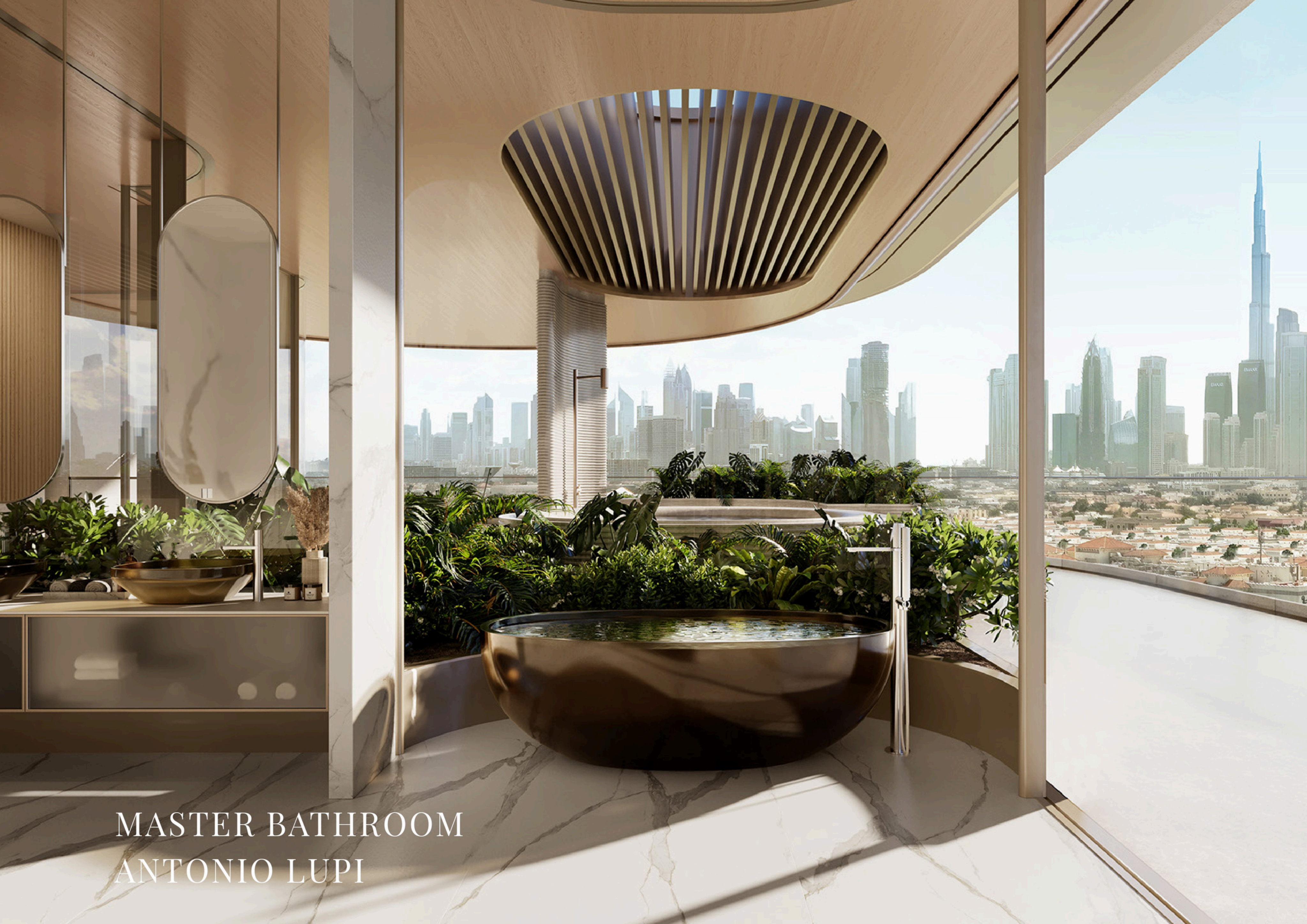
MASTER BATHROOM ANTONIO LUPI