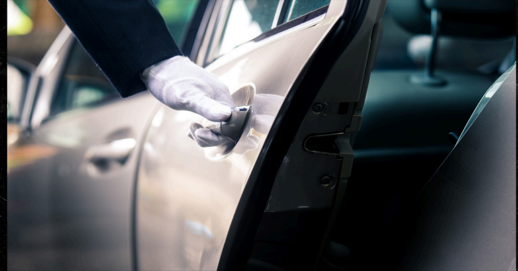
Dedicated Chauffeur Service