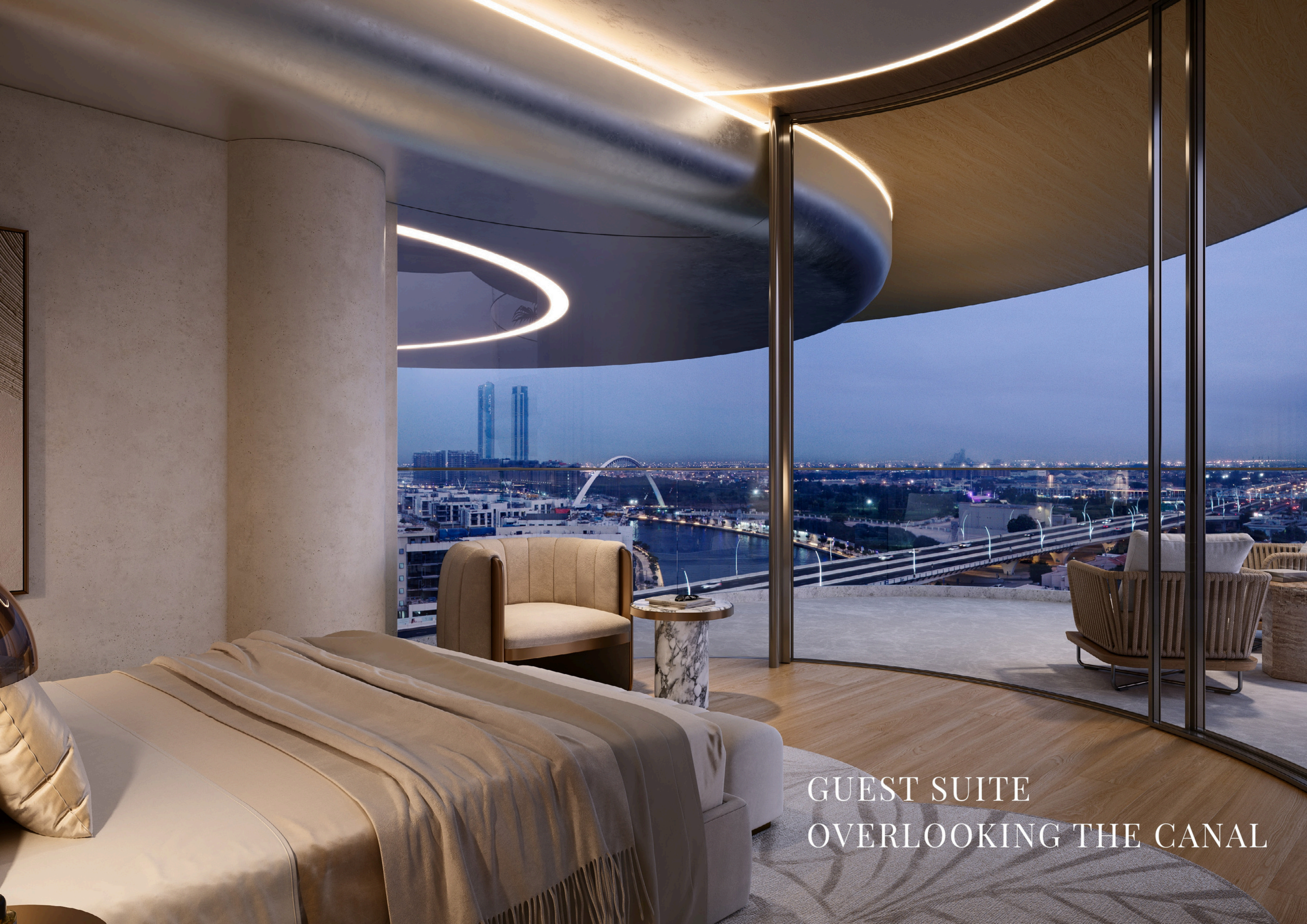
GUEST SUITE OVERLOOKING THE CANAL