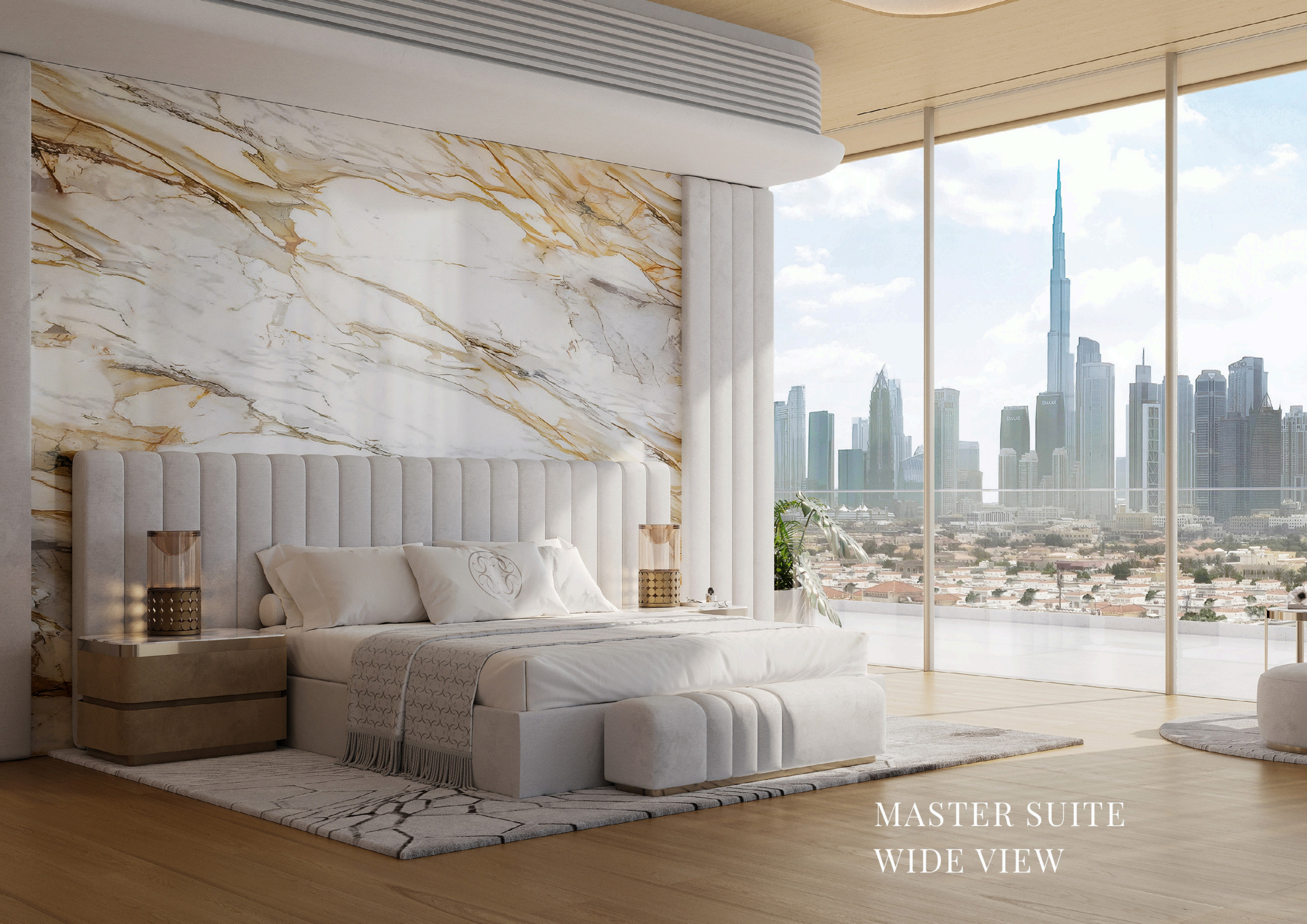
MASTER SUITE WIDE VIEW