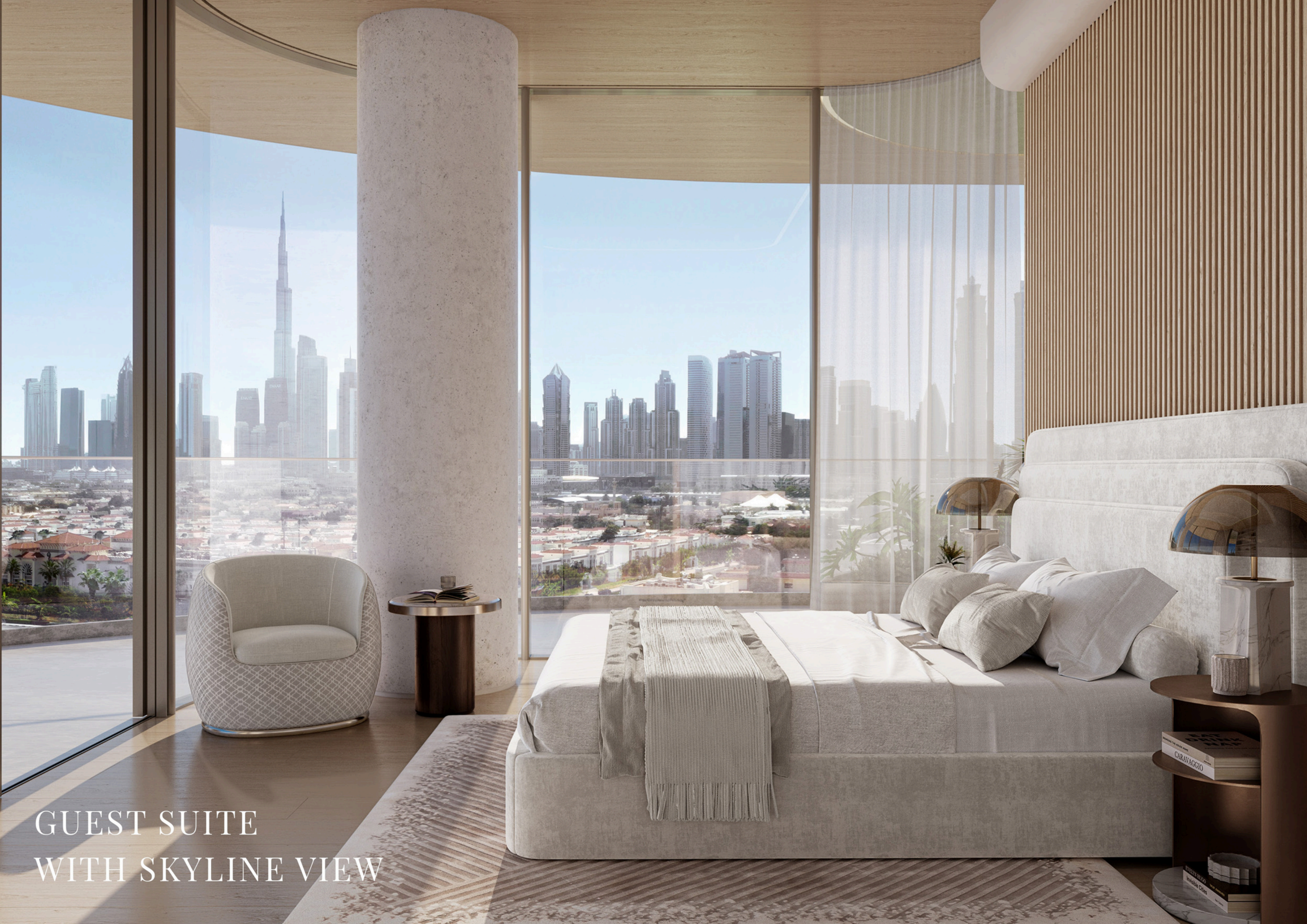
GUEST SUITE WITH SKYLINE VIEW