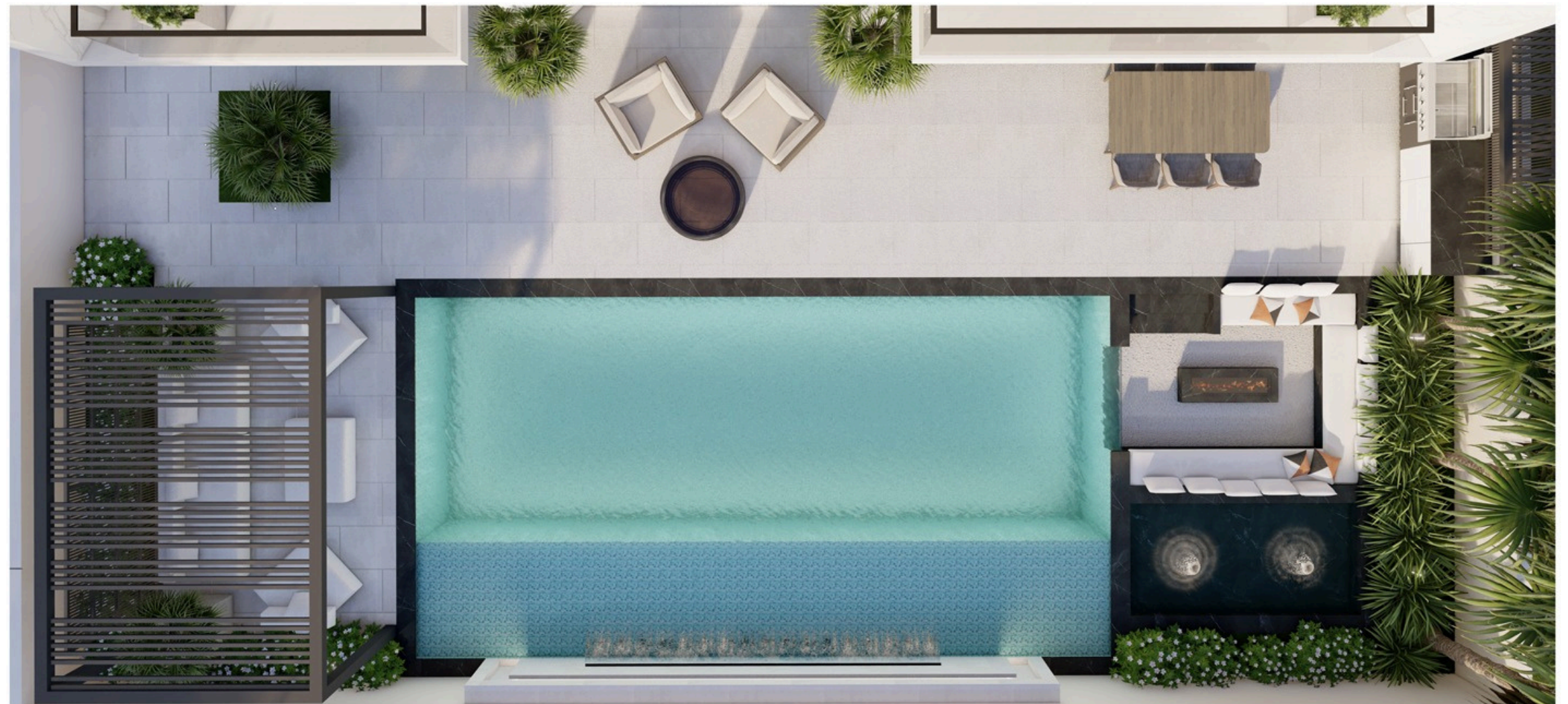
POOL AREA TOP VIEW

Flanking the dining area, additional seating beckons, offering a place to lounge and soak in the serene surroundings. Whether you're basking in the sun's warm embrace during the day or stargazing in the evening, these outdoor spaces provide the perfect setting for relaxation and rejuvenation.