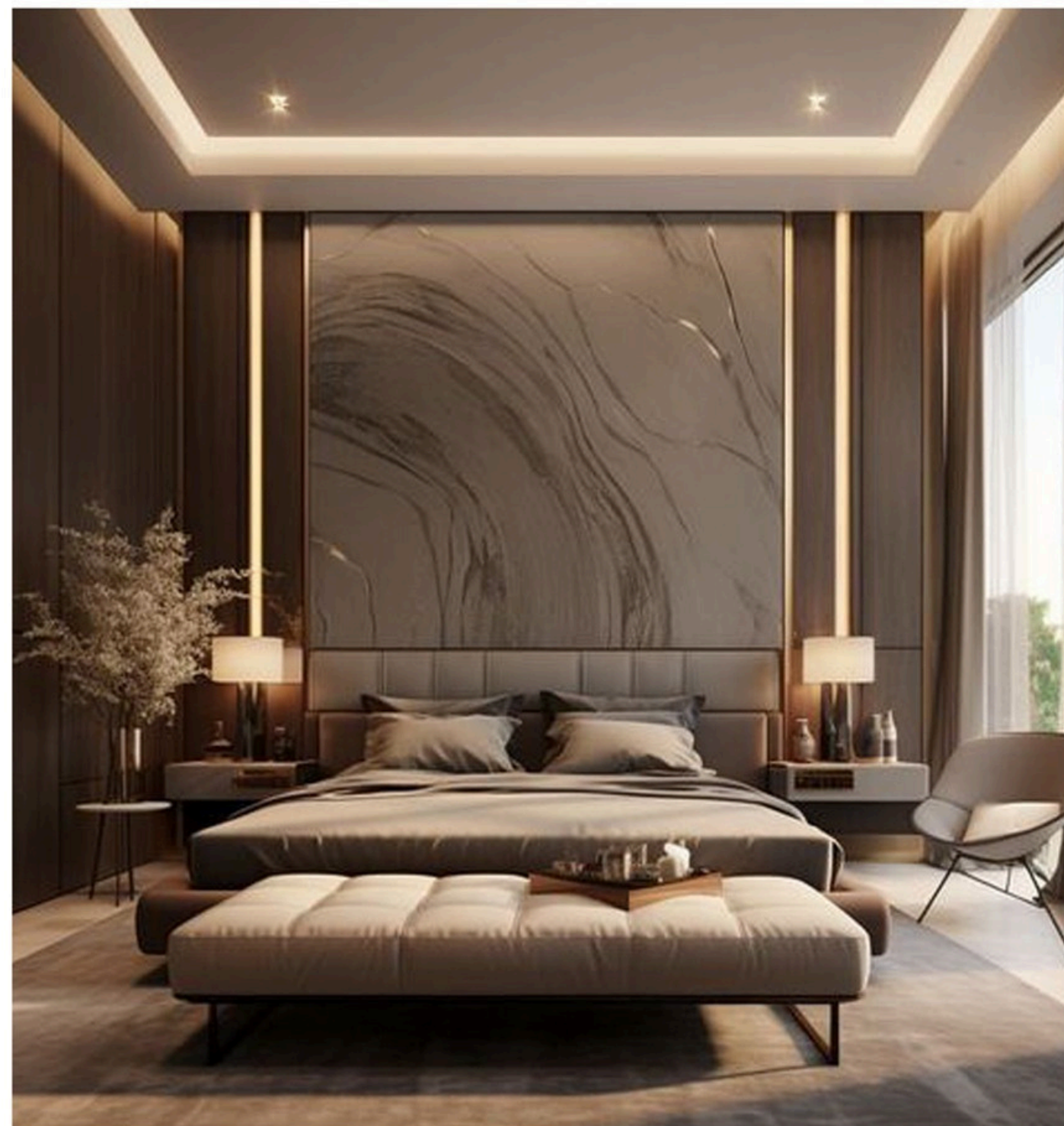
REFERENCE FOR BEDROOM INTERIOR CONCEPT