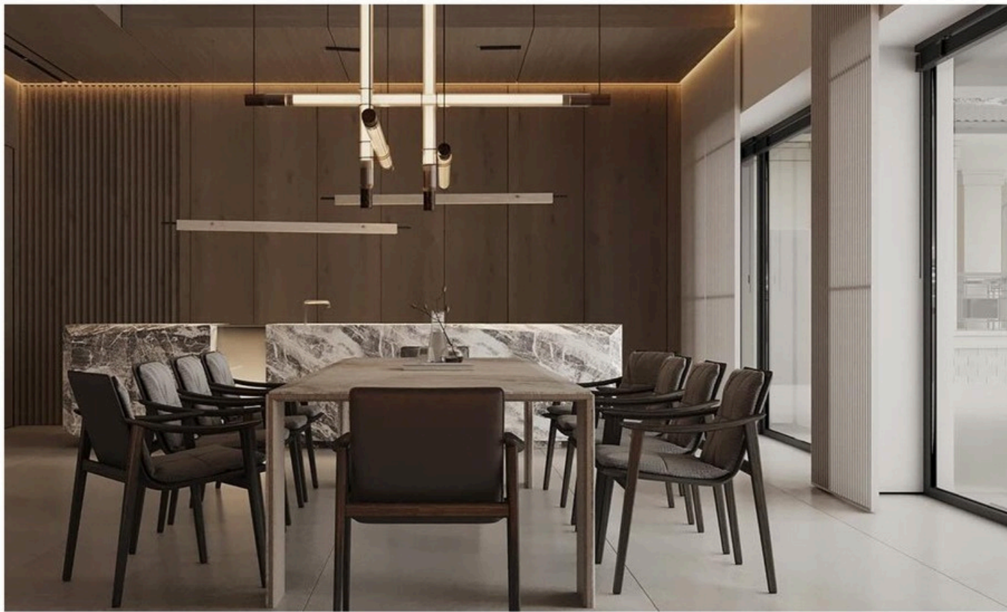
REFERENCE FOR INTERIOR CONCEPT