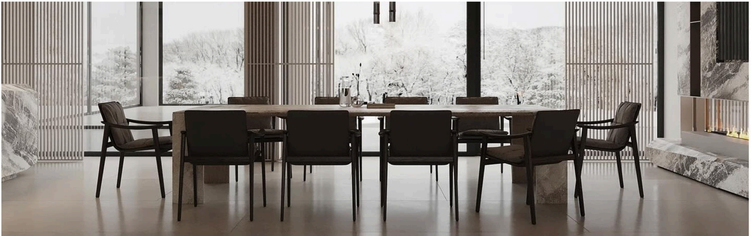
REFERENCE FOR INTERIOR CONCEPT