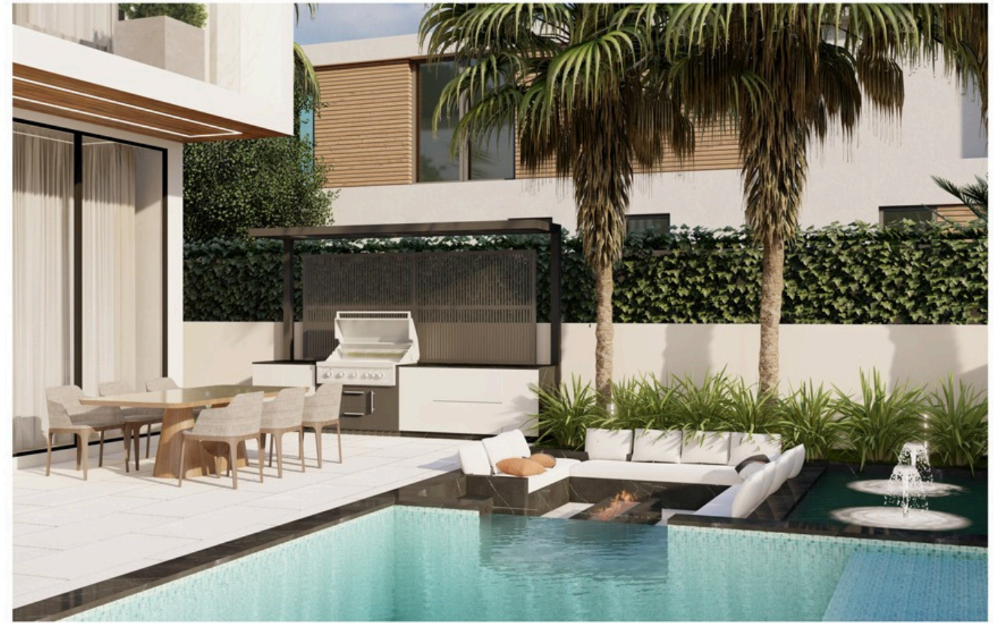
SUNKEN FIRE PLACE

Imagine stepping out of the elegant living spaces of our villa project in Dubai and being greeted by a pool area that epitomizes luxury and comfort. As you gaze upon this