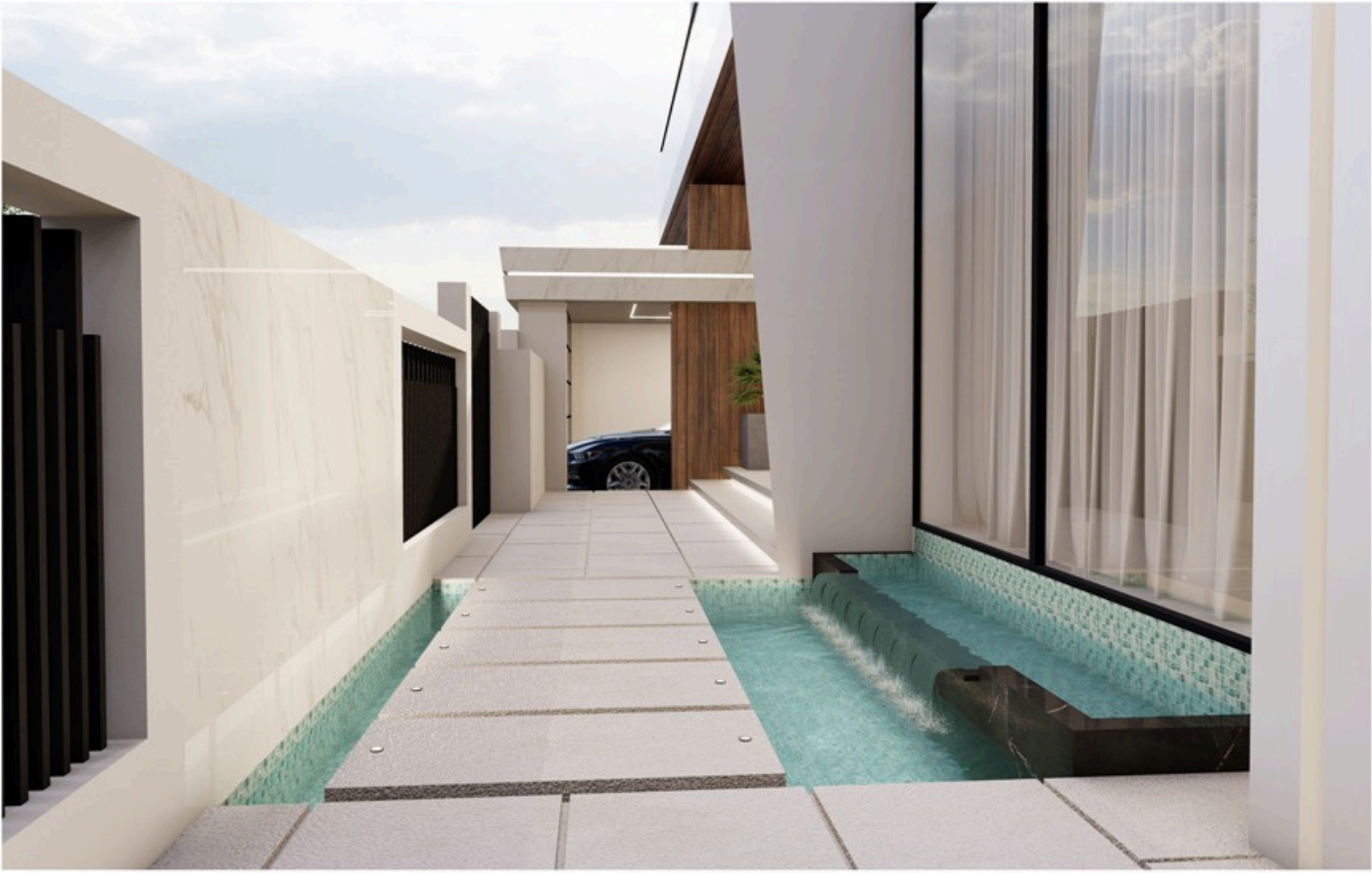
ENTRANCE WATER FEATURE