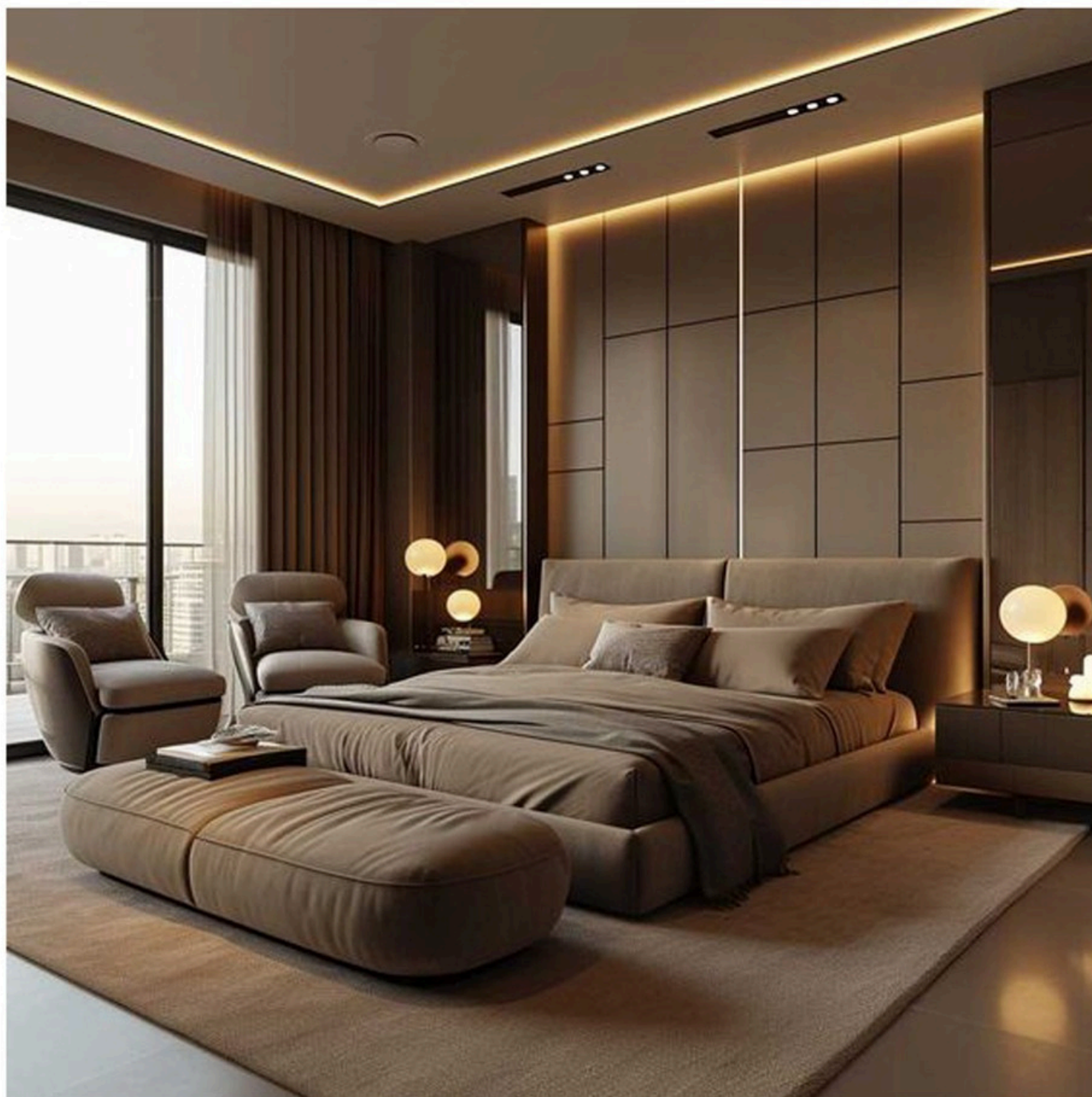
REFERENCE FOR BEDROOM INTERIOR CONCEPT