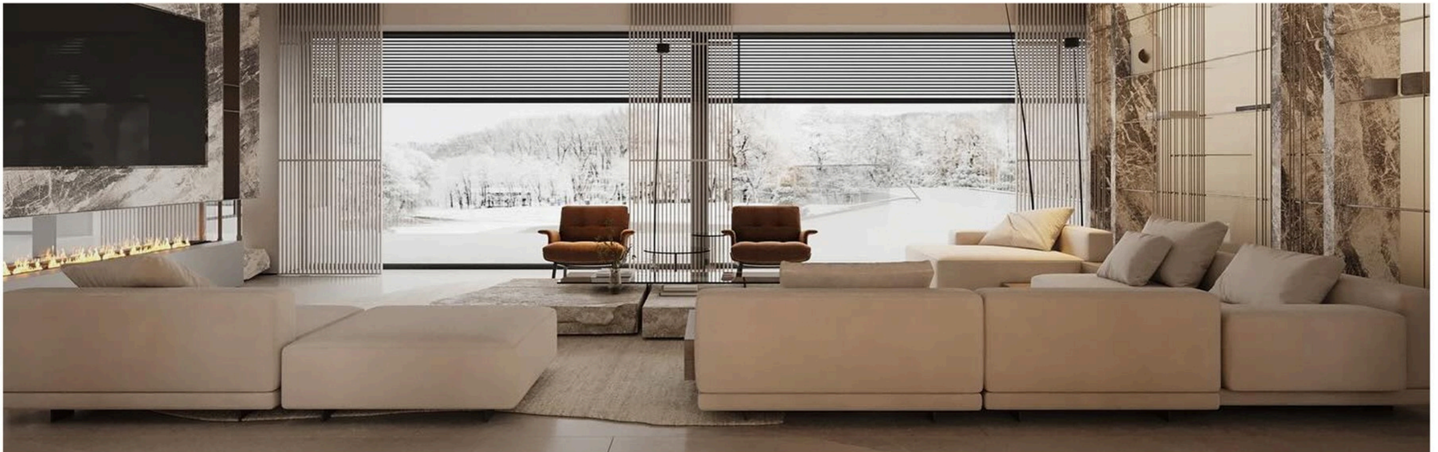
REFERENCE FOR INTERIOR CONCEPT

The interior concept of our villa project in Dubai embraces a color palette inspired by the timeless beauty of the desert landscape, with shades of ivory and desert sand weaving together to create a serene and sophisticated ambiance. As you step into the villa, you are greeted by an atmosphere of understated elegance and warmth. The walls are adorned in hues of ivory, evoking a sense of purity and tranquility, while accents of desert sand add depth and texture to the space