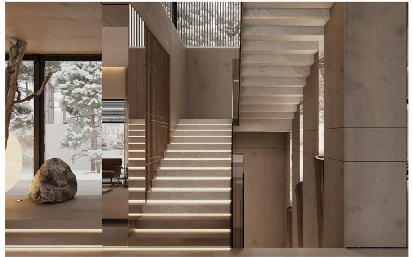
REFERENCE FOR INTERIOR CONCEPT

The interior concept of our villa project in Dubai embraces a color palette inspired by the timeless beauty of the desert landscape, with shades of ivory and desert sand weaving together to create a serene and sophisticated ambiance. As you step into the villa, you are greeted by an atmosphere of understated elegance and warmth. The walls are adorned in hues of ivory, evoking a sense of purity and tranquility, while accents of desert sand add depth and texture to the space