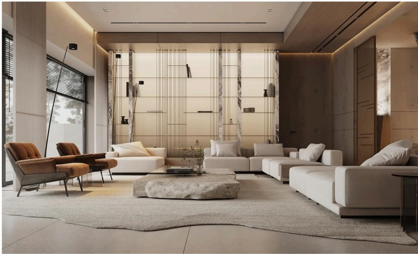
REFERENCE FOR INTERIOR CONCEPT