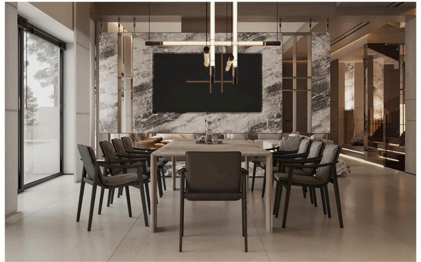
REFERENCE FOR INTERIOR CONCEPT