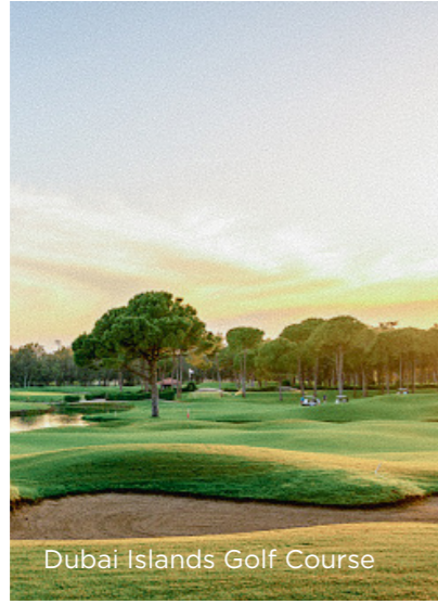
Dubai Islands Golf Course