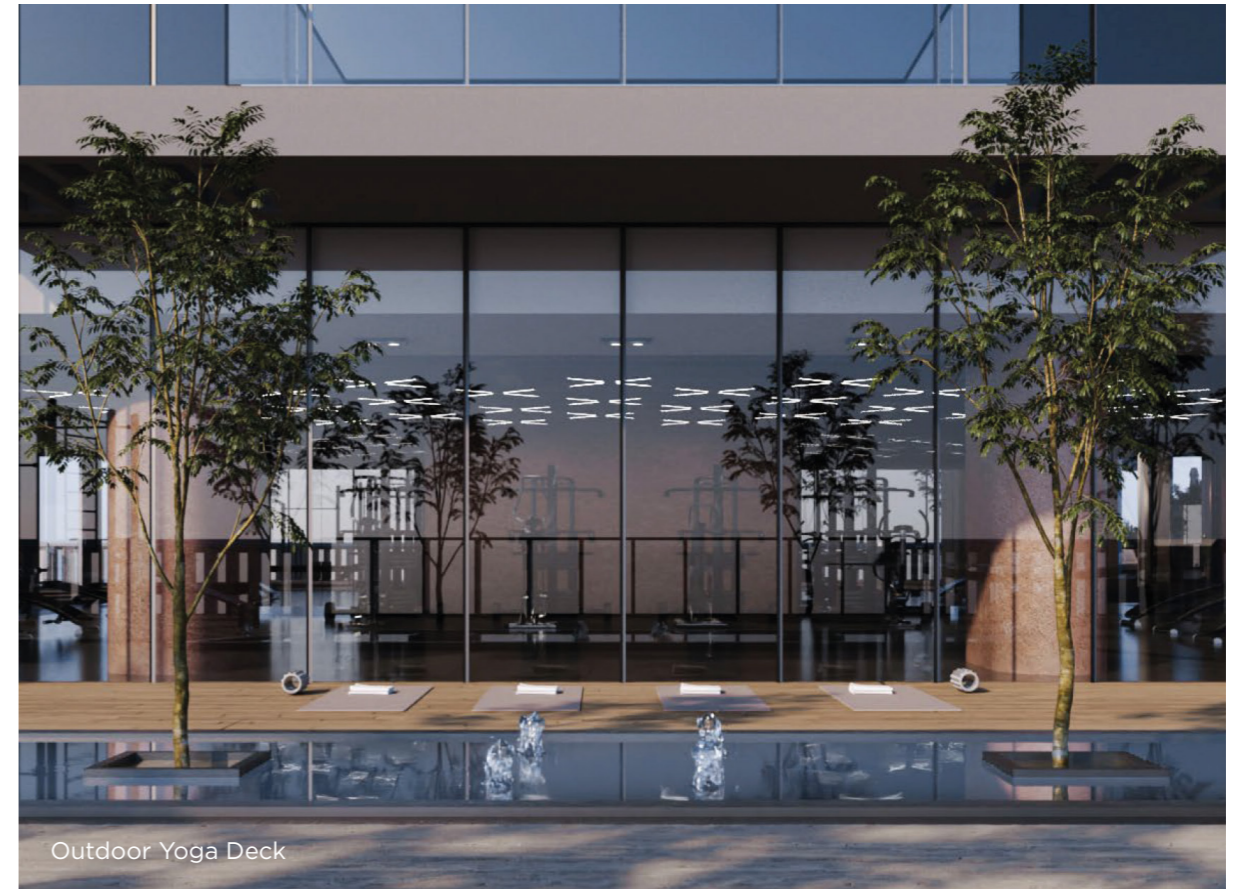
Outdoor Yoga Deck