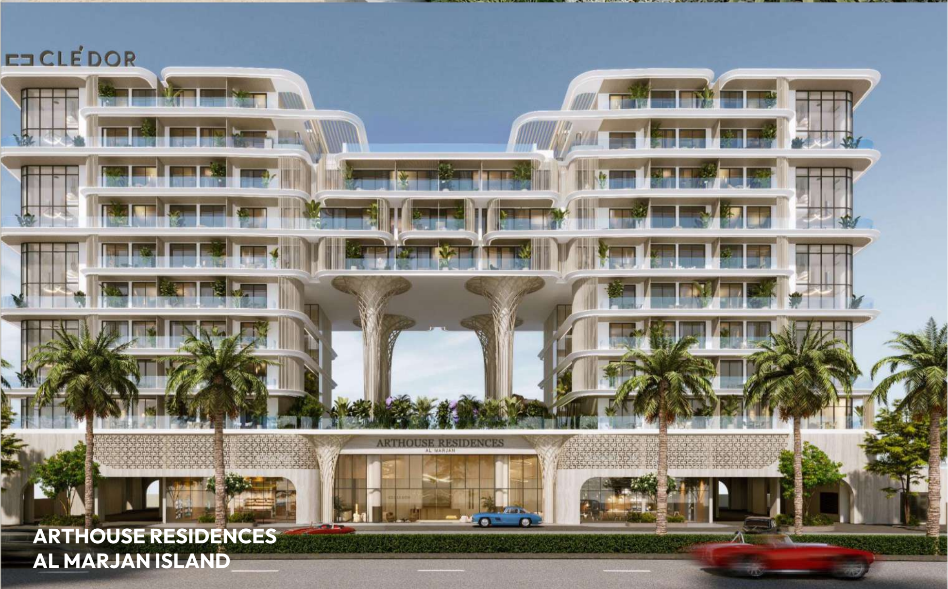
ARTHOUSE RESIDENCES AL MARJAN ISLAND