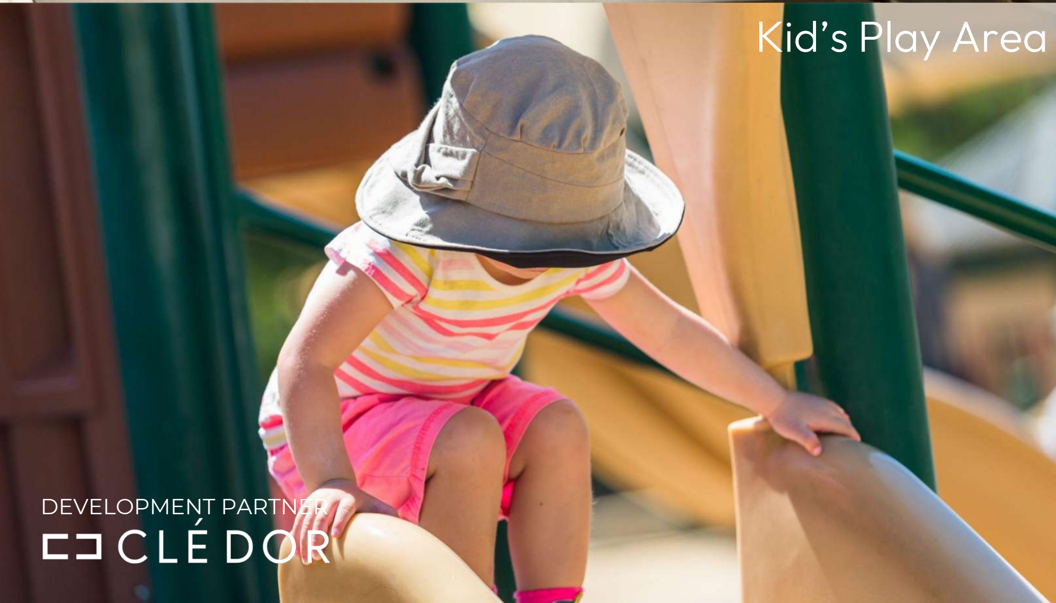
Kid's Play Area