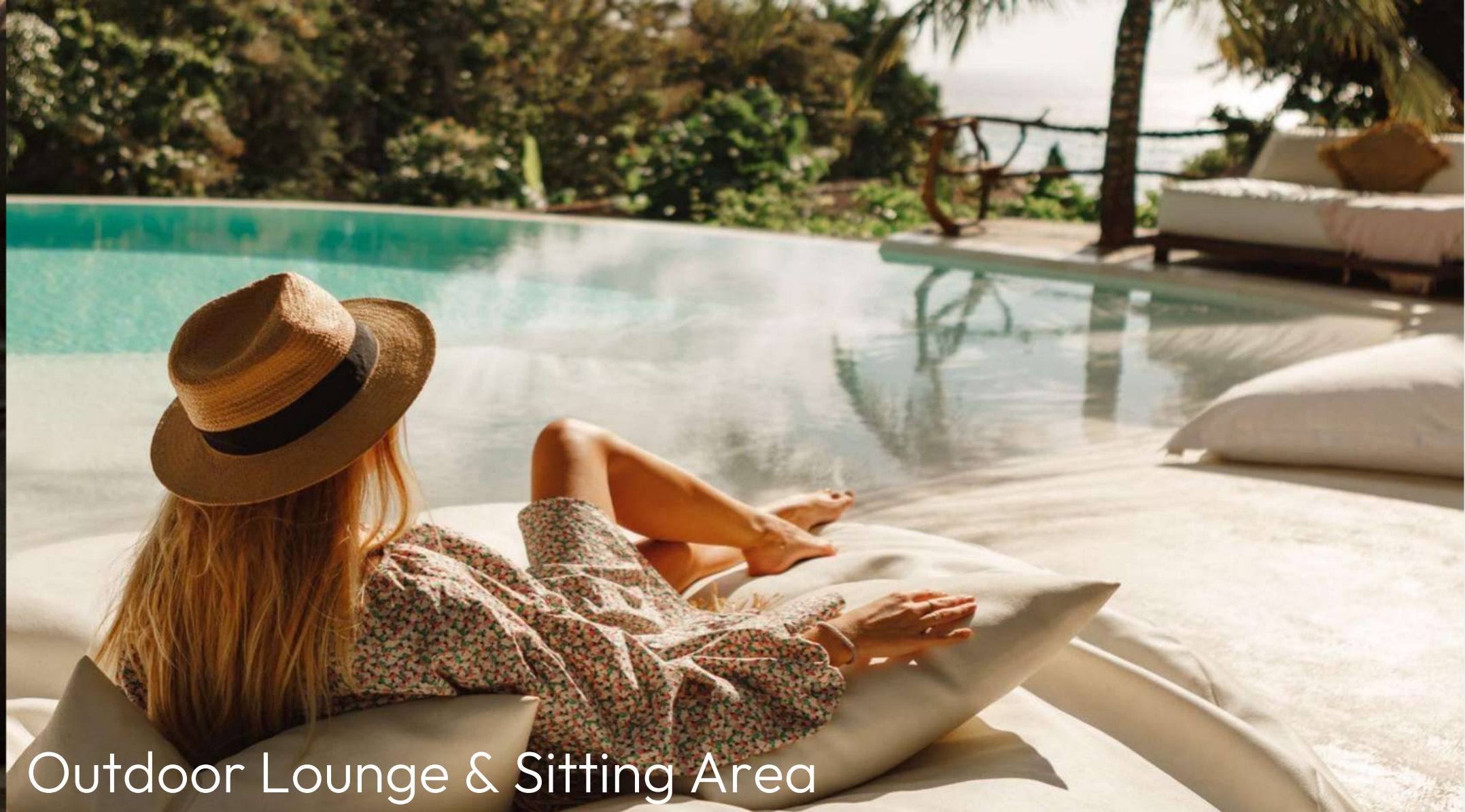
Outdoor Lounge & Sitting Area