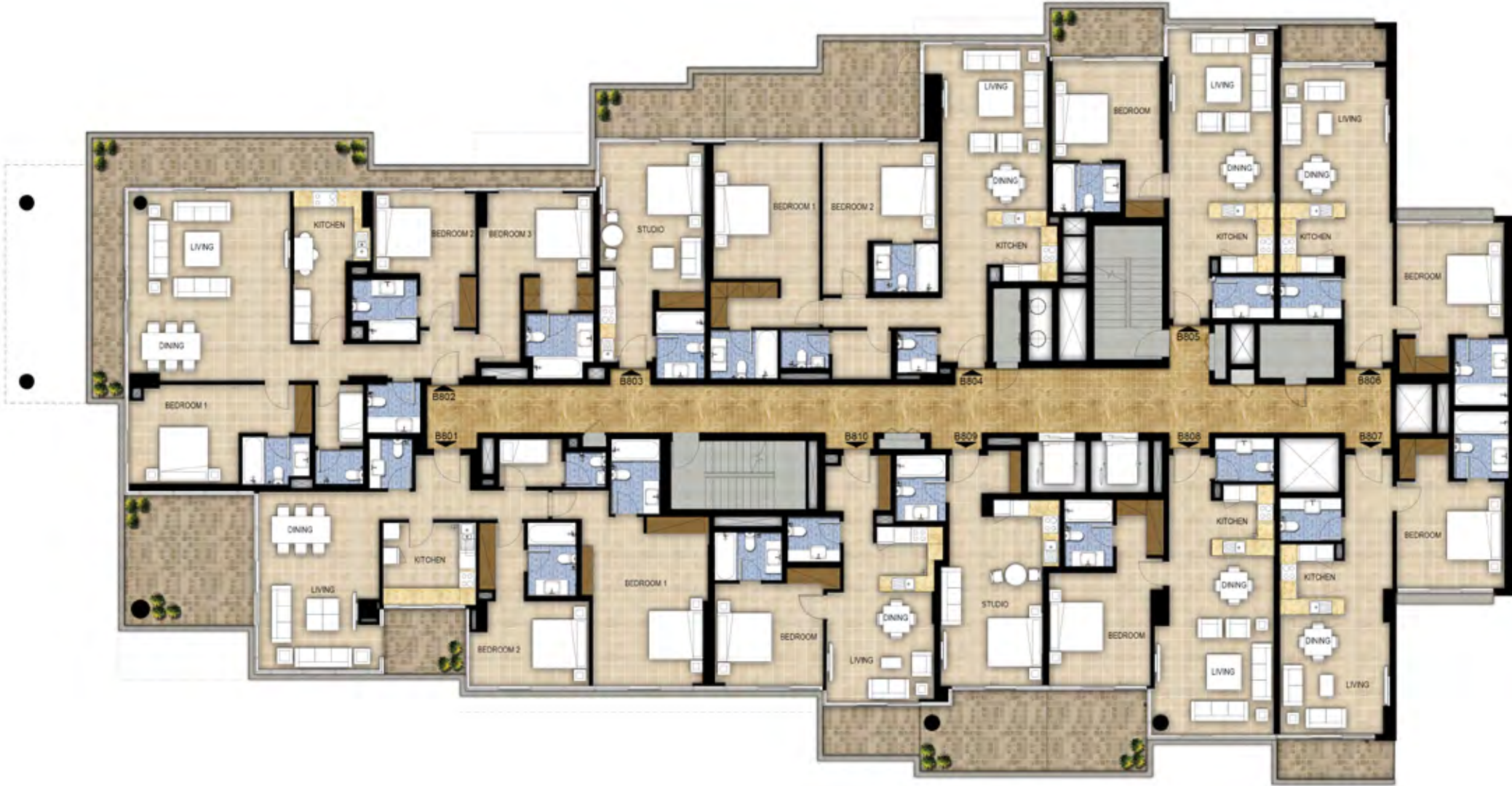
GOLF PROMENADE 3, 4 & 5 TOWER B - LEVEL 08