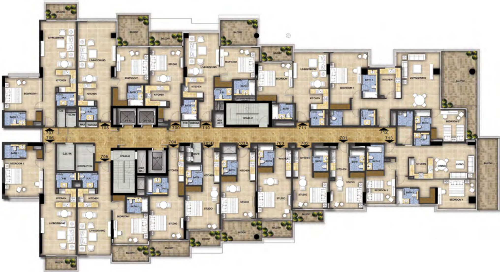
GOLF PROMENADE 2 TOWER B - LEVEL 07