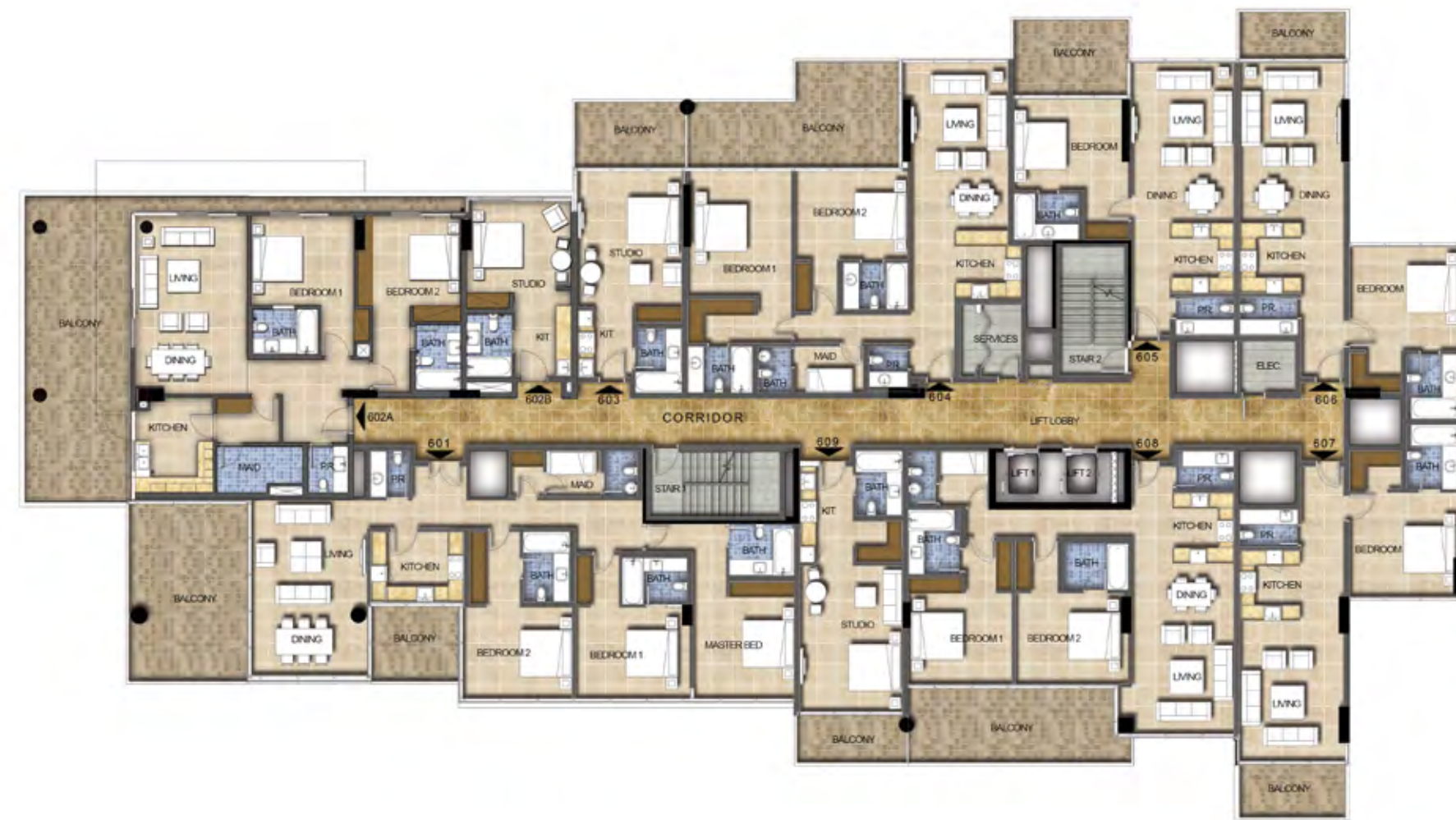
GOLF PANORAMA | GOLF VISTA | GOLF HORIZON TOWER B - LEVEL 06