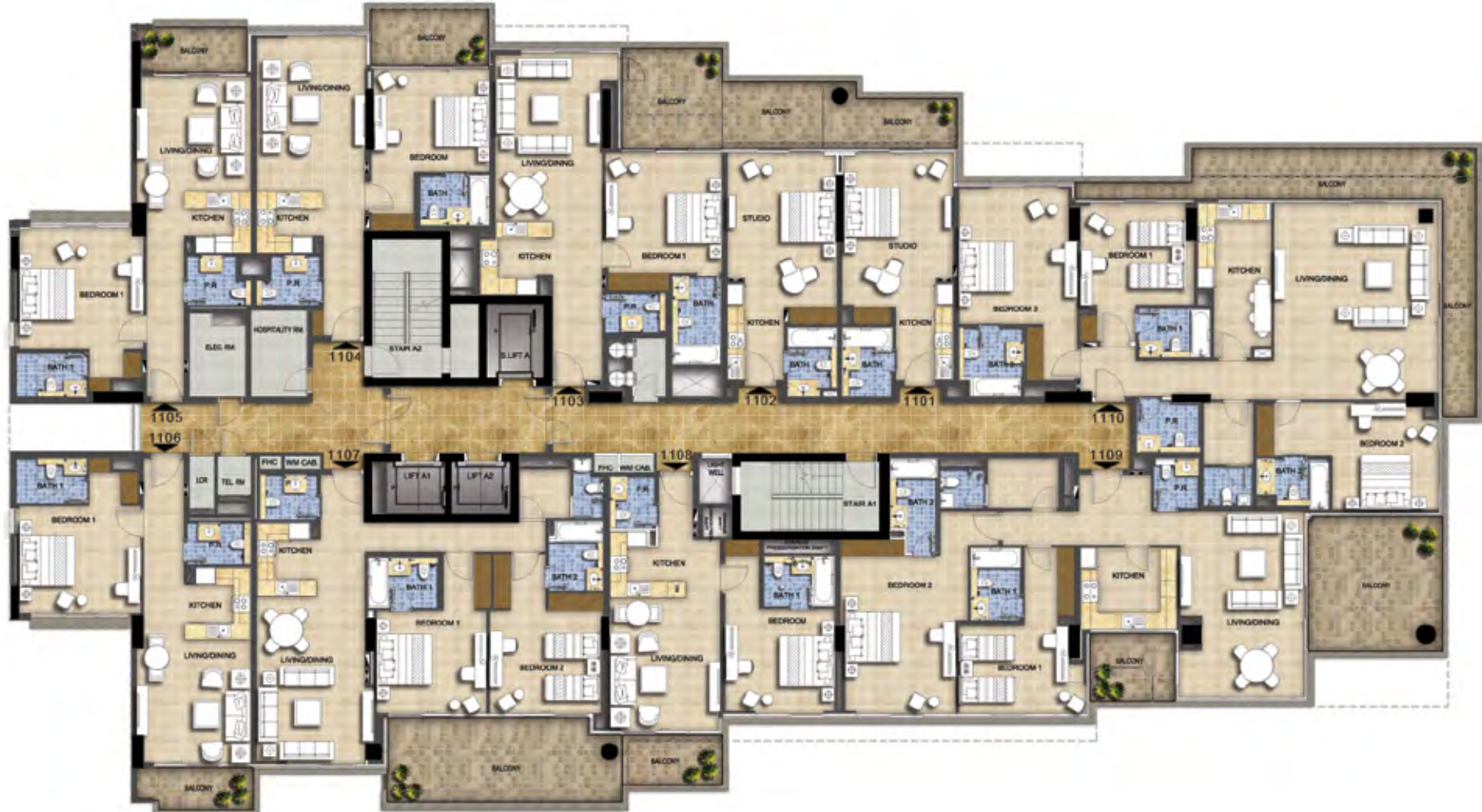
GOLF PROMENADE 2 TOWER A - LEVEL 11