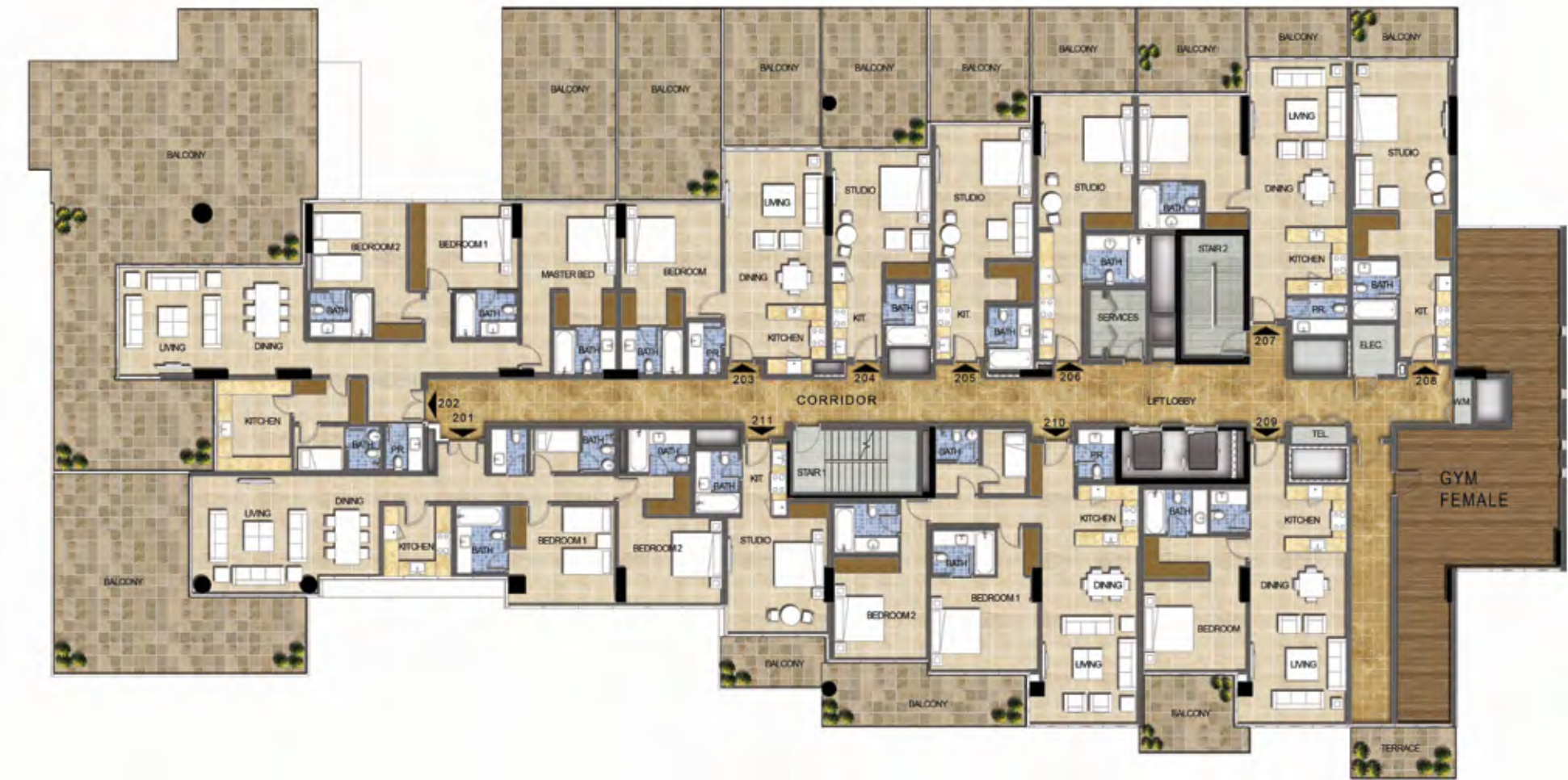
GOLF PANORAMA | GOLF VISTA | GOLF HORIZON TOWER B - LEVEL 02