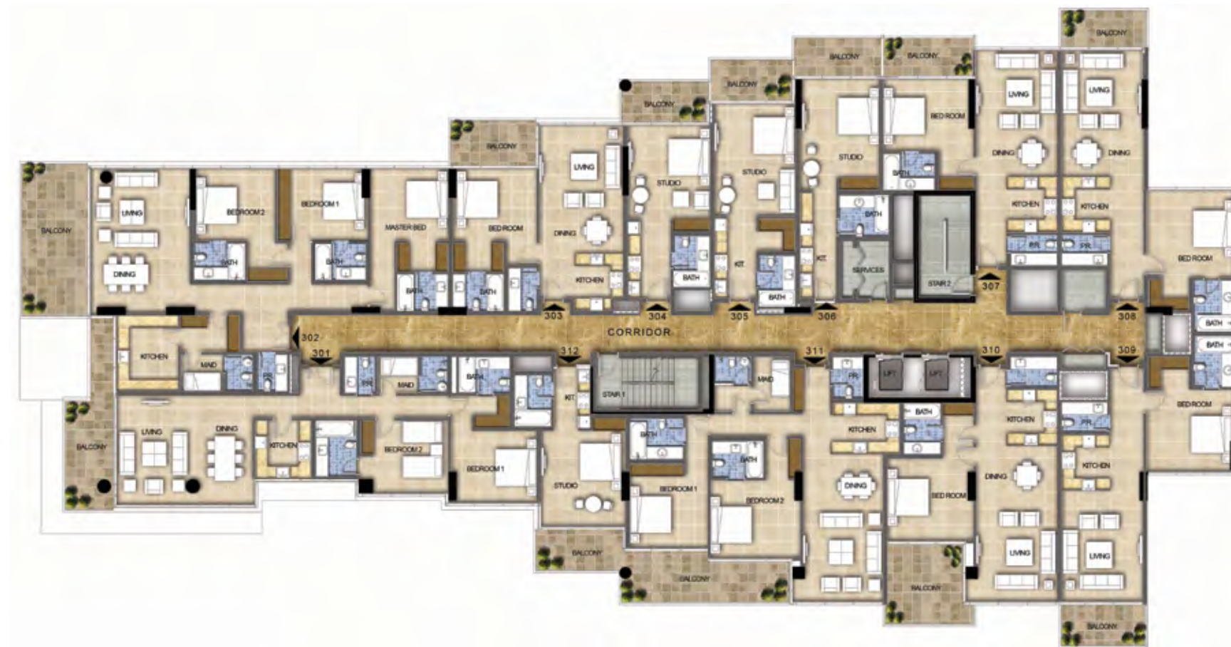
GOLF VEDUTA | GOLF TERRACE TOWER B - LEVEL 03