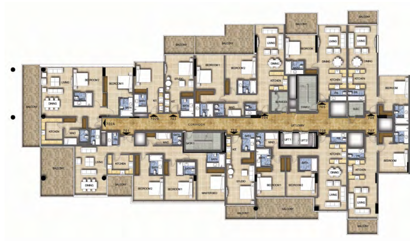
GOLF PANORAMA | GOLF HORIZON TOWER B - LEVEL 07