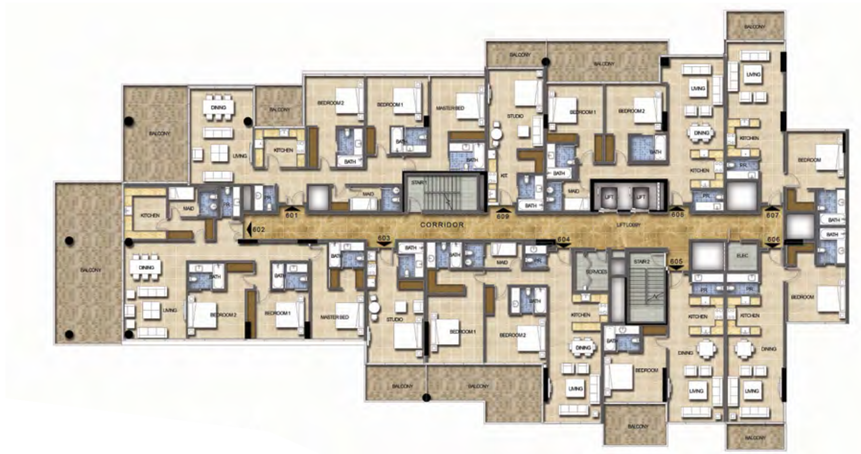
GOLF VEDUTA | GOLF TERRACE TOWER A - LEVEL 06