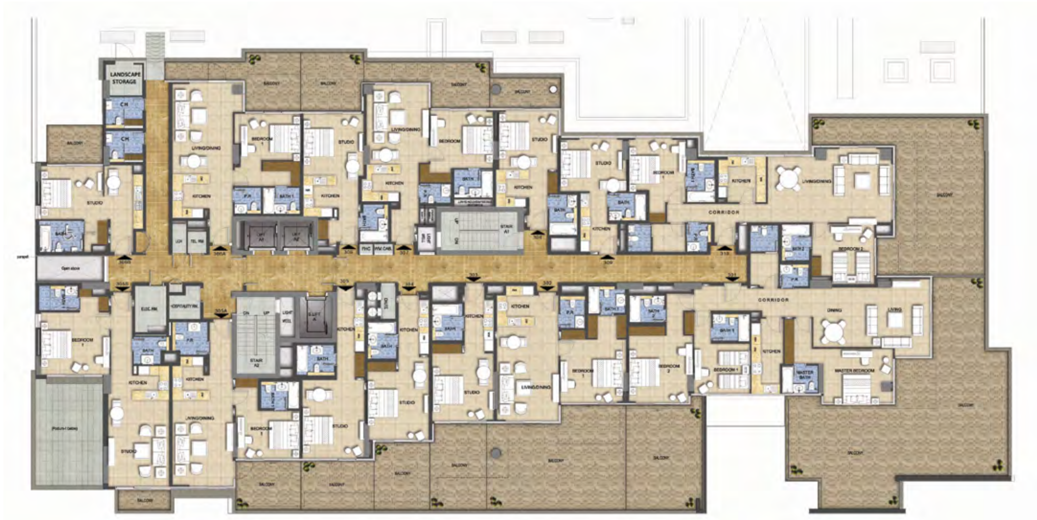
GOLF PROMENADE 2 TOWER B - LEVEL 03