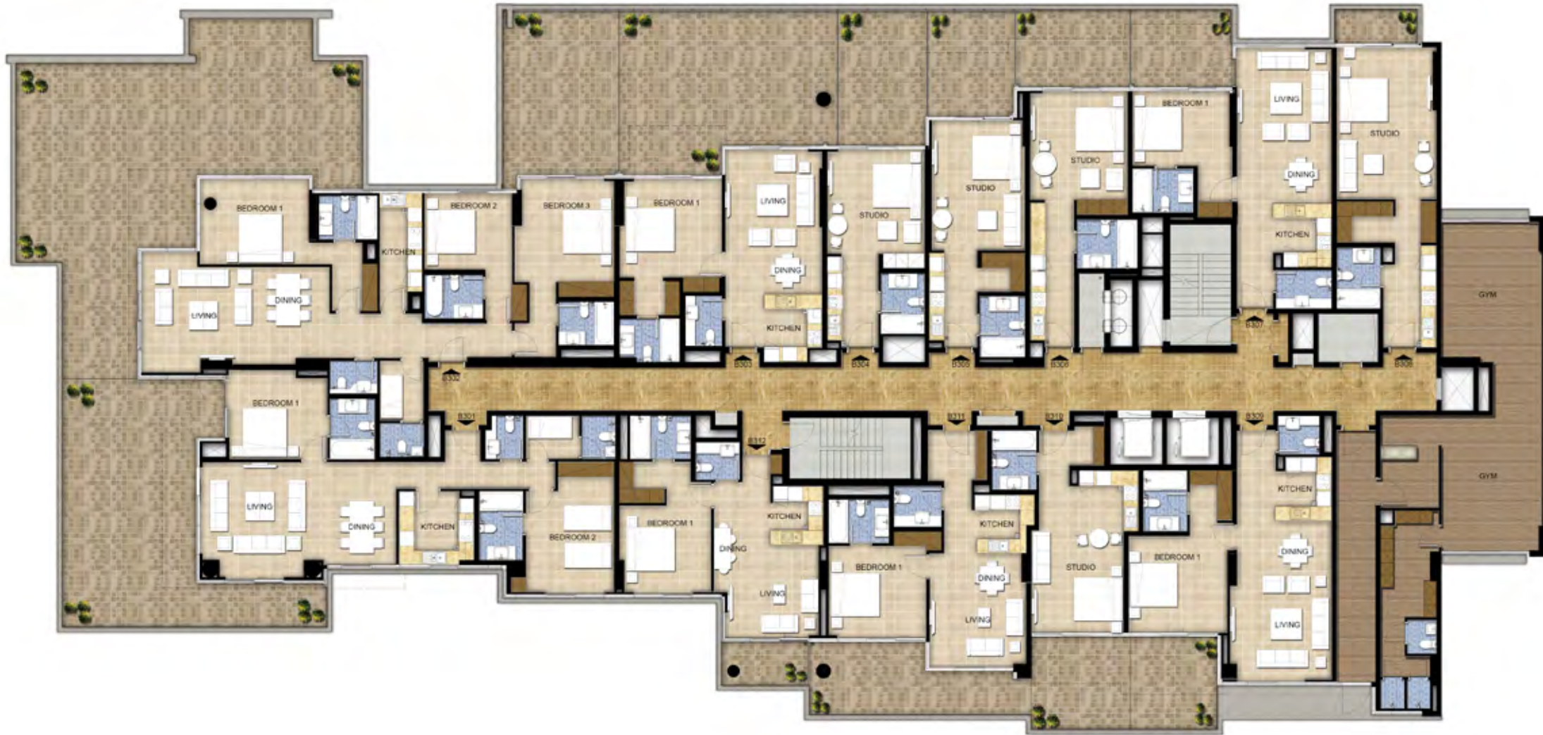
GOLF PROMENADE 3, 4 & 5 TOWER B - LEVEL 03

Disclaimer: All pictures, plans, layouts, information, data and details included in this brochure are indicative only and may change at any time up to the final 'as built' status in accordance with final designs of the project, regulatory approvals and planning permissions.