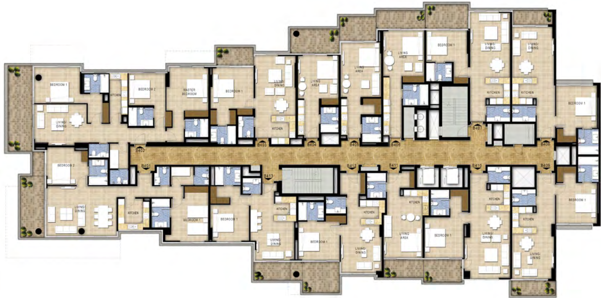
GOLF PROMENADE 3, 4 & 5 TOWER B - LEVEL 04