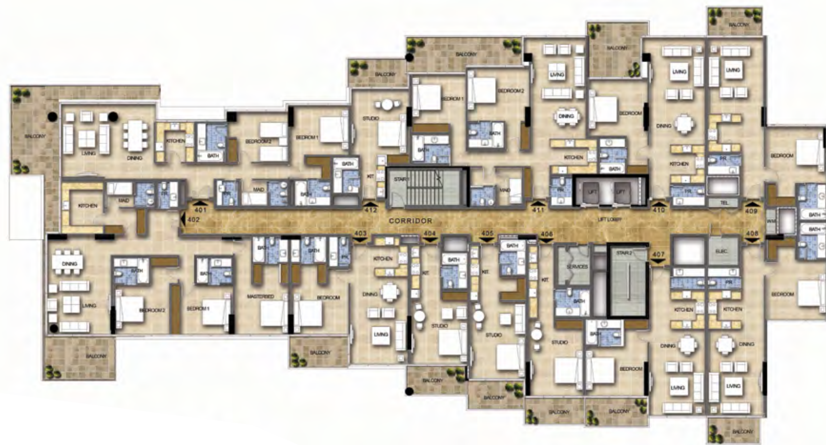
GOLF VEDUTA | GOLF TERRACE TOWER A - LEVEL 04