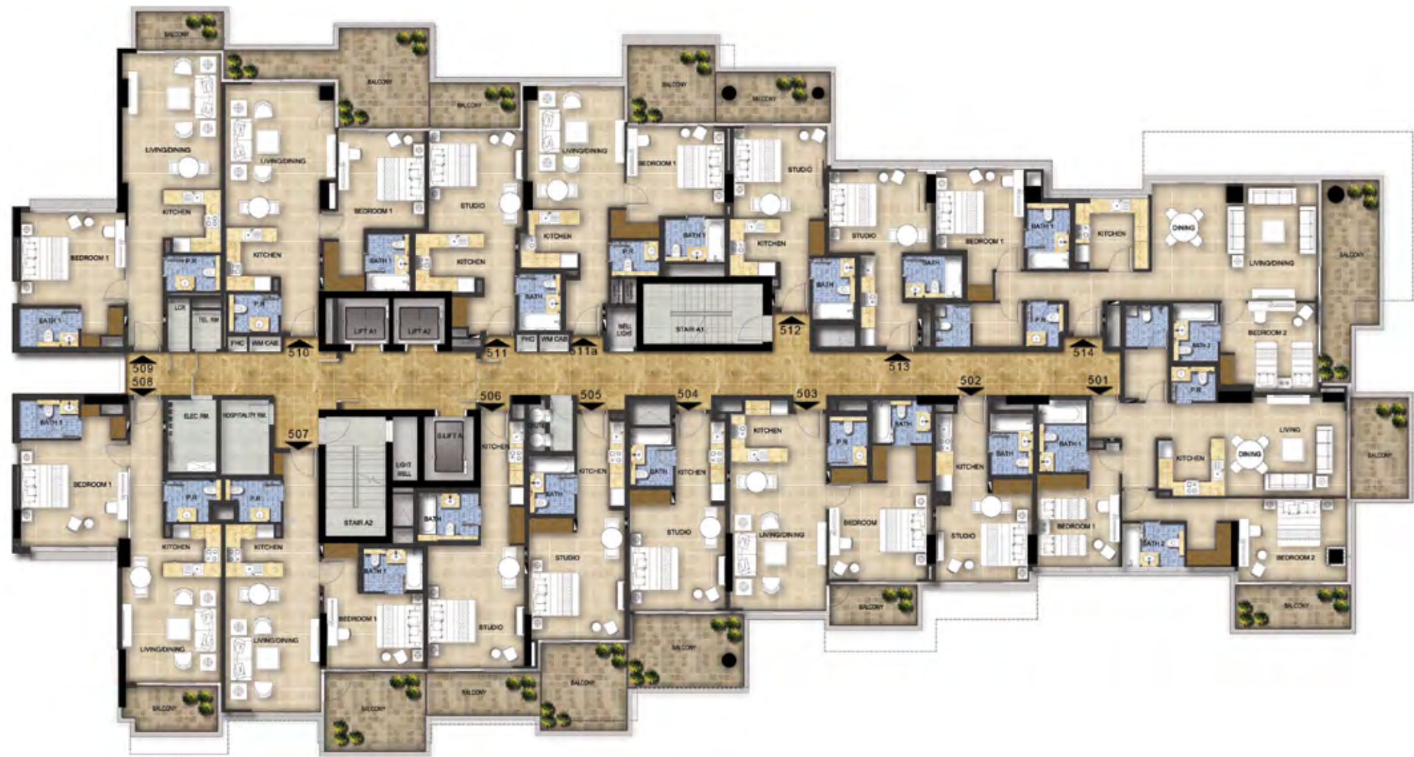
GOLF PROMENADE 2 TOWER B - LEVEL 05