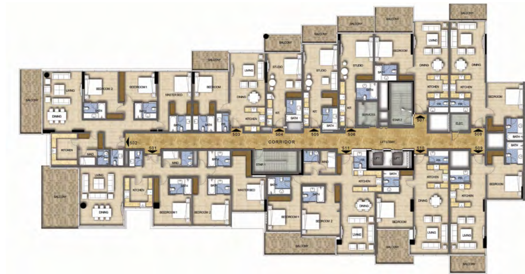
GOLF VEDUTA | GOLF TERRACE TOWER B - LEVEL 05