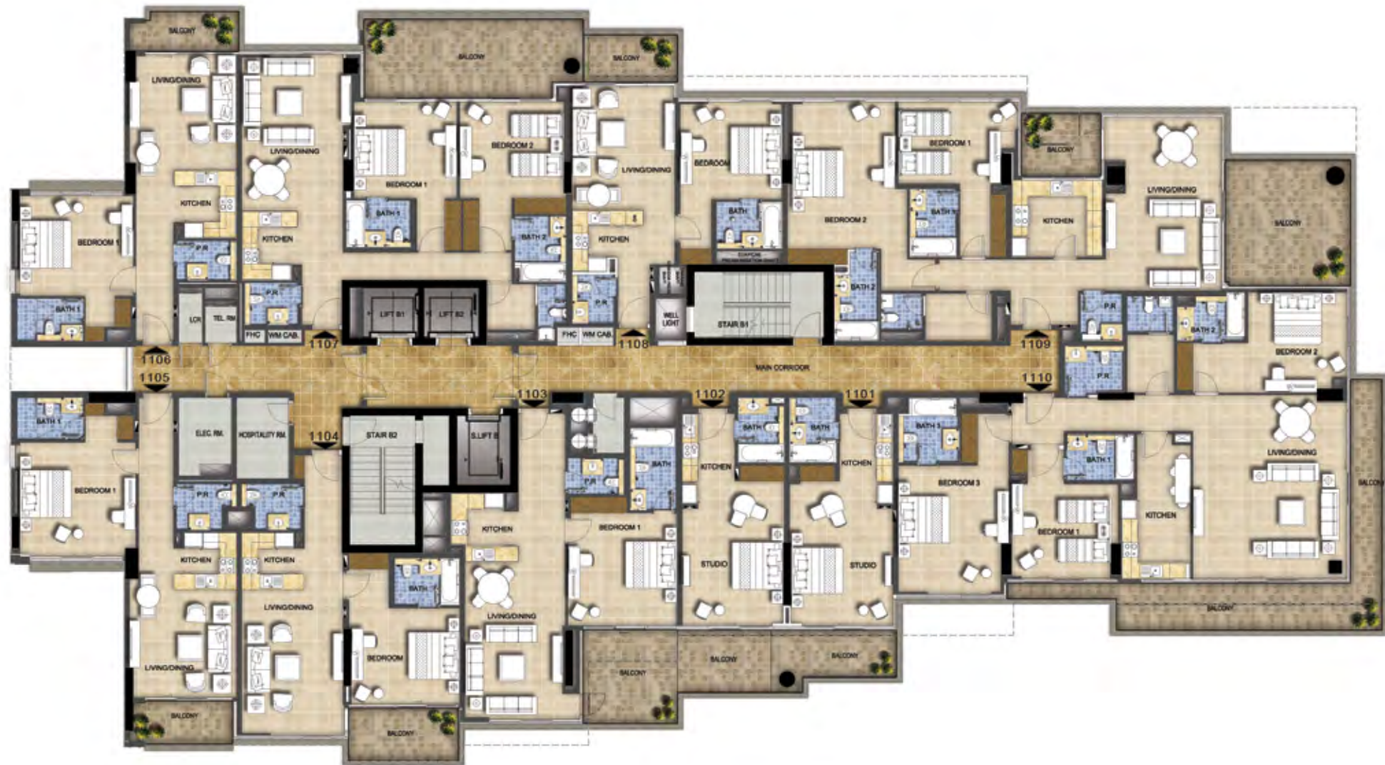
GOLF PROMENADE 2 TOWER B - LEVEL 11