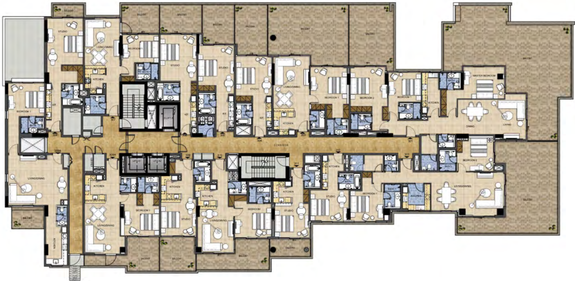
GOLF PROMENADE 2 TOWER A - LEVEL 03