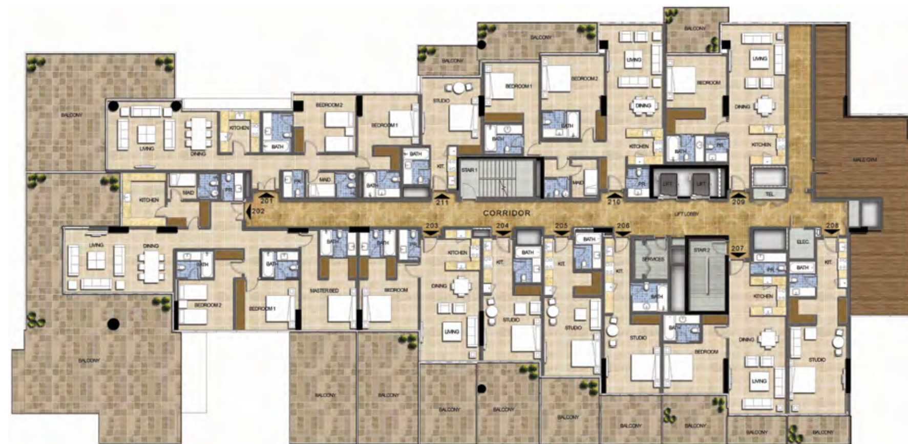
GOLF VEDUTA | GOLF TERRACE TOWER A - LEVEL 02