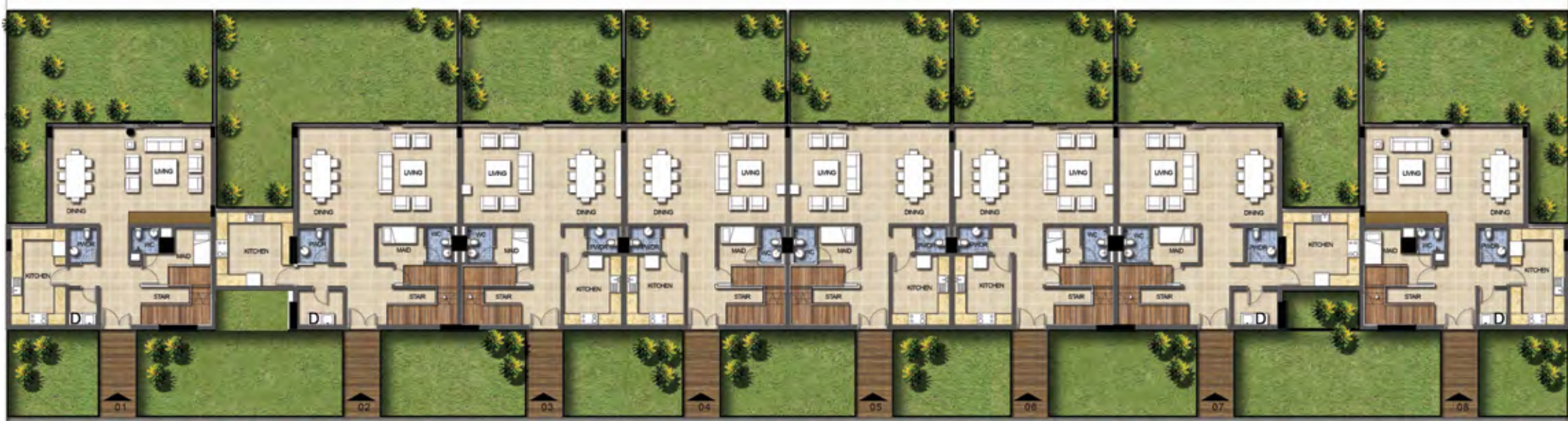
GOLF PROMENADE 3, 4 & 5 TOWER A&B - GROUND LEVEL