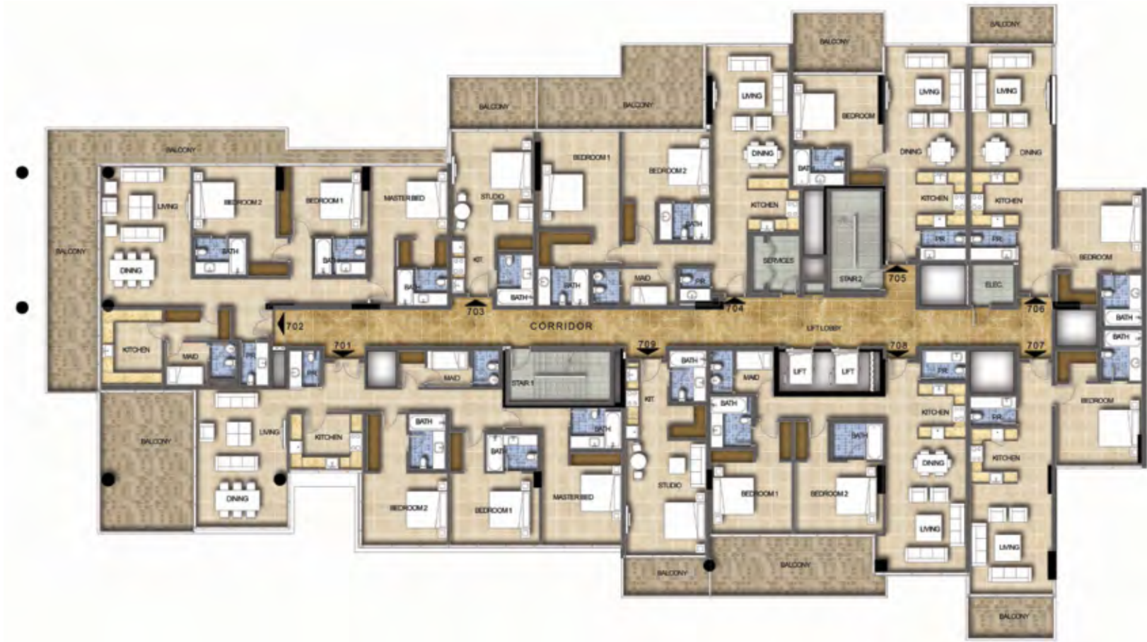
GOLF VEDUTA | GOLF TERRACE TOWER B - LEVEL 07