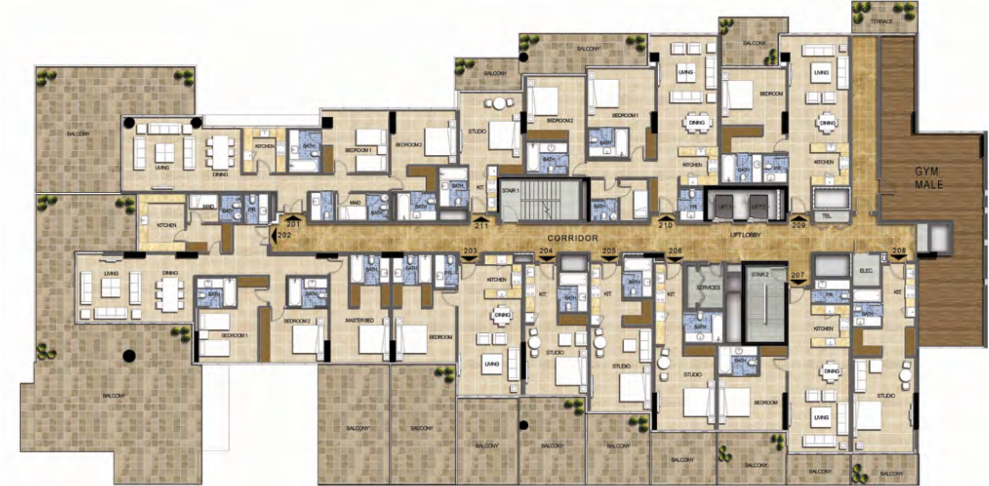
GOLF PANORAMA | GOLF VISTA | GOLF HORIZON TOWER A - LEVEL 02