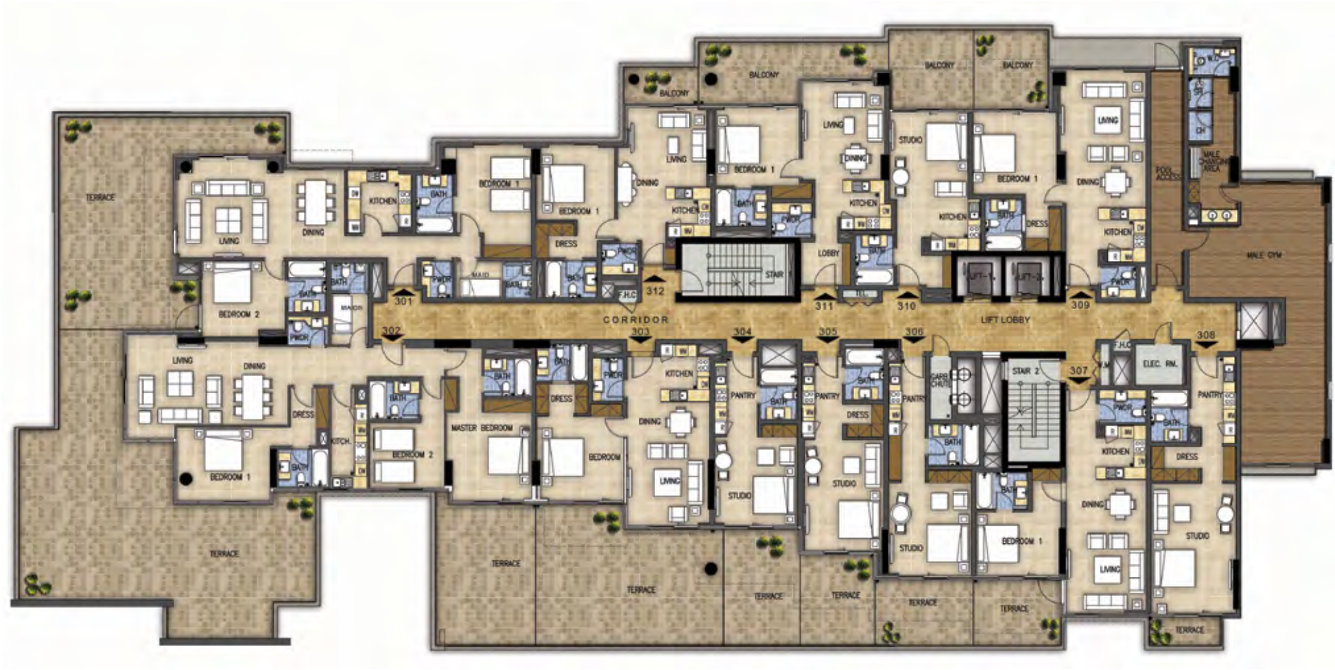
GOLF PROMENADE 3, 4 & 5 TOWER A - LEVEL 03