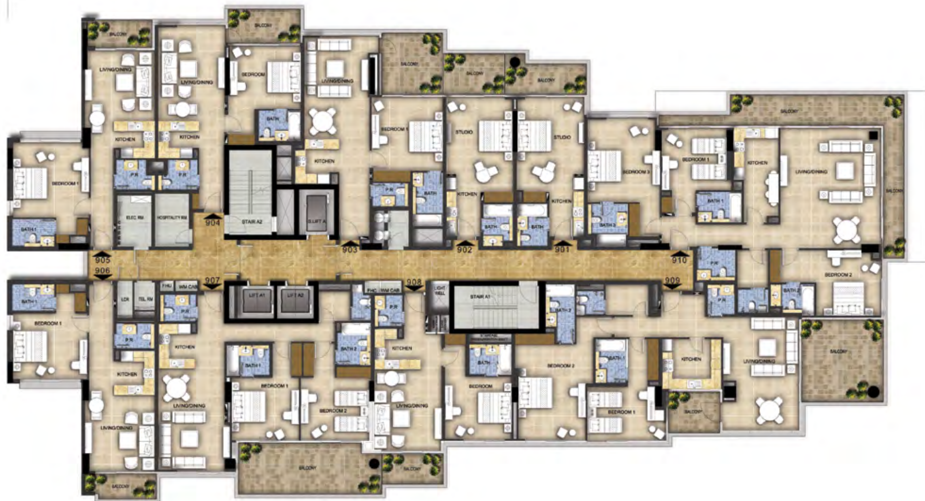
GOLF PROMENADE 2 TOWER A - LEVEL 09