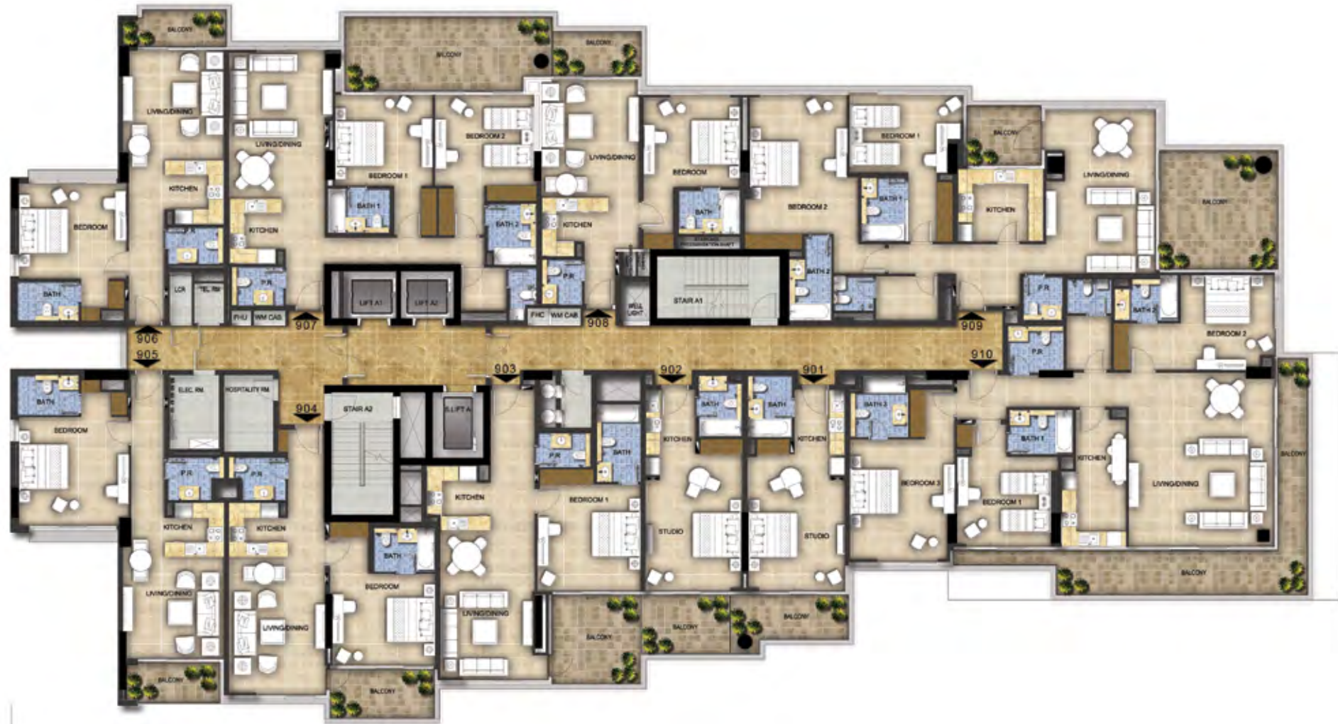
GOLF PROMENADE 2 TOWER B - LEVEL 09