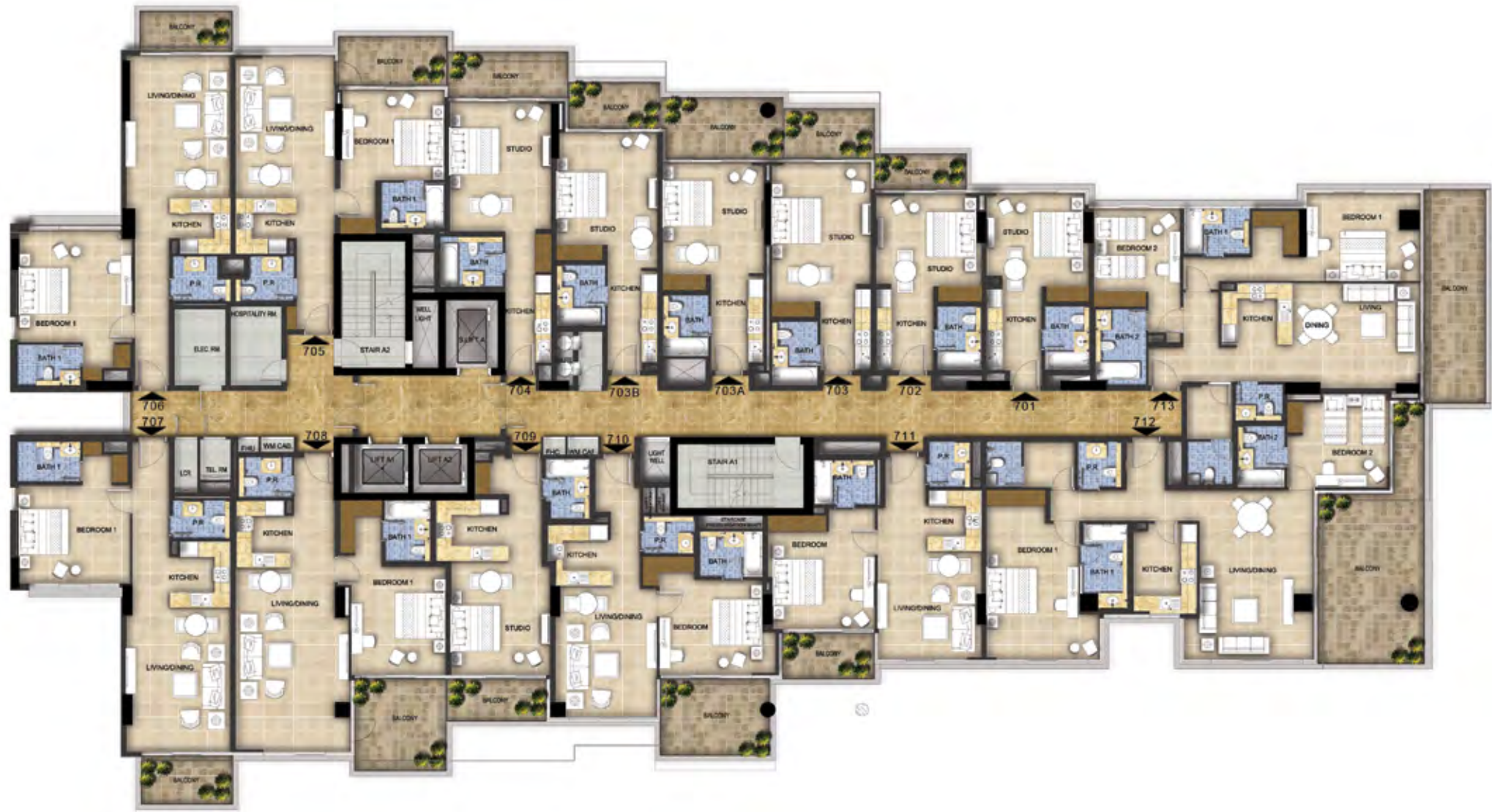
GOLF PROMENADE 2 TOWER A - LEVEL 07