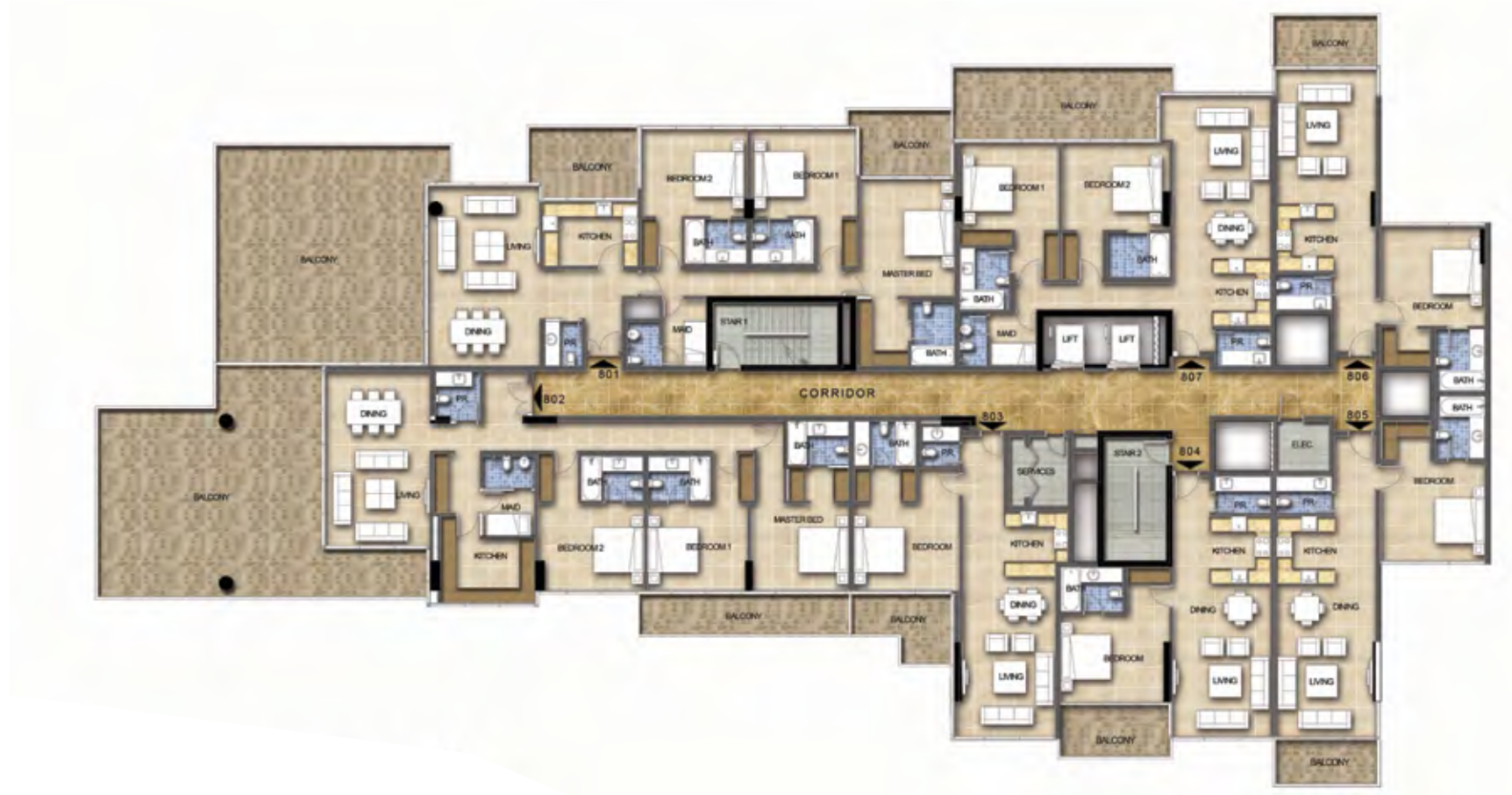
GOLF VEDUTA | GOLF TERRACE TOWER A - LEVEL 08