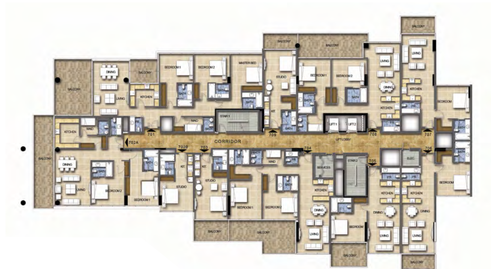
GOLF PANORAMA | GOLF VISTA TOWER A - LEVEL 07