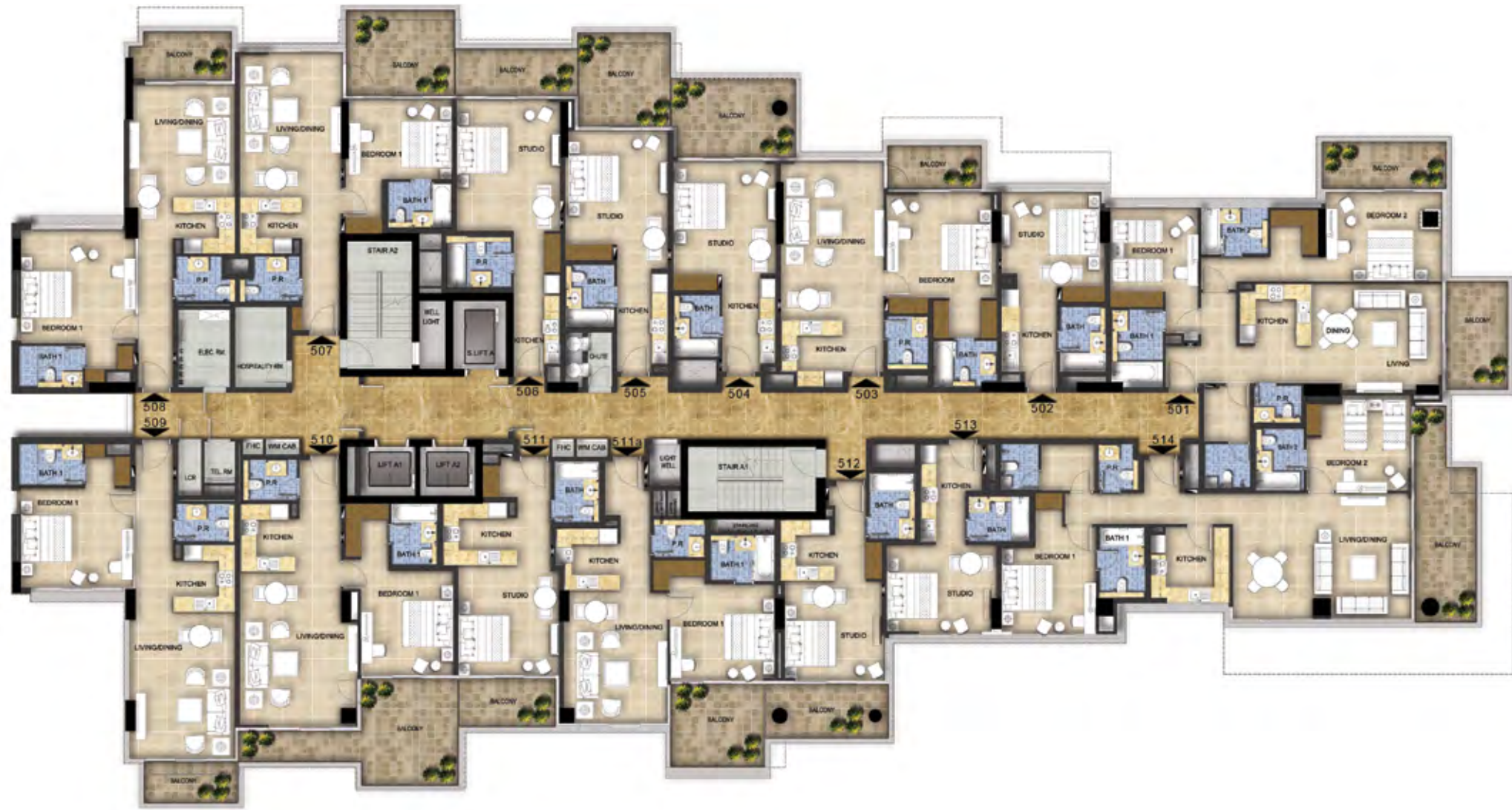
GOLF PROMENADE 2 TOWER A - LEVEL 05