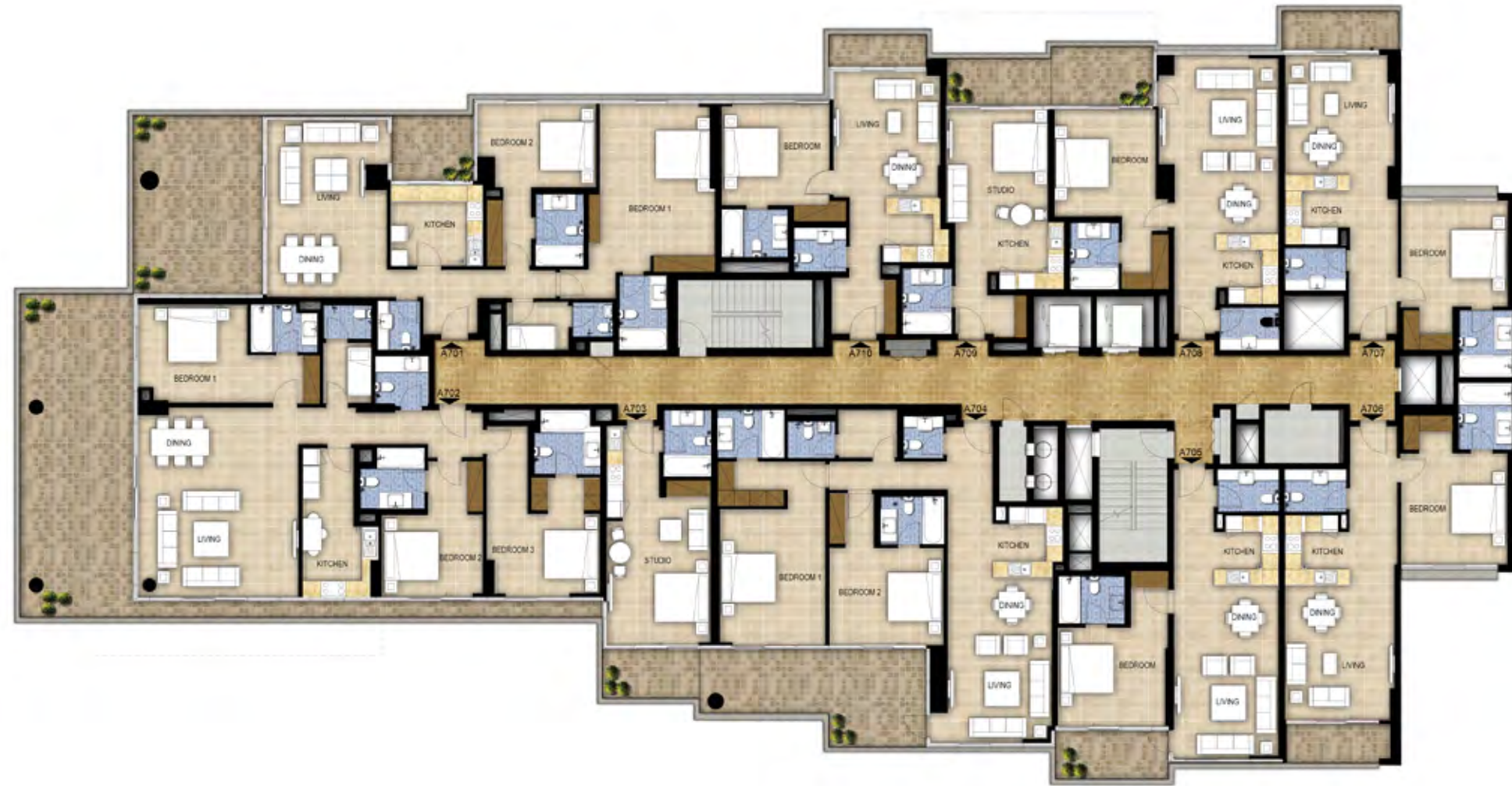
GOLF PROMENADE 3, 4 & 5 TOWER A - LEVEL 07