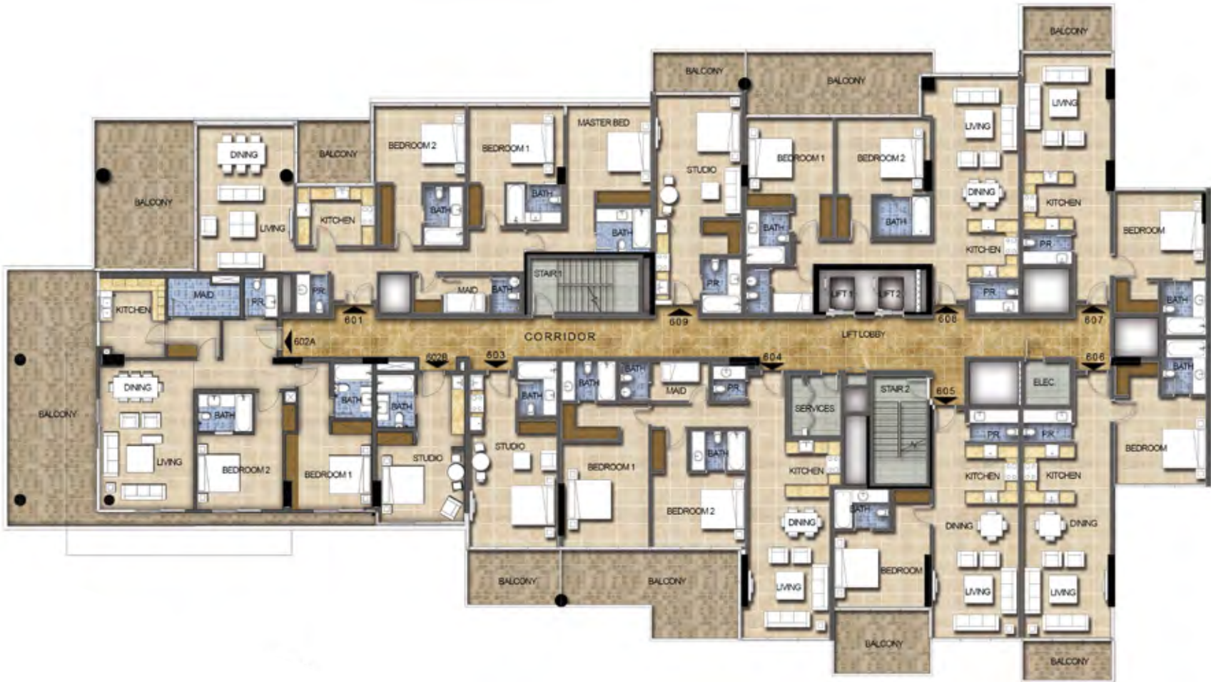
GOLF PANORAMA | GOLF VISTA | GOLF HORIZON TOWER A - LEVEL 06