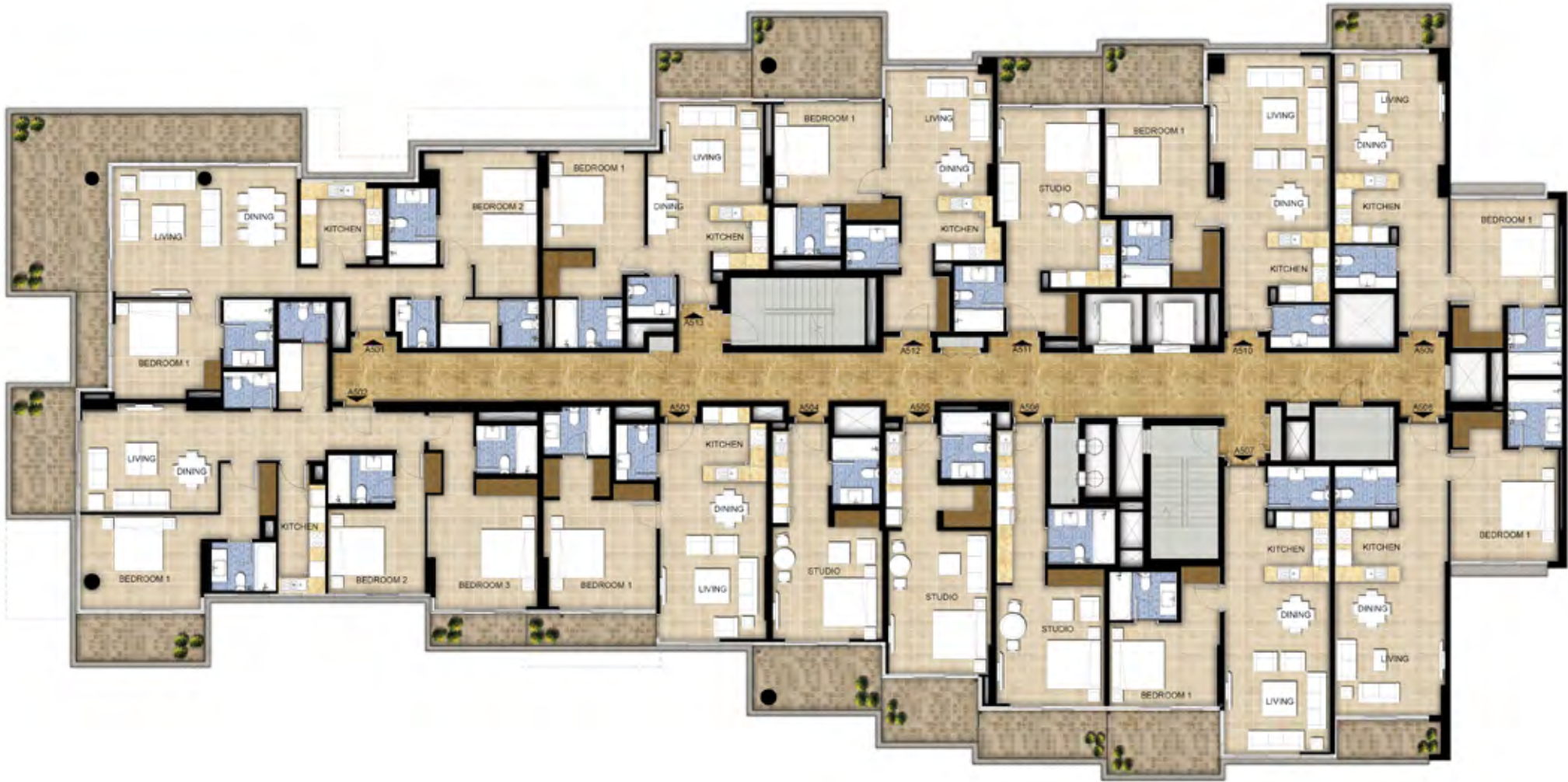
GOLF PROMENADE 3, 4 & 5 TOWER A - LEVEL 05