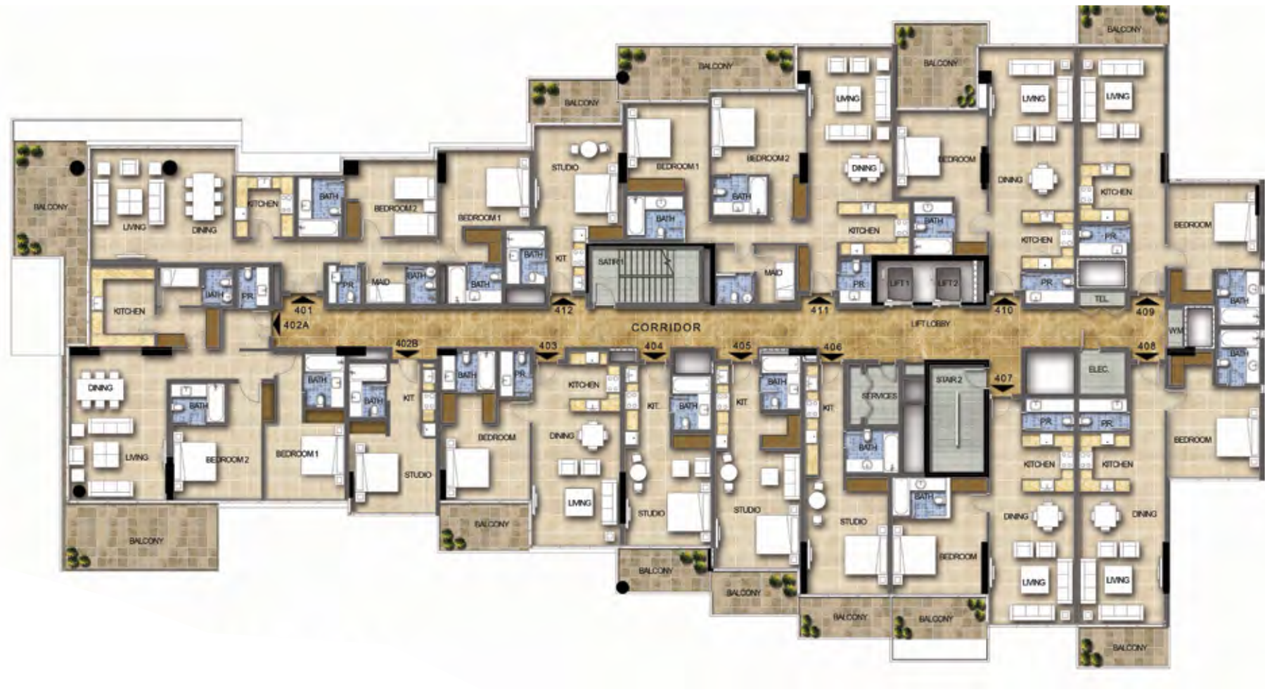
GOLF PANORAMA | GOLF VISTA | GOLF HORIZON TOWER A - LEVEL 04