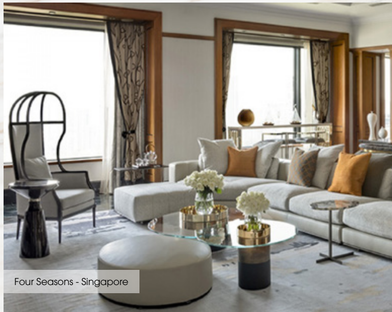
Four Seasons - Singapore