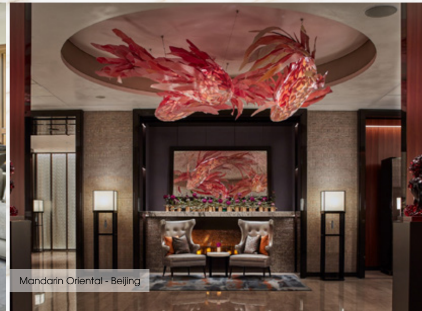
Mandarin Oriental - Beijing