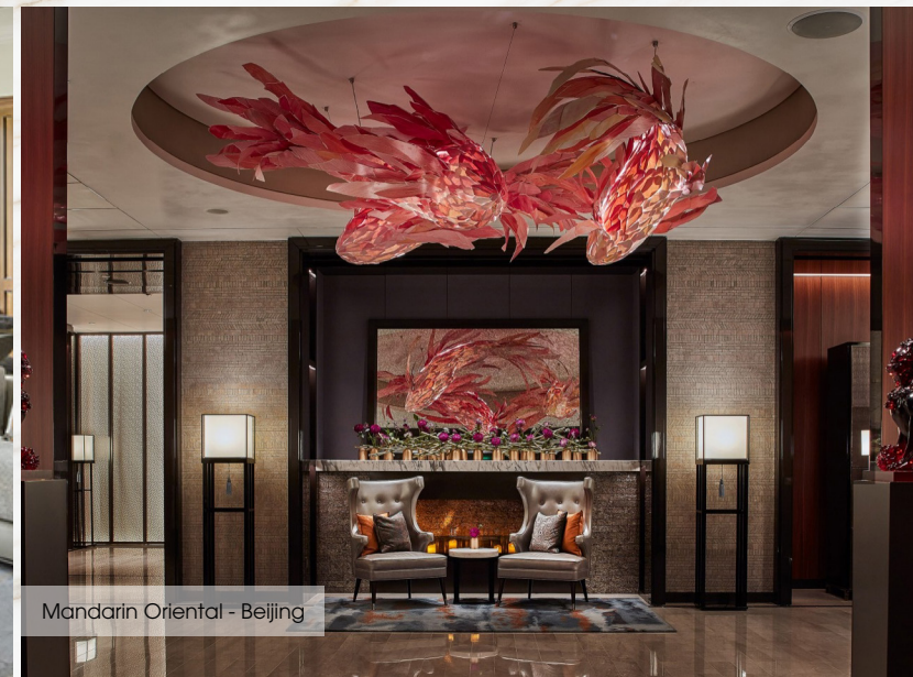
Mandarin Oriental - Beijing