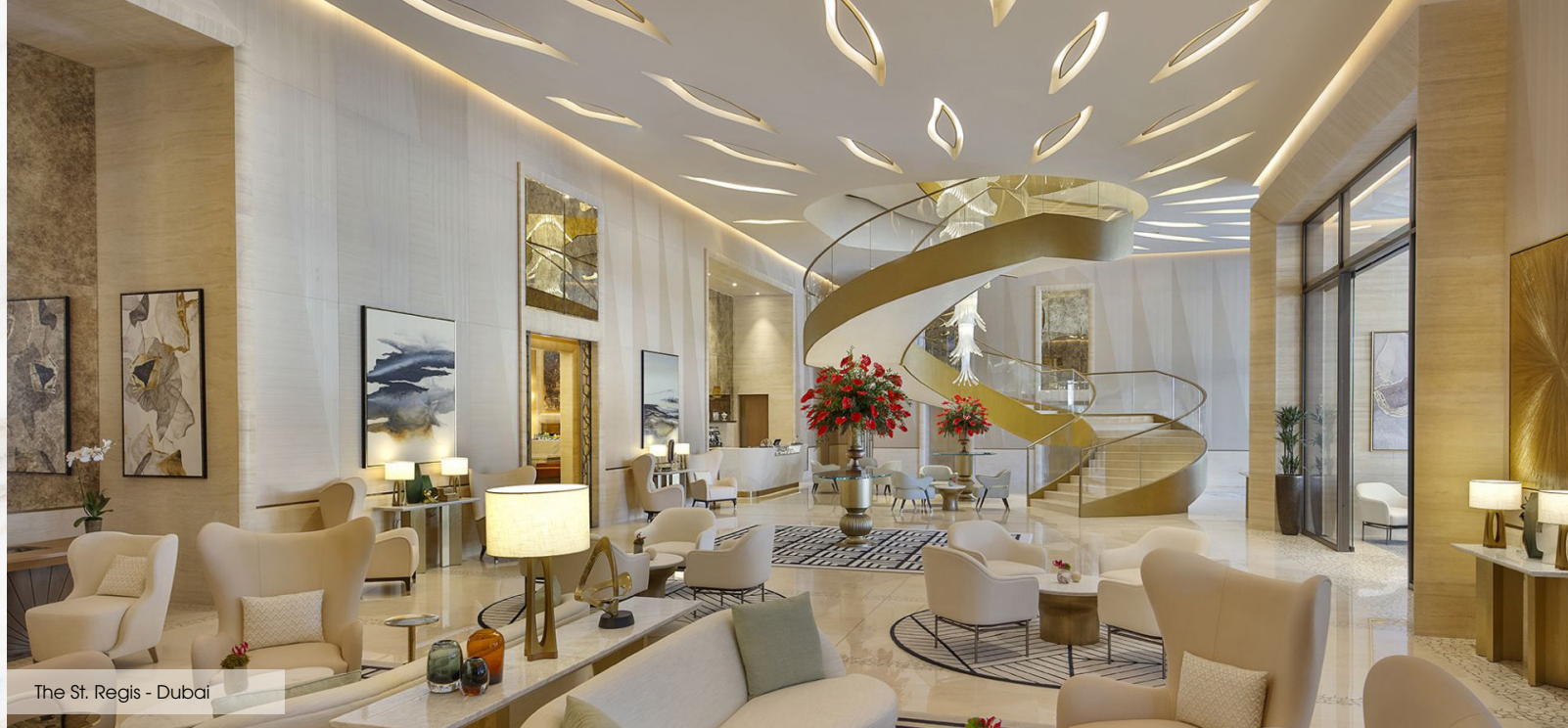
The St. Regis - Dubai