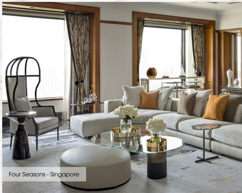
Four Seasons - Singapore