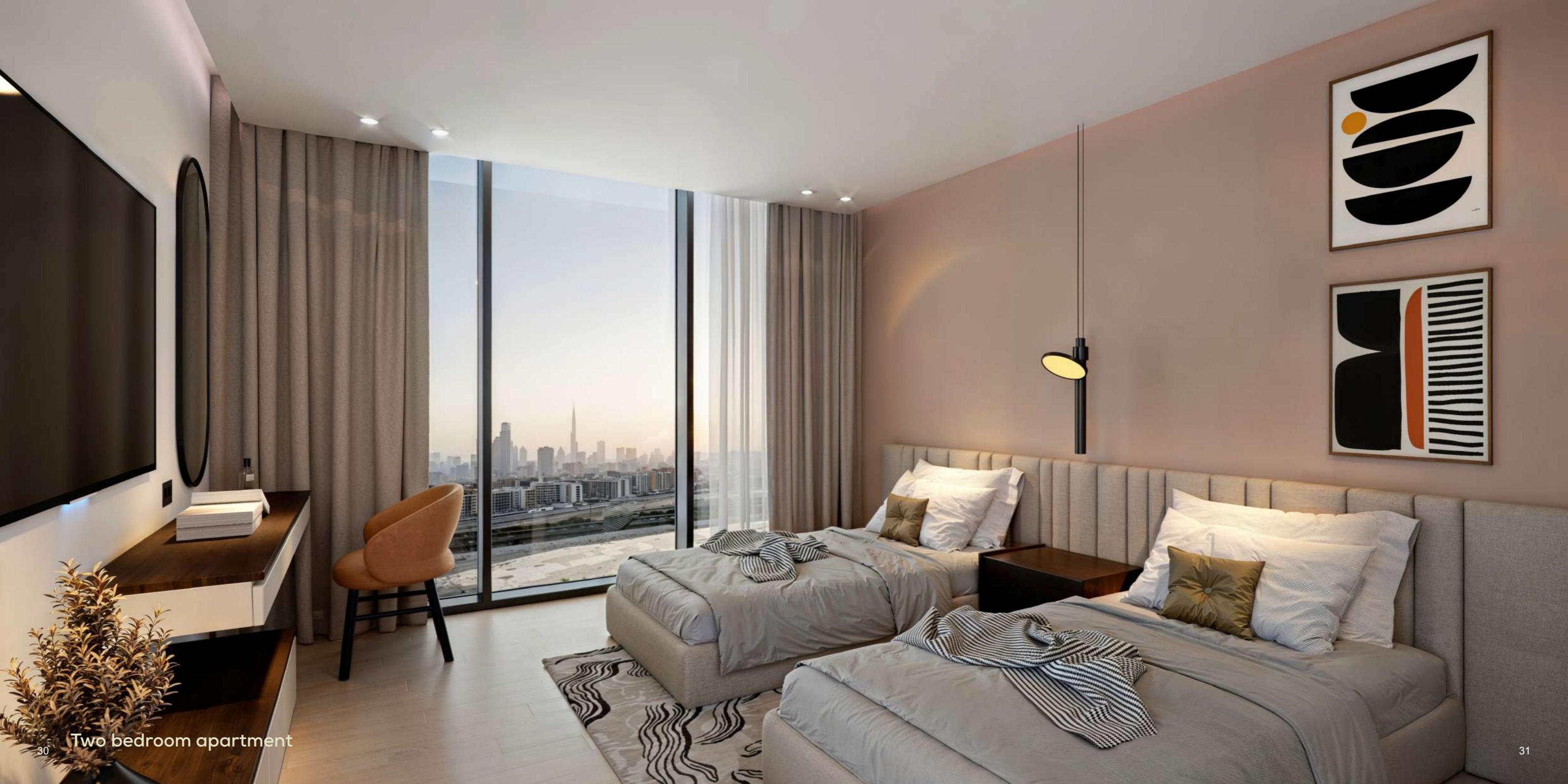
Two bedroom apartment