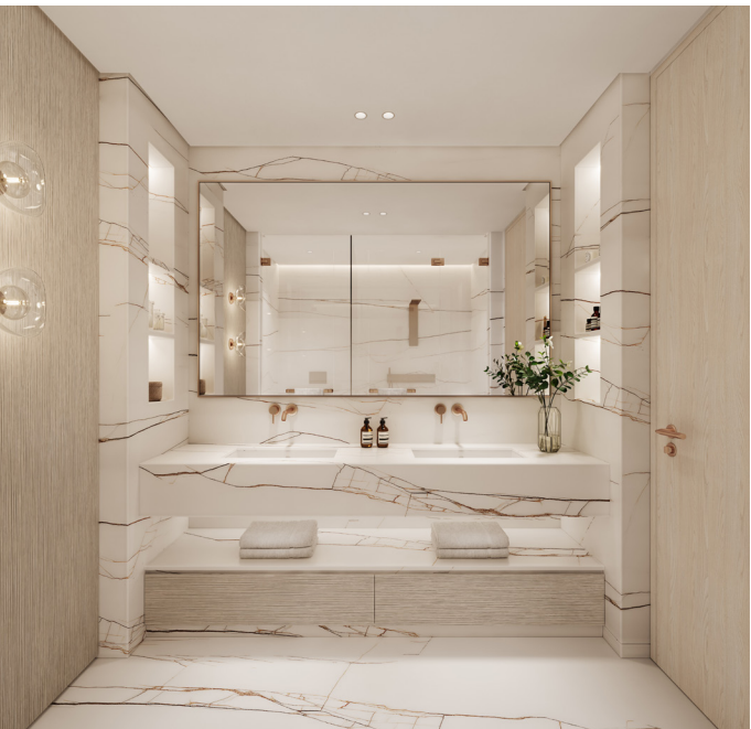
The artist representations and interior decorations, finishes, appliances and furnishings are provided for illustrative purposes only. The developer reserves the right to substitute materials, appliances, equipment, fixtures and other construction and design details specified. The use of any designations, labels or nomenclature is for marketing purposes only.