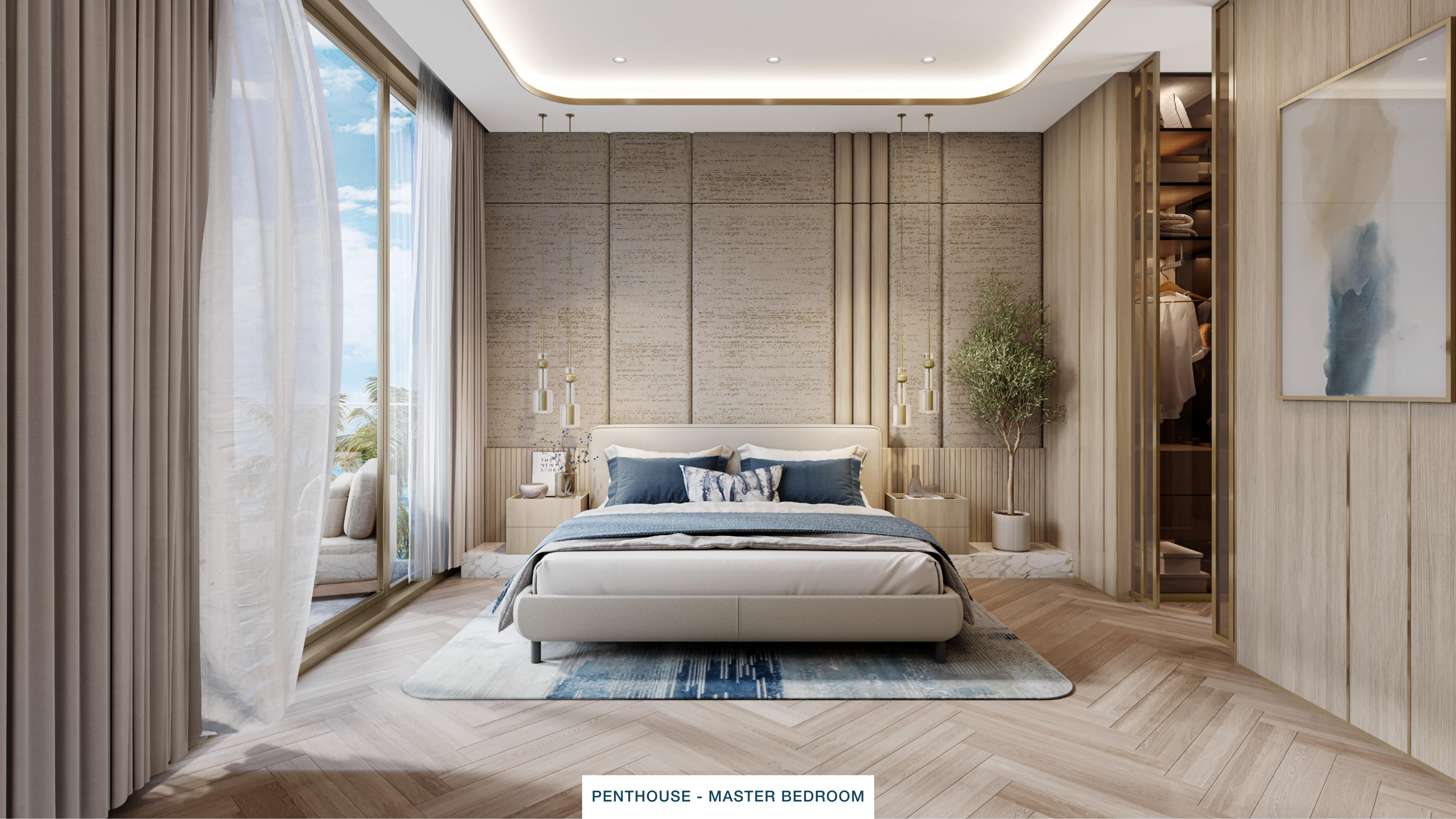
PENTHOUSE - MASTER BEDROOM