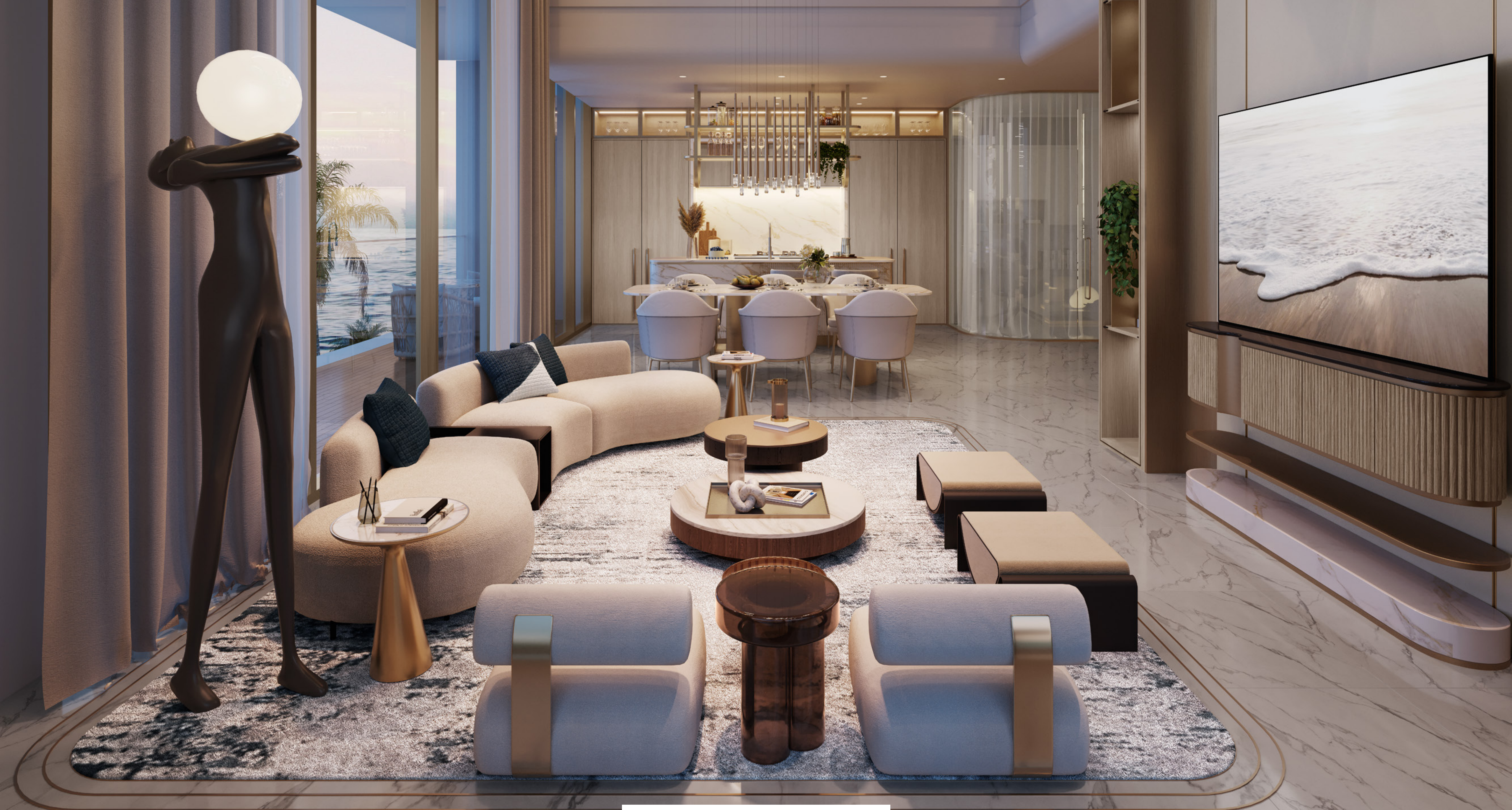
PENTHOUSE - LIVING ROOM