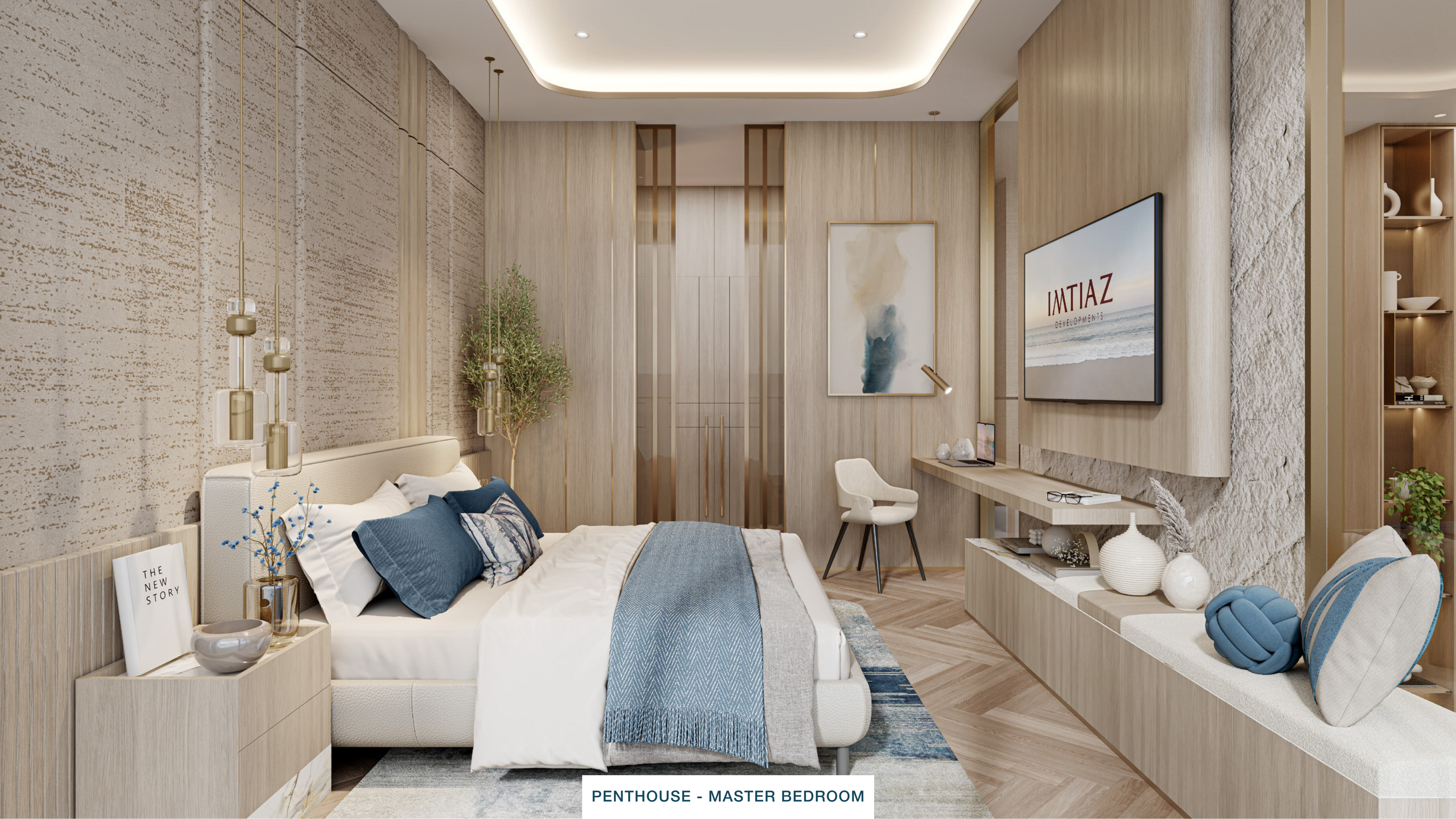
PENTHOUSE - MASTER BEDROOM