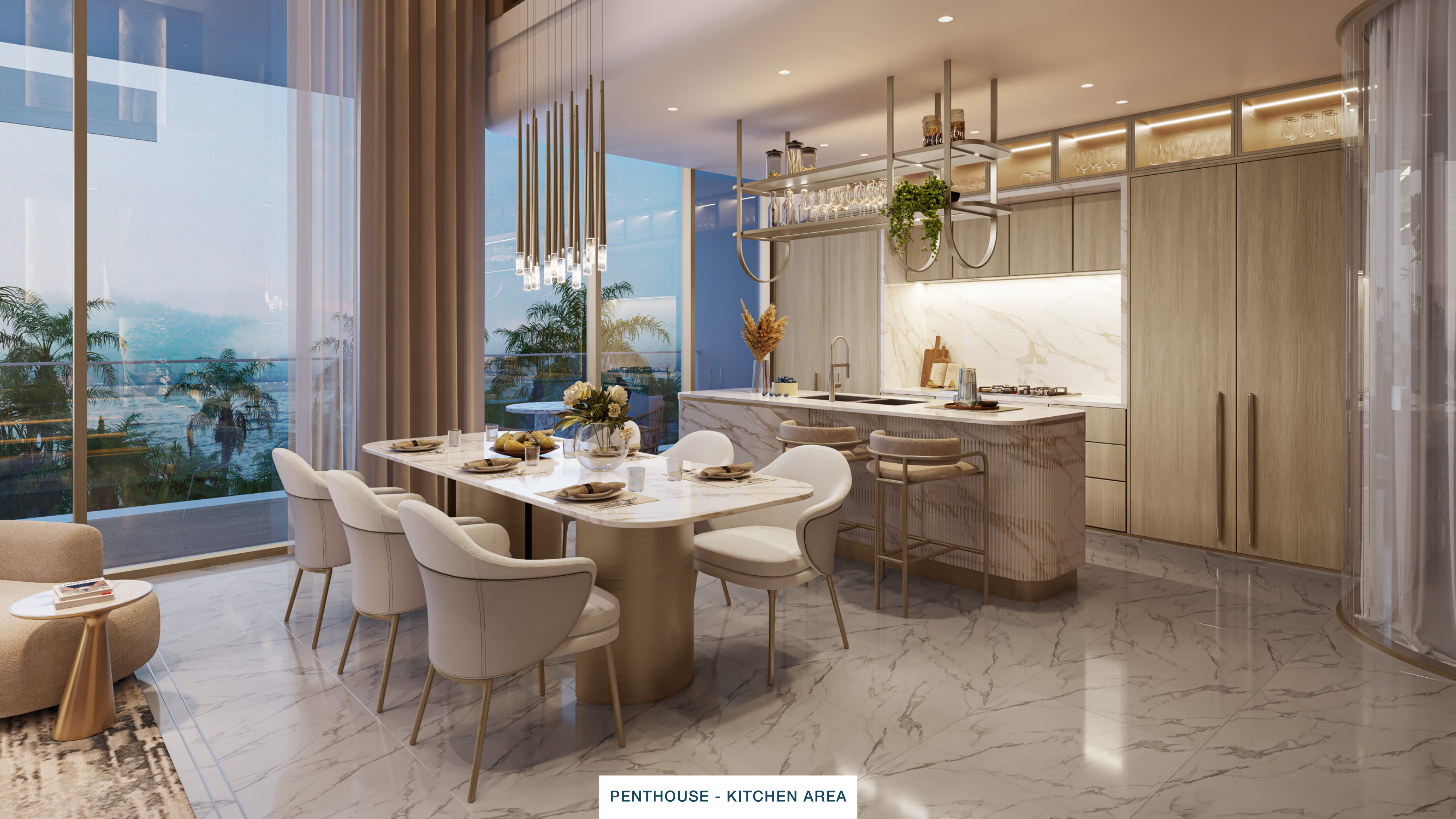
PENTHOUSE - KITCHEN AREA