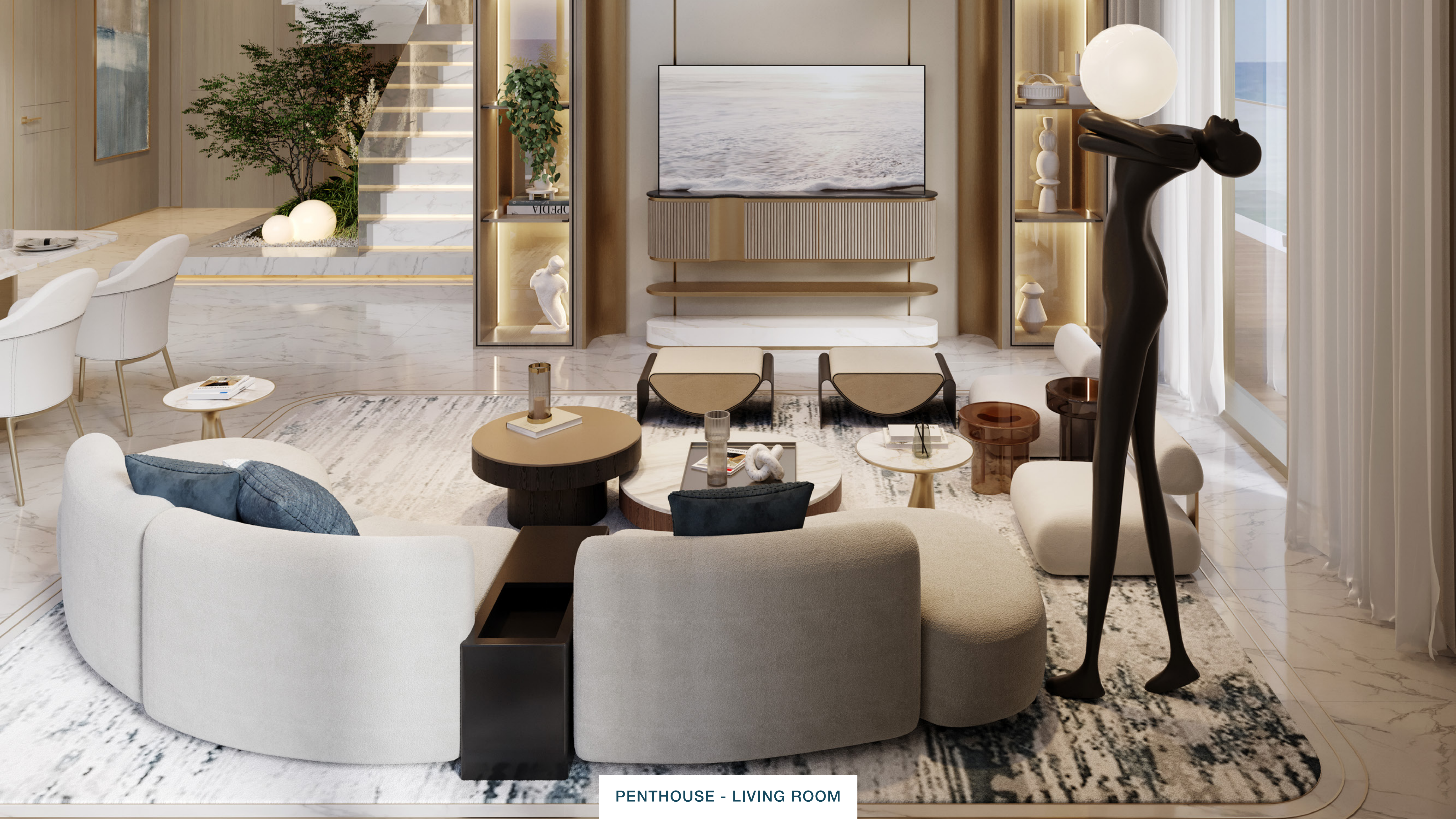
PENTHOUSE - LIVING ROOM