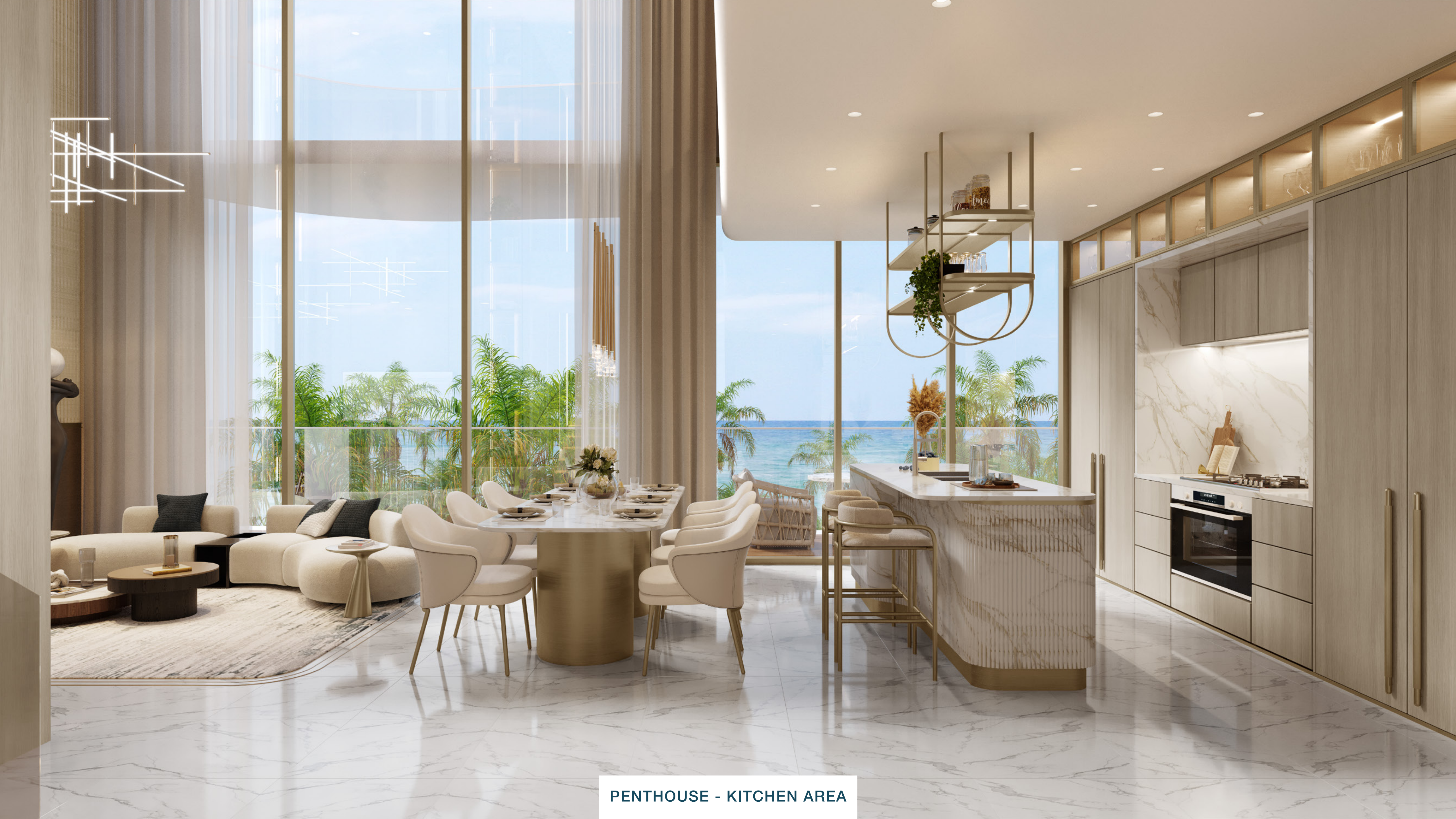
PENTHOUSE - KITCHEN AREA