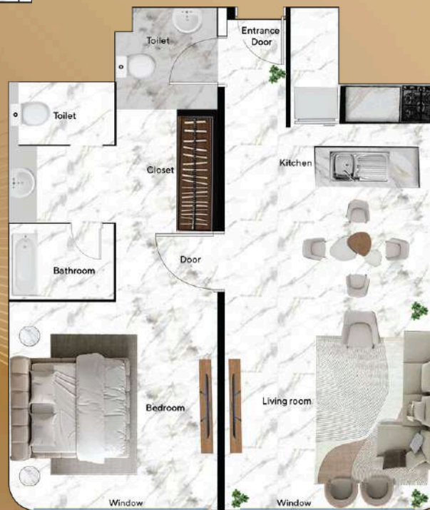
1-Bedroom Type B (712.46 sq.ft.)