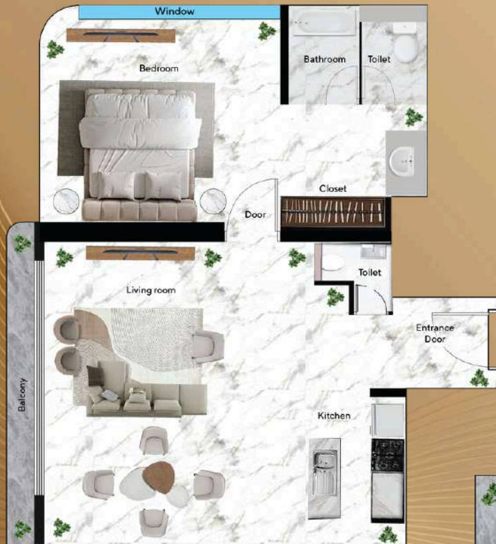
1-Bedroom Type D (757.13 sq.ft.)