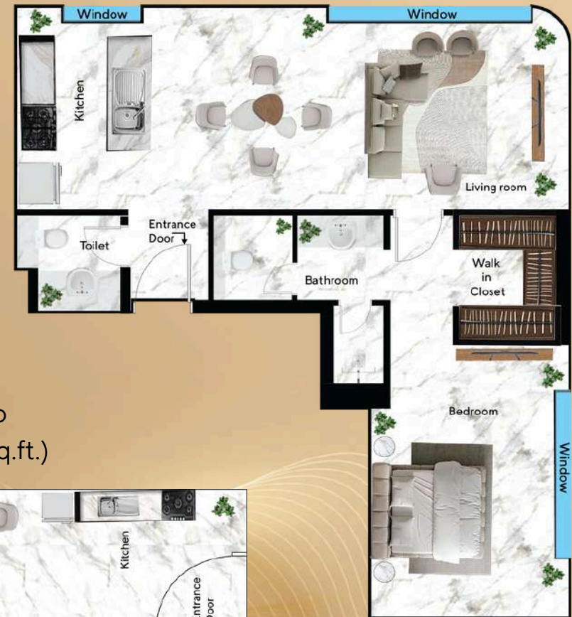
1-Bedroom Type E (775.86 sq.ft.)