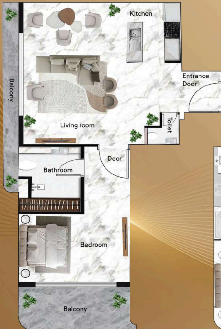
1-Bedroom Type C (849.27 sq.ft.)