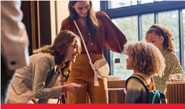
À LA CARTE SERVICE