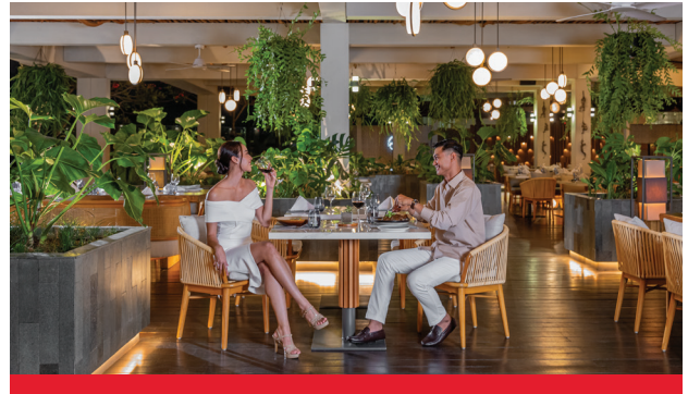
ALL-DAY DINING SERVICE