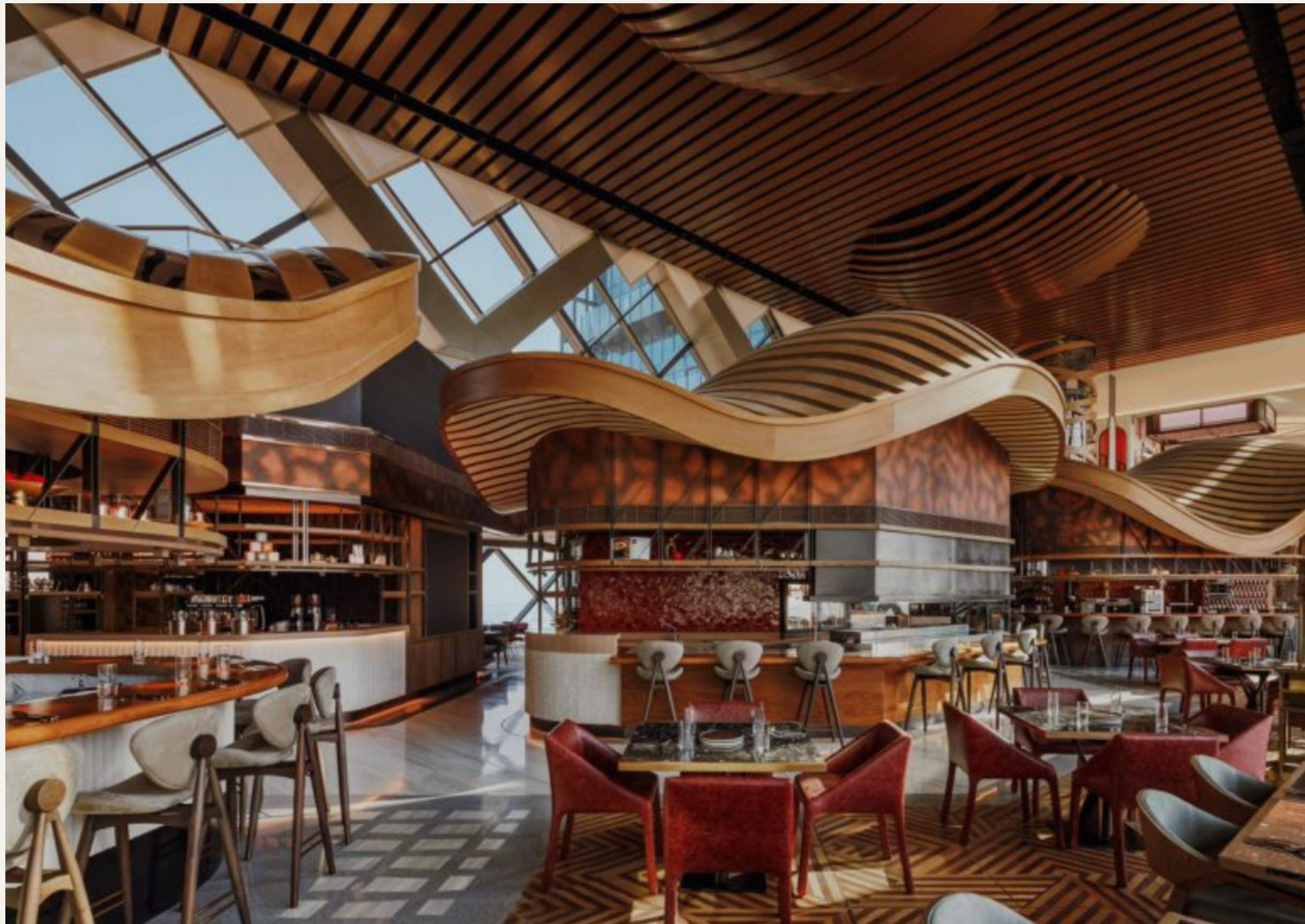
Arrazuna at The Link, One Za'abeel, Dubai