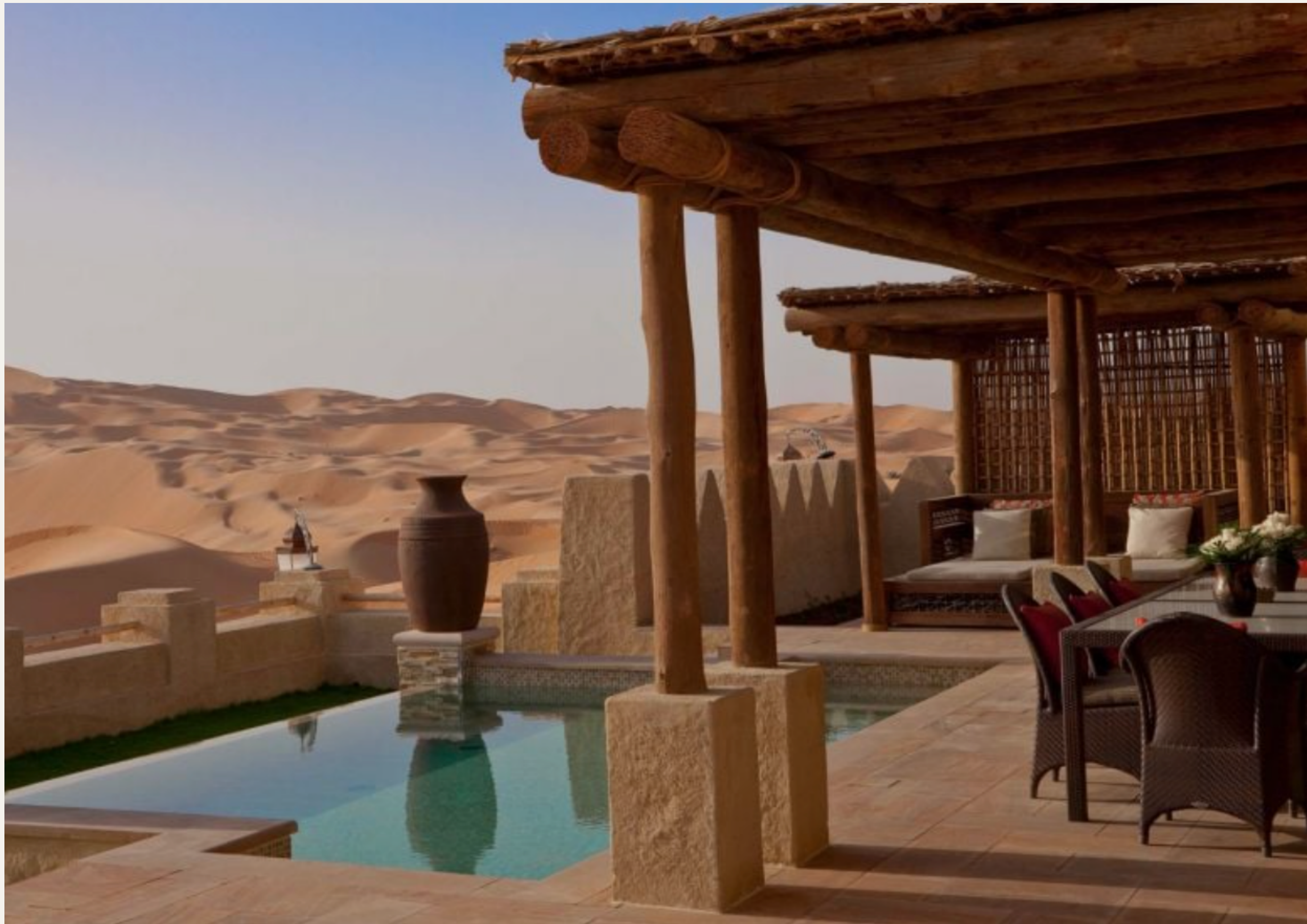
Qasr Al Sarab by Anantara, Abu Dhabi