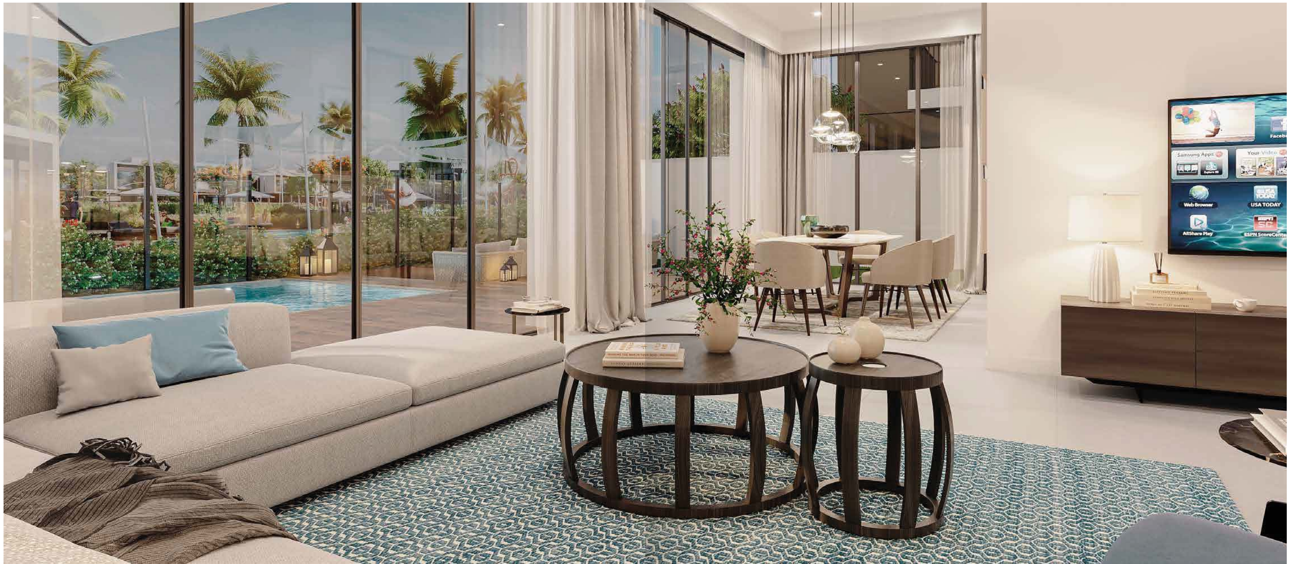
FORMAL LIVING AREA & DINING