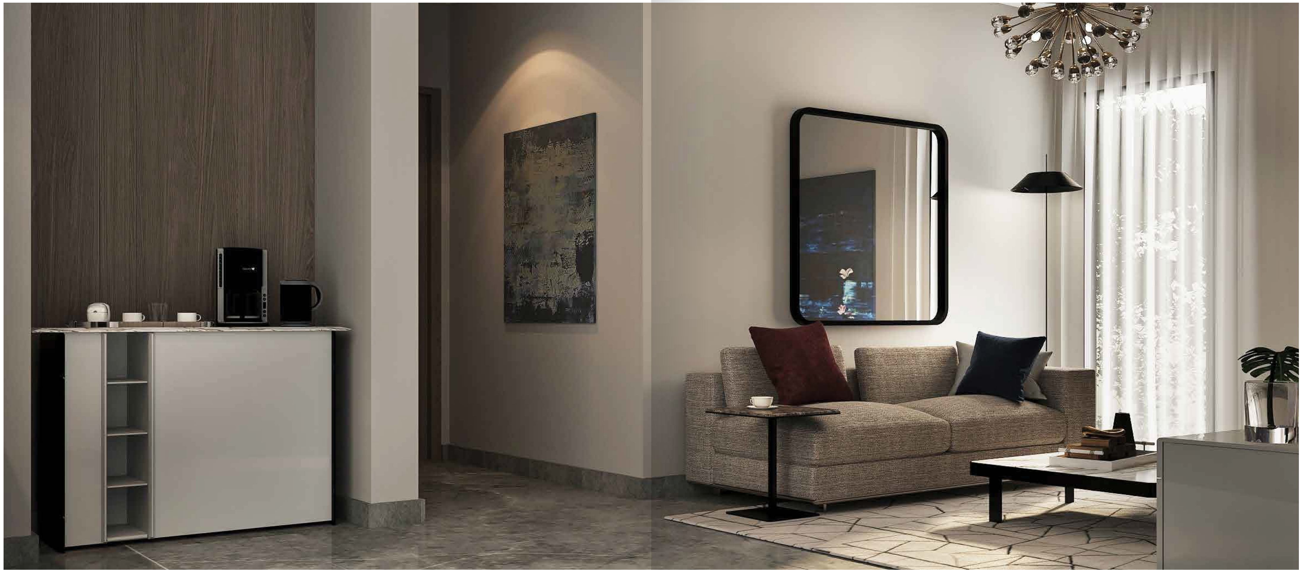
FIRST FLOOR FAMILY LOUNGE