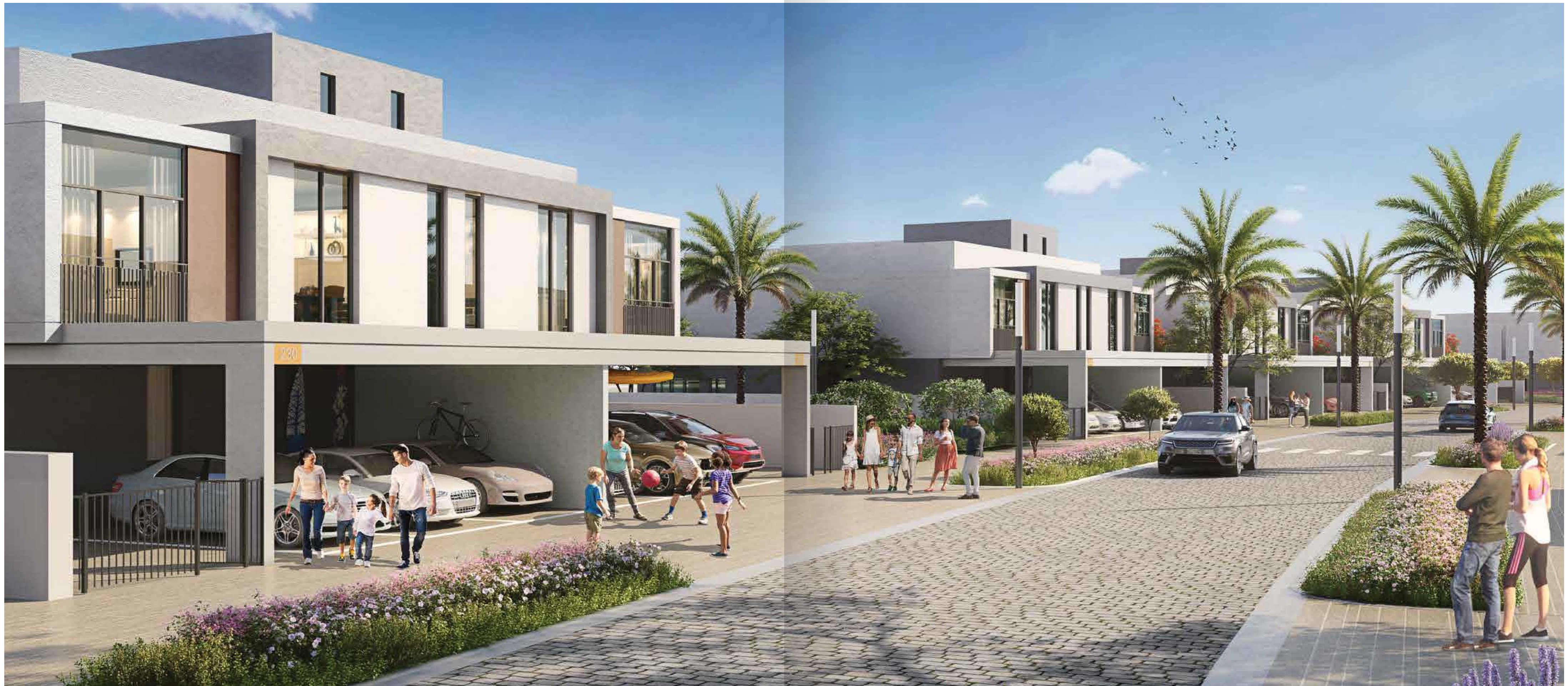
4 BR & 5 BR VILLAS