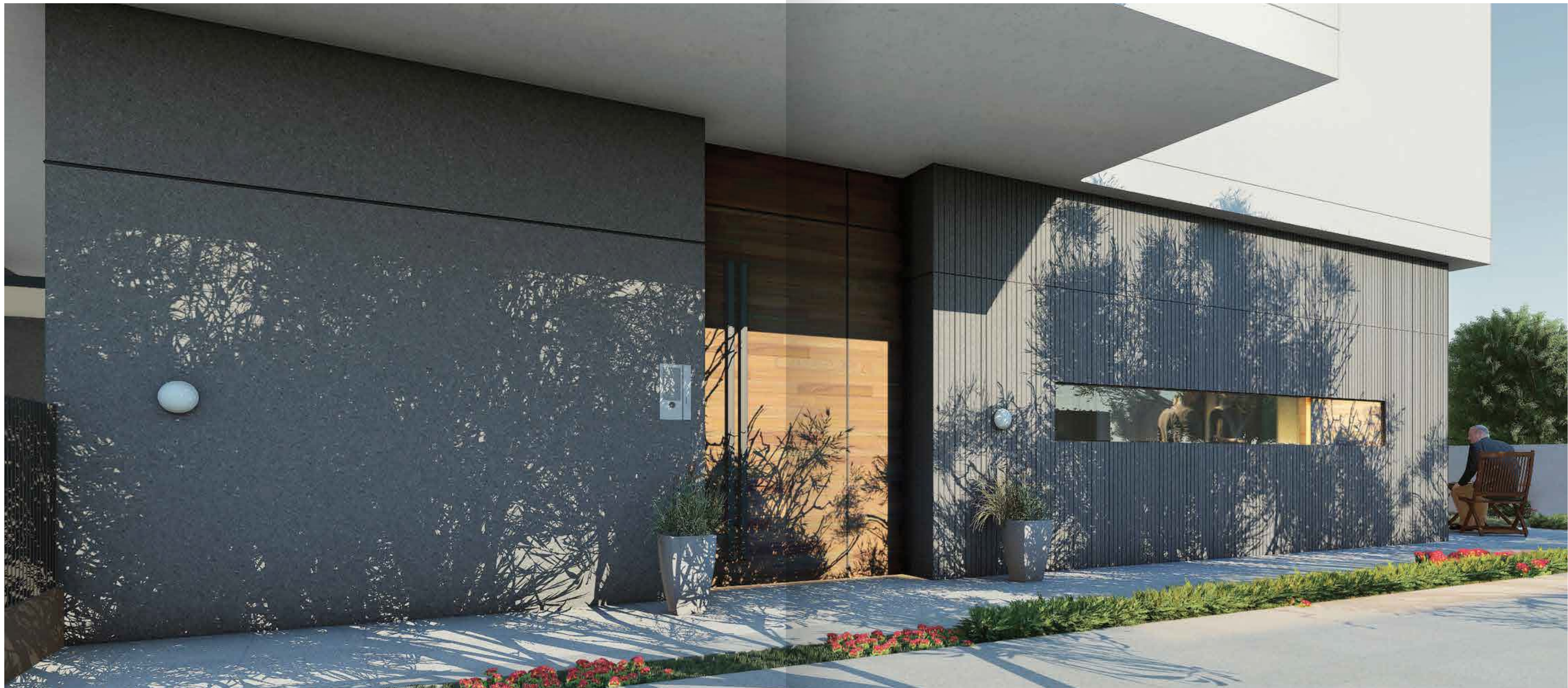
GATED ENTRANCE & PRIVATE GARDENS