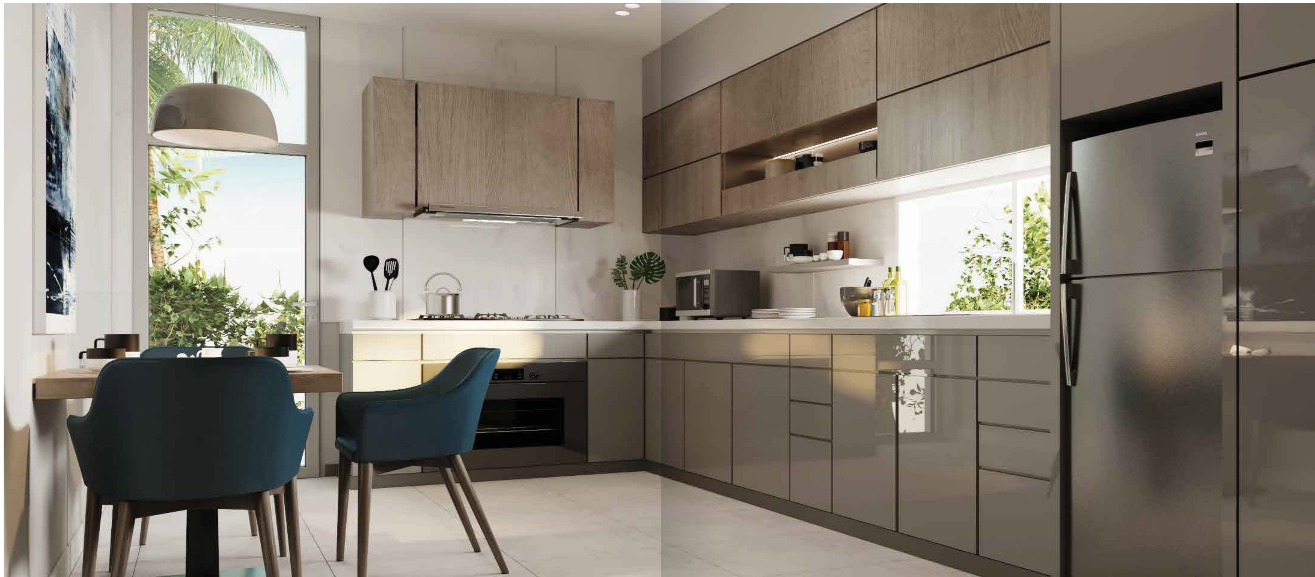
FULLY-EQUIPPED CLOSED KITCHENS WITH GARDEN ACCESS