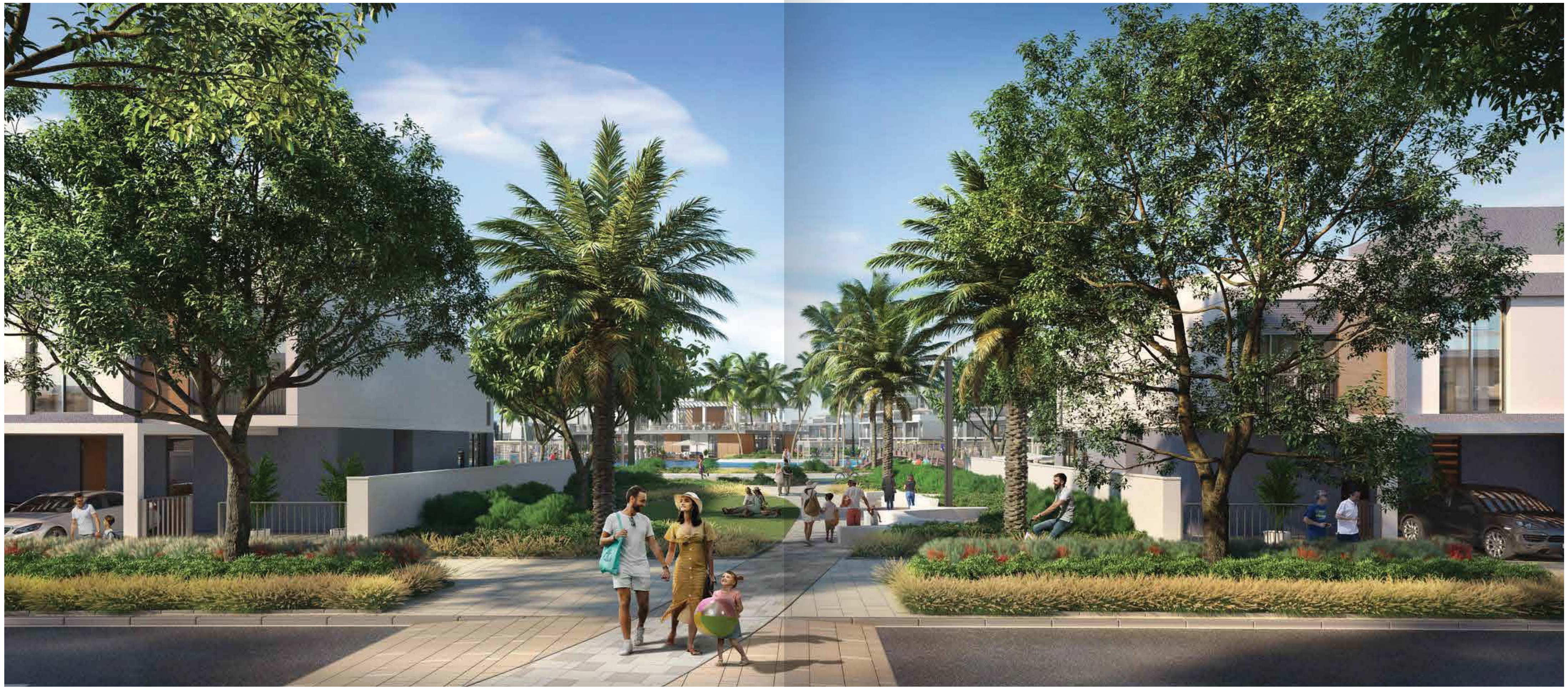
PATHWAYS TO THE CENTRAL PARK