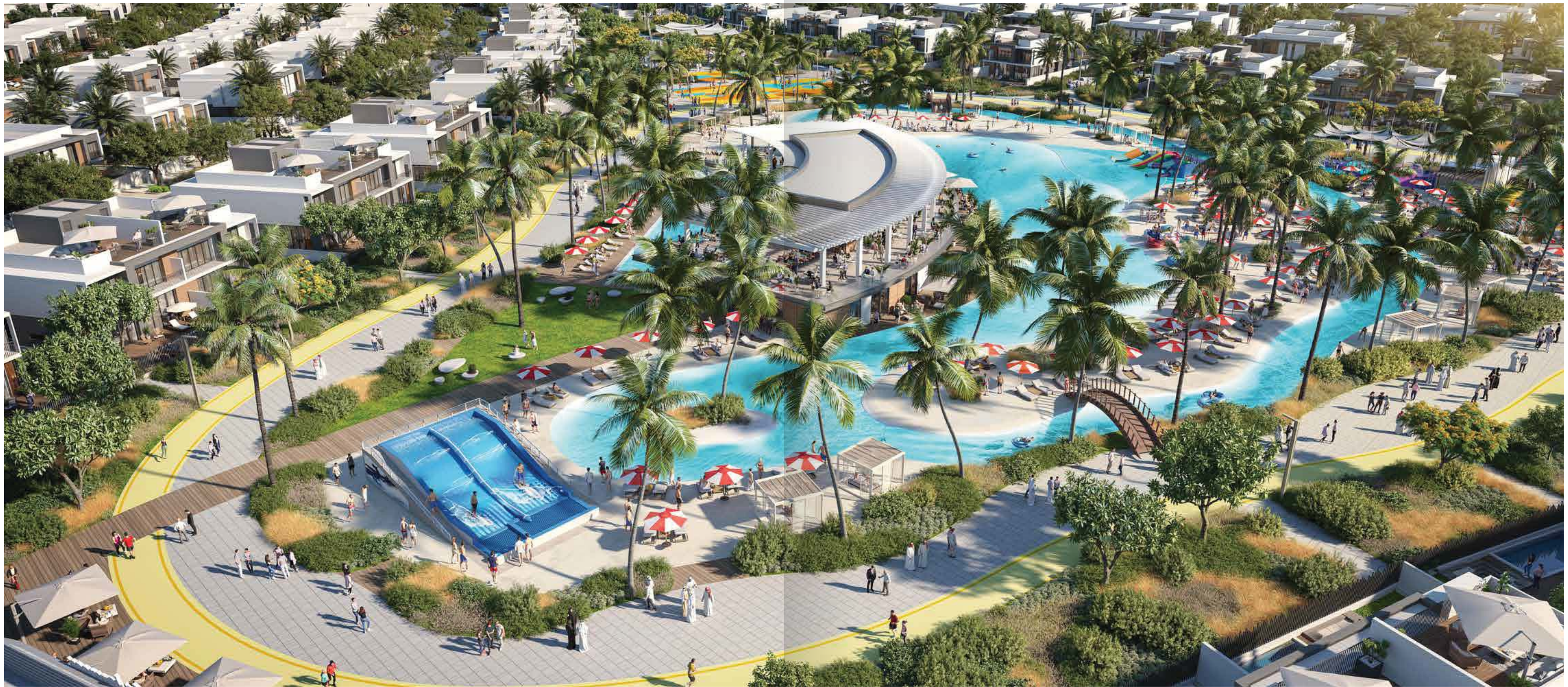
THE PULSE BEACHFRONT - CENTRAL PARK