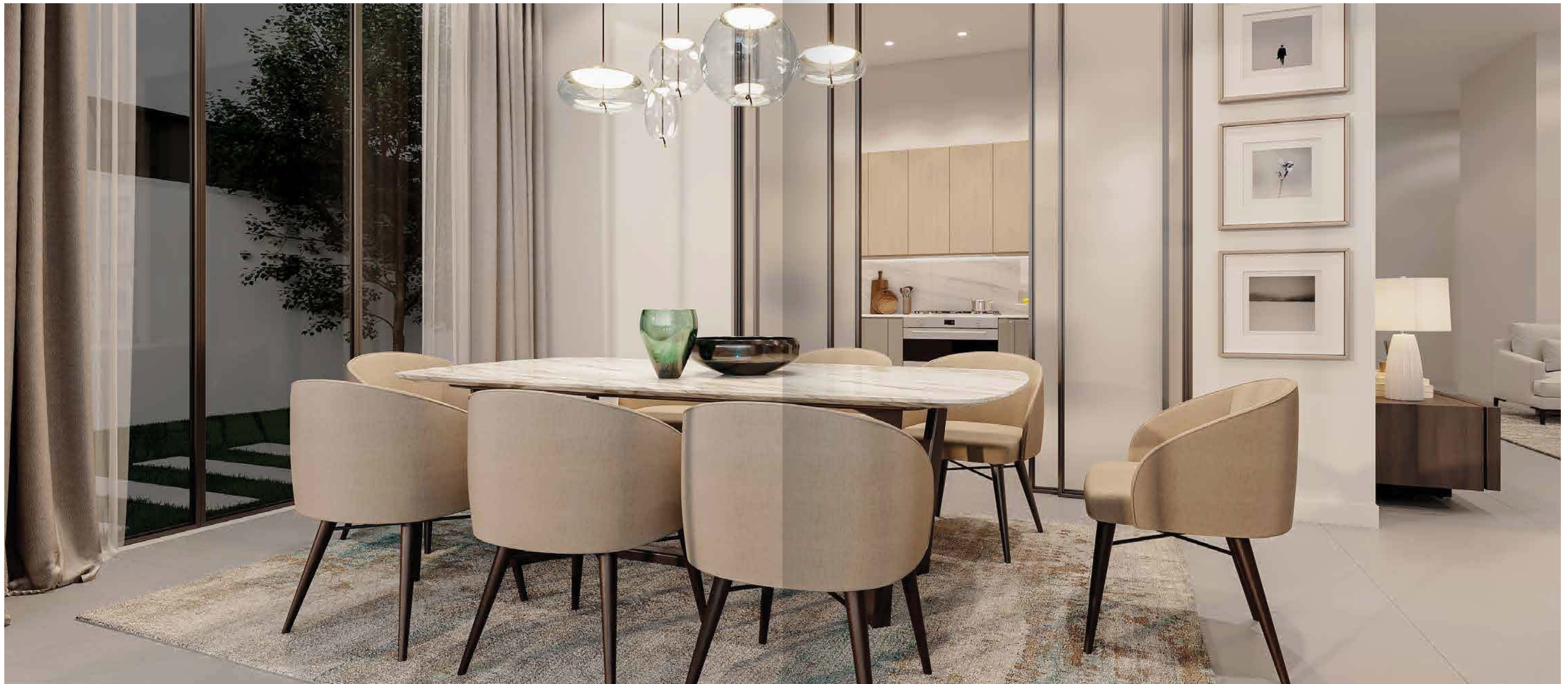
HYBRID KITCHEN & FORMAL DINING