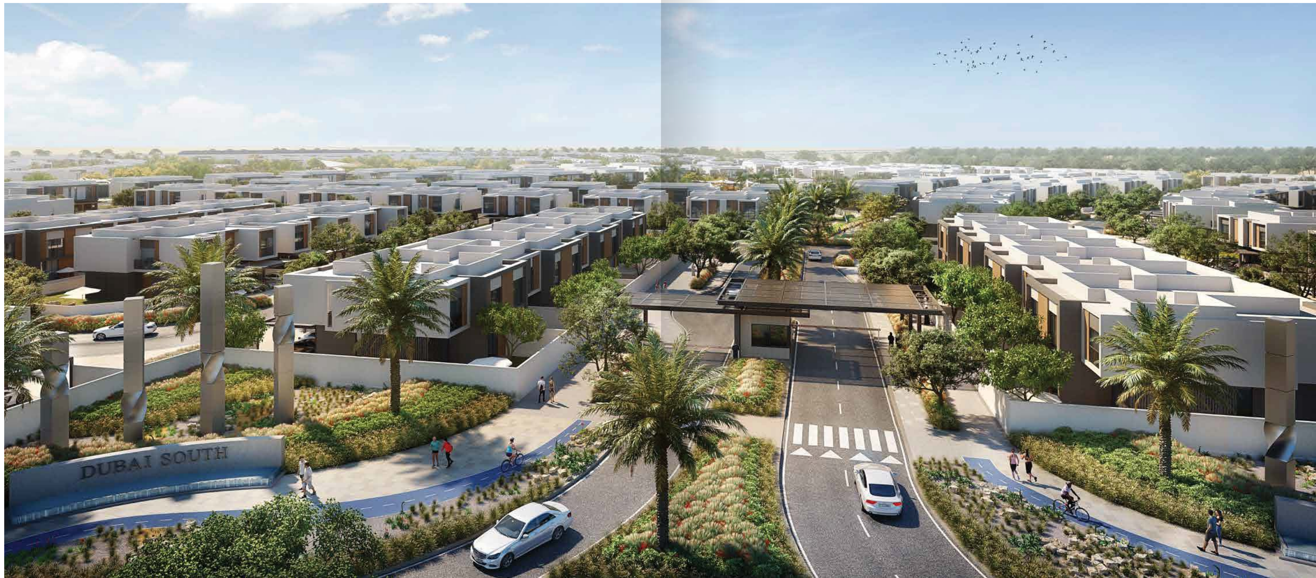
PHASE 1 COMMUNITY ENTRANCE