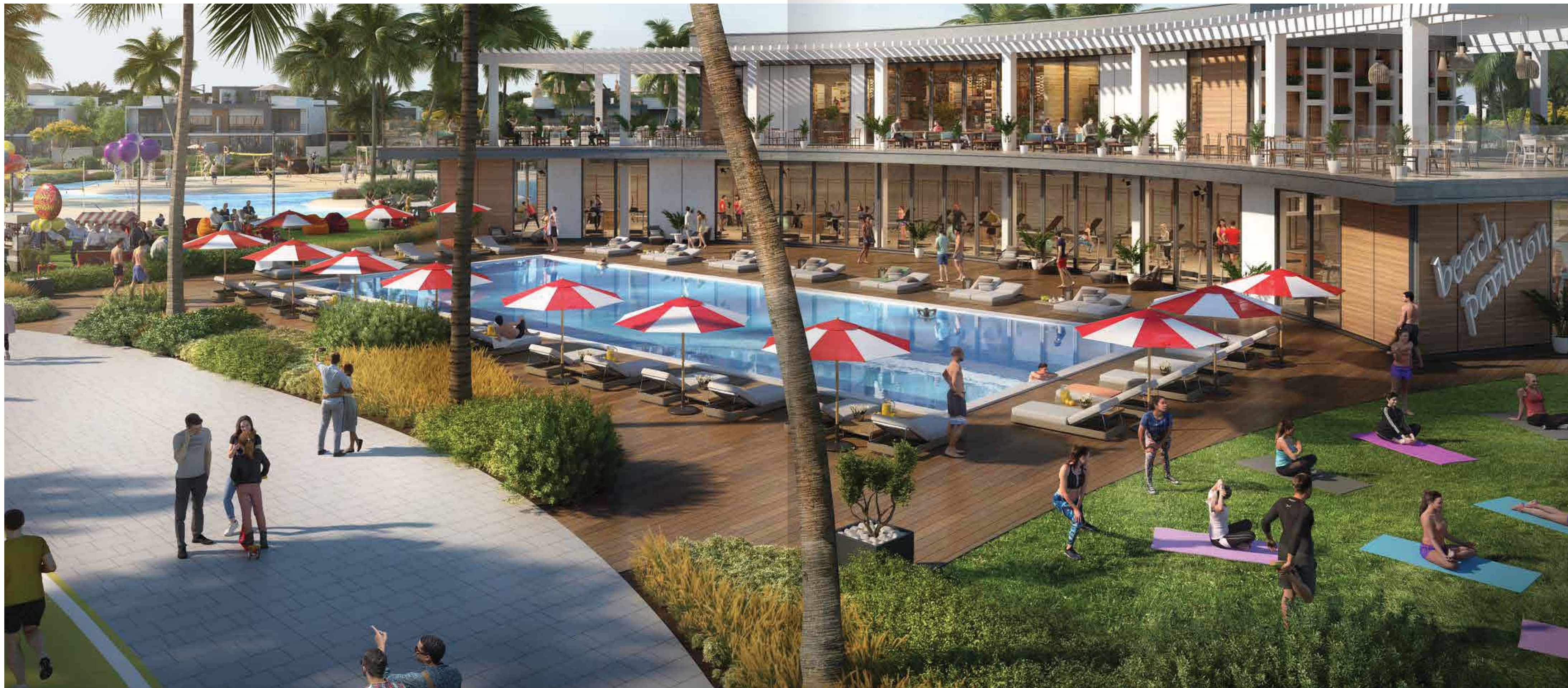
FITNESS CLUB, YOGA STUDIO & LAP POOL