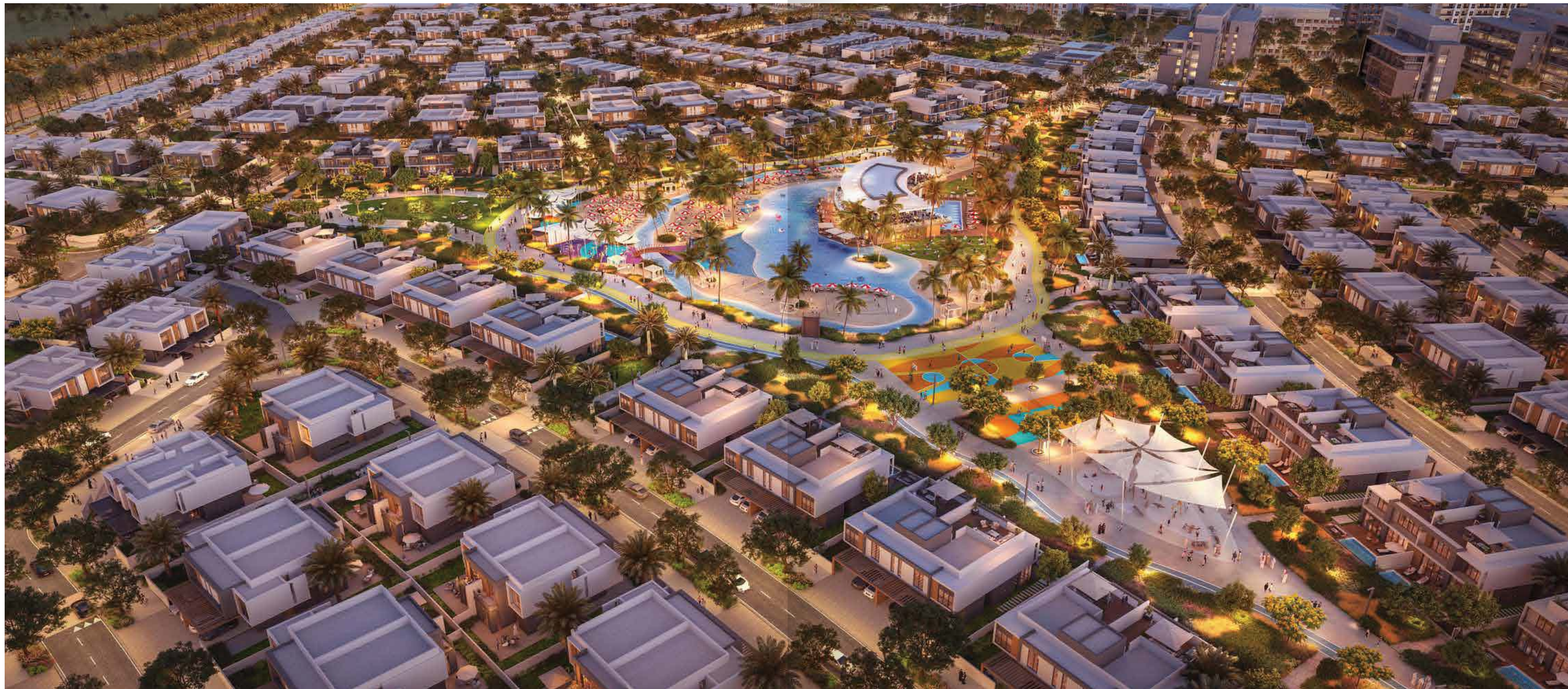
PREMIUM VILLAS WITH BEACH VIEWS