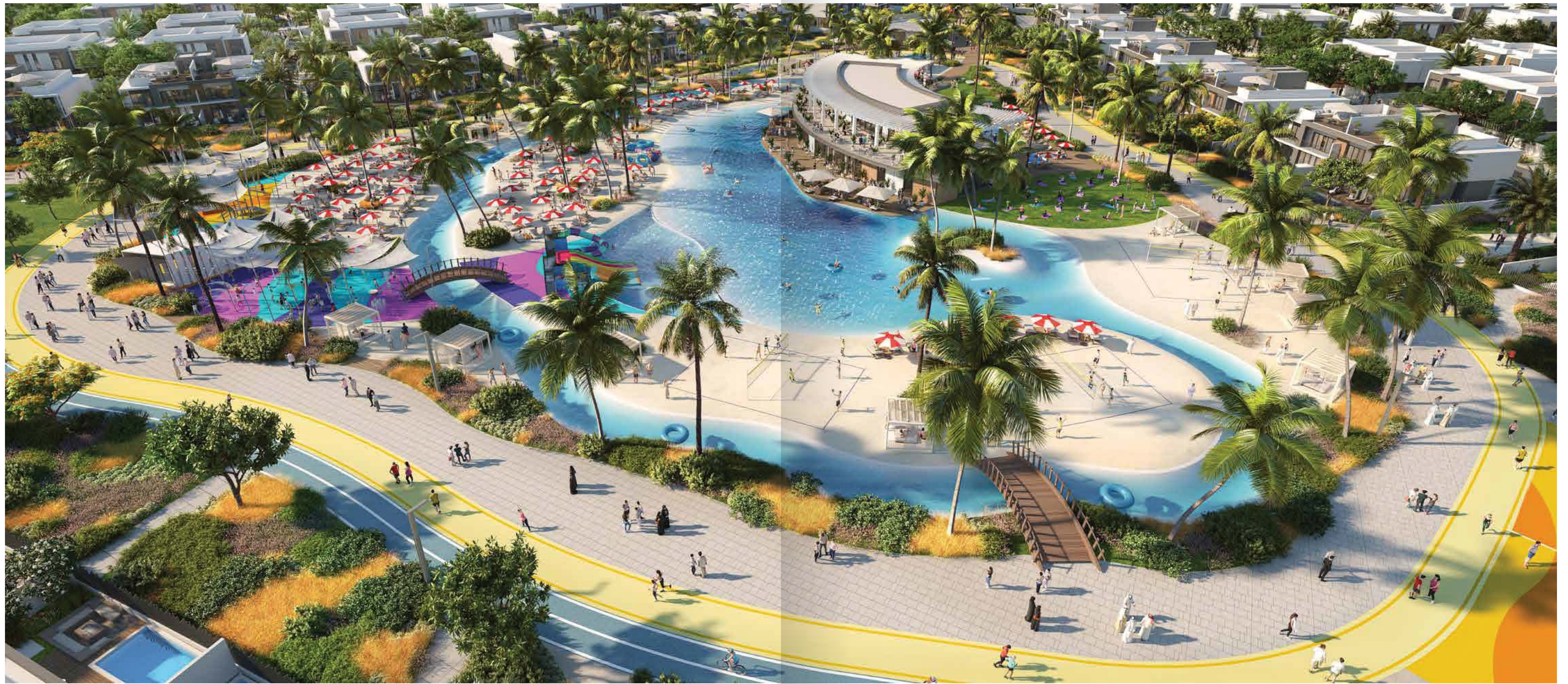
THE PULSE BEACHFRONT - CENTRAL PARK