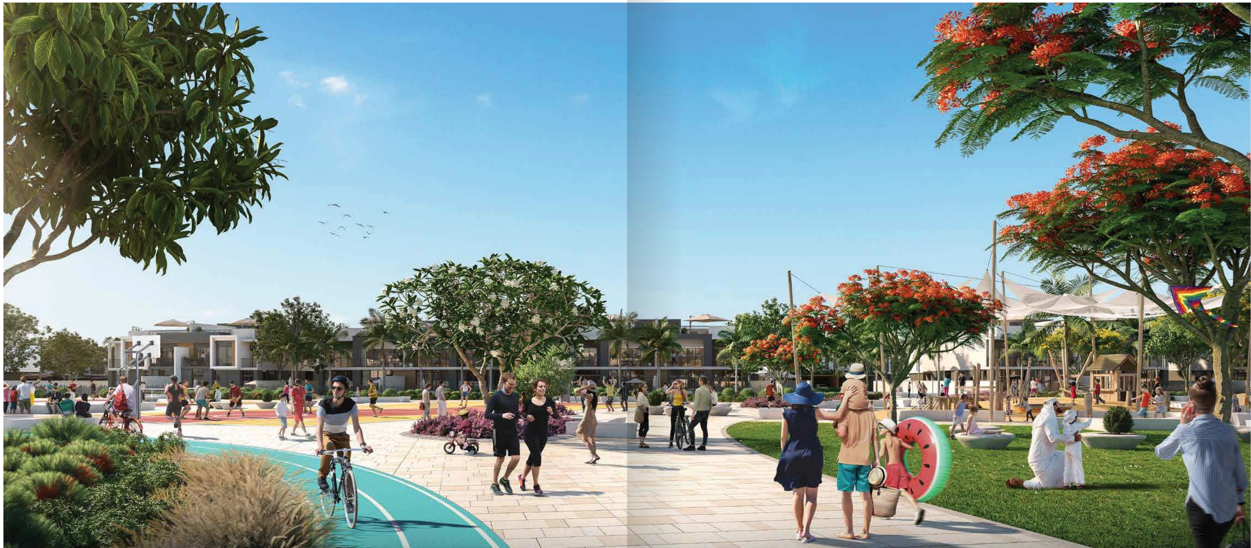
LUSH GREENERY AND OPEN PARKS