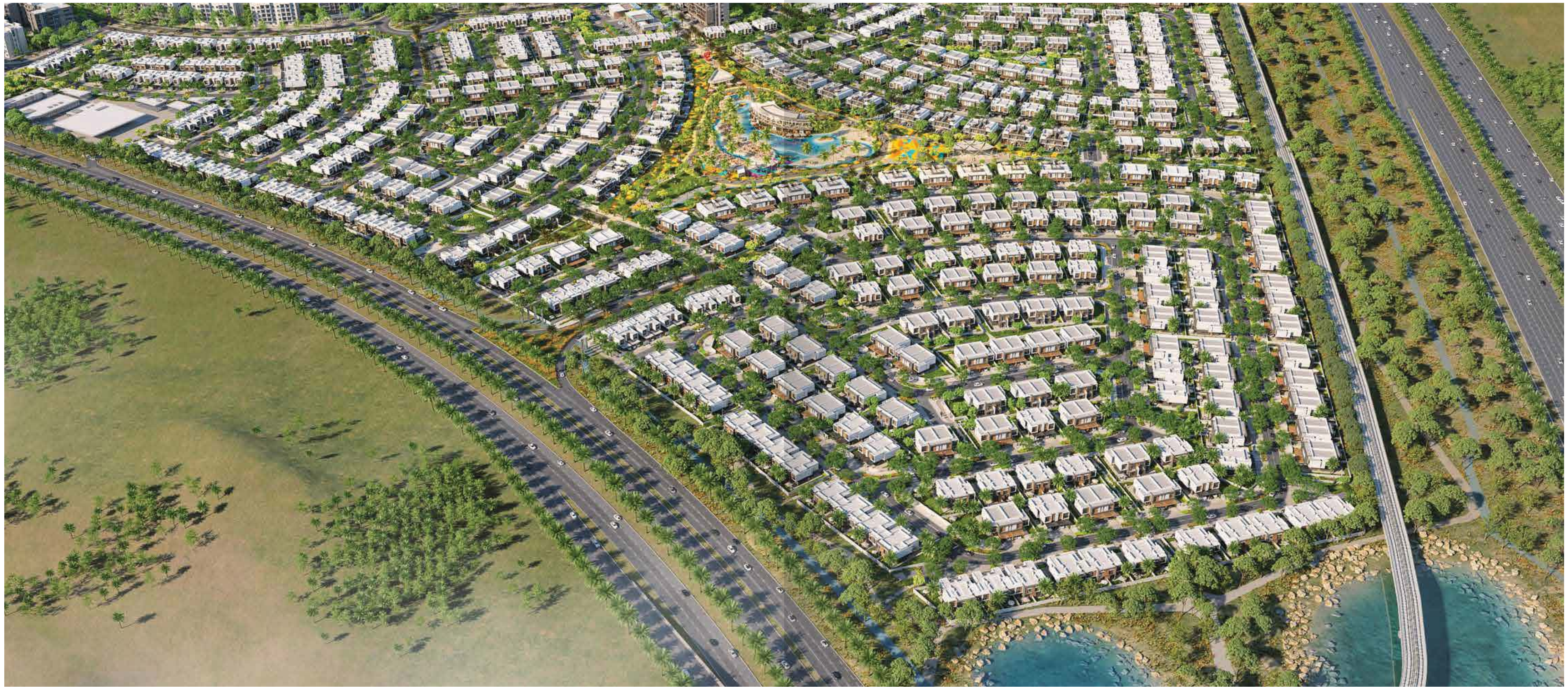
THE PULSE BEACHFRONT COMMUNITY