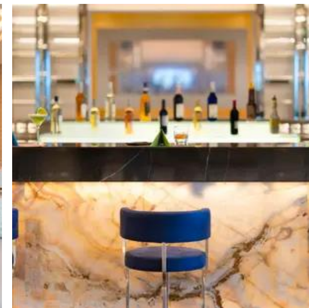
Anti-Dote – Bar Daily 11:00 AM to 02:00 AM