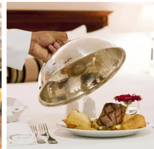
In-Room Dining Service 24 hours Menu: https://qr.mydigimenu.com/d23d5144-aa48-4ea2-a295-0a0953e3ed38