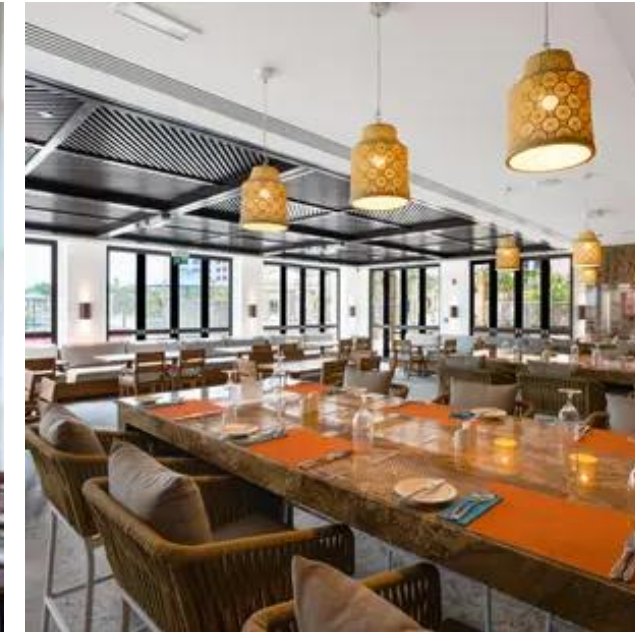
People's Restaurant – Casual Dining Lunch – 12:00 AM to 05:30 PM Dinner – 07:30 PM to 11:00 PM