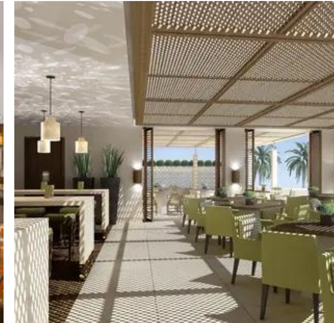
The Bakery Club – Patisserie Daily 03:00 PM to 06:00 PM