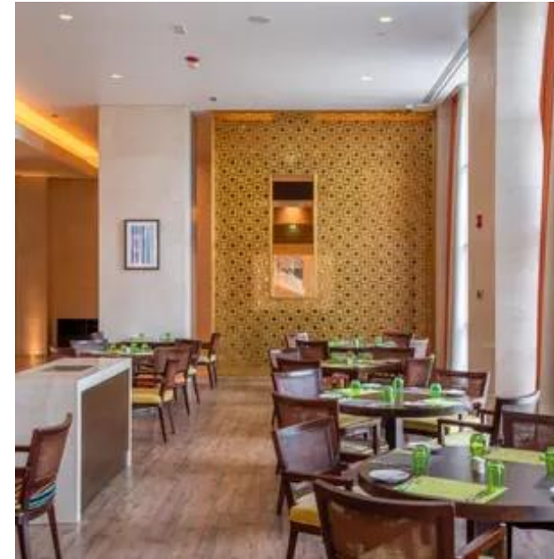
Turquoise Restaurant and The Flame Restaurant – All-Day Dining Breakfast Buffet – 06:30 AM to 10:30 AM Lunch Buffet – 12:30 PM to 03:00 PM Dinner Buffet– 06:30 PM to 10:00 PM