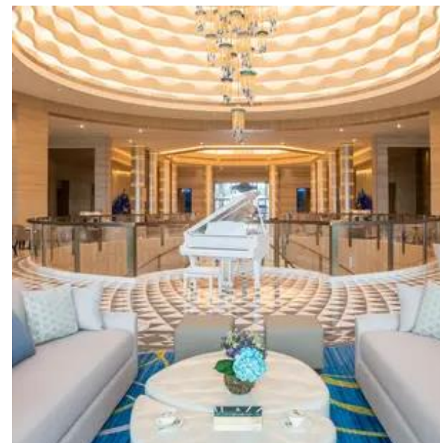
Godiva Lounge – Chocolatier Open 24 hours