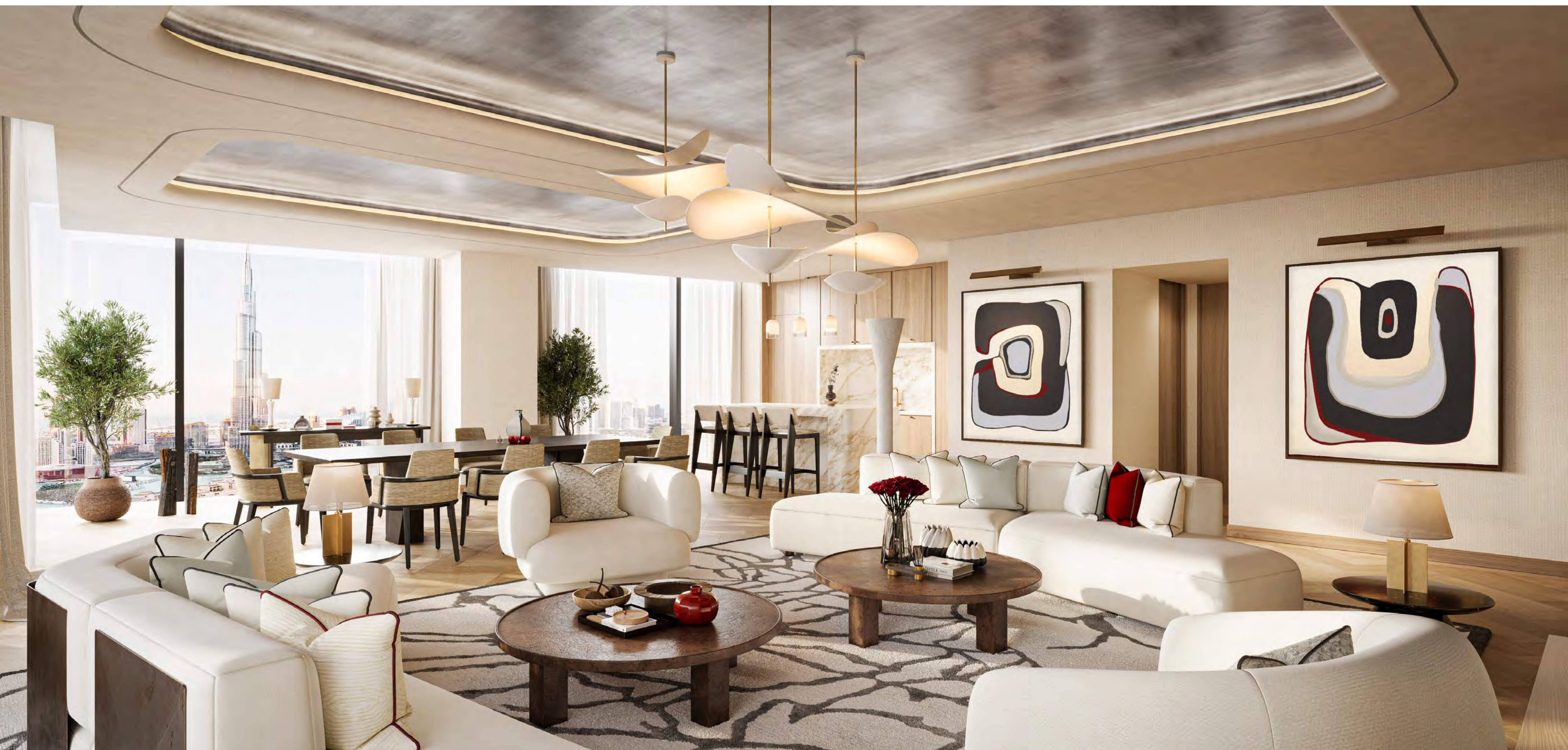
Apartment Living Room