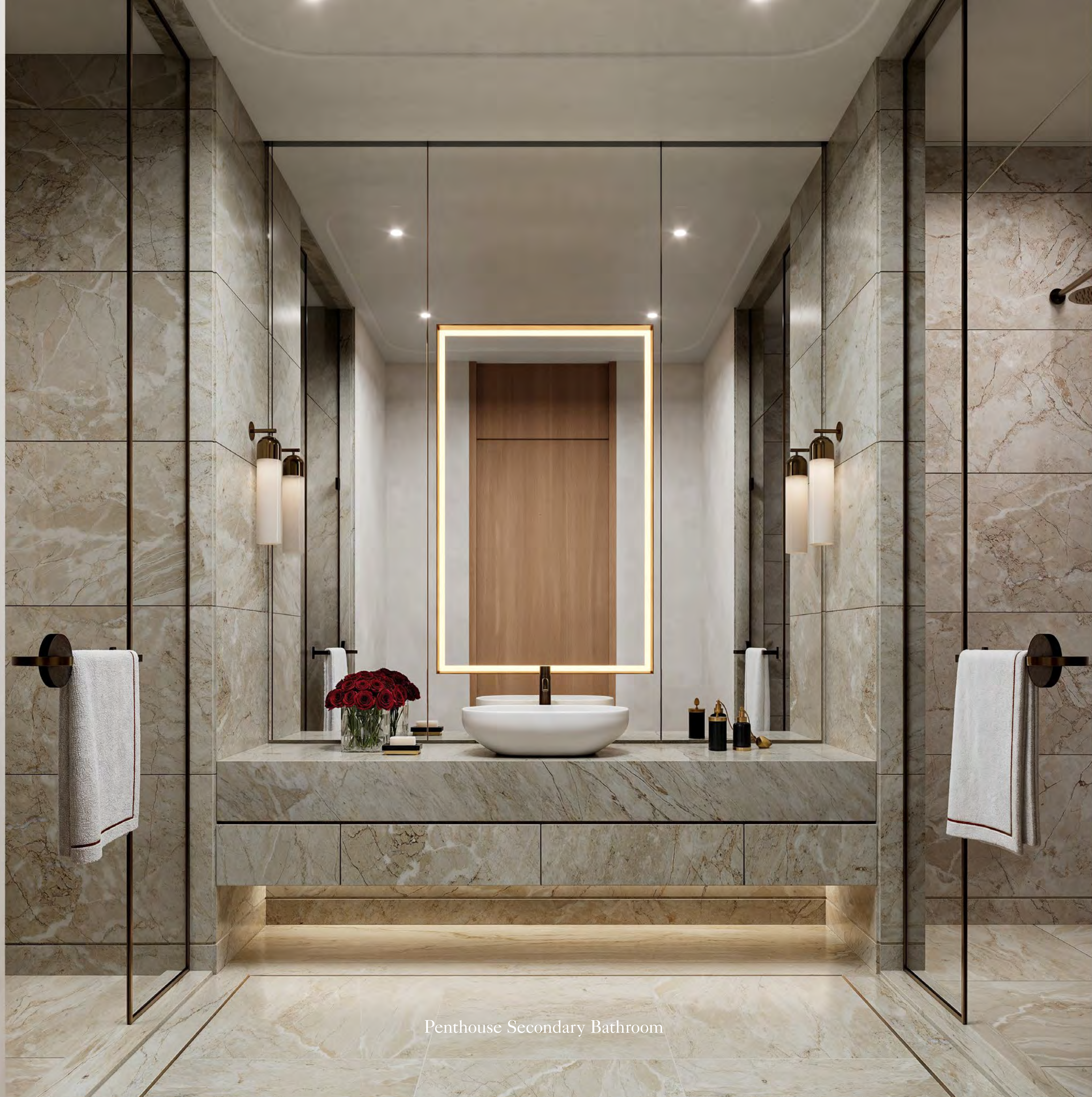
Penthouse Secondary Bathroom