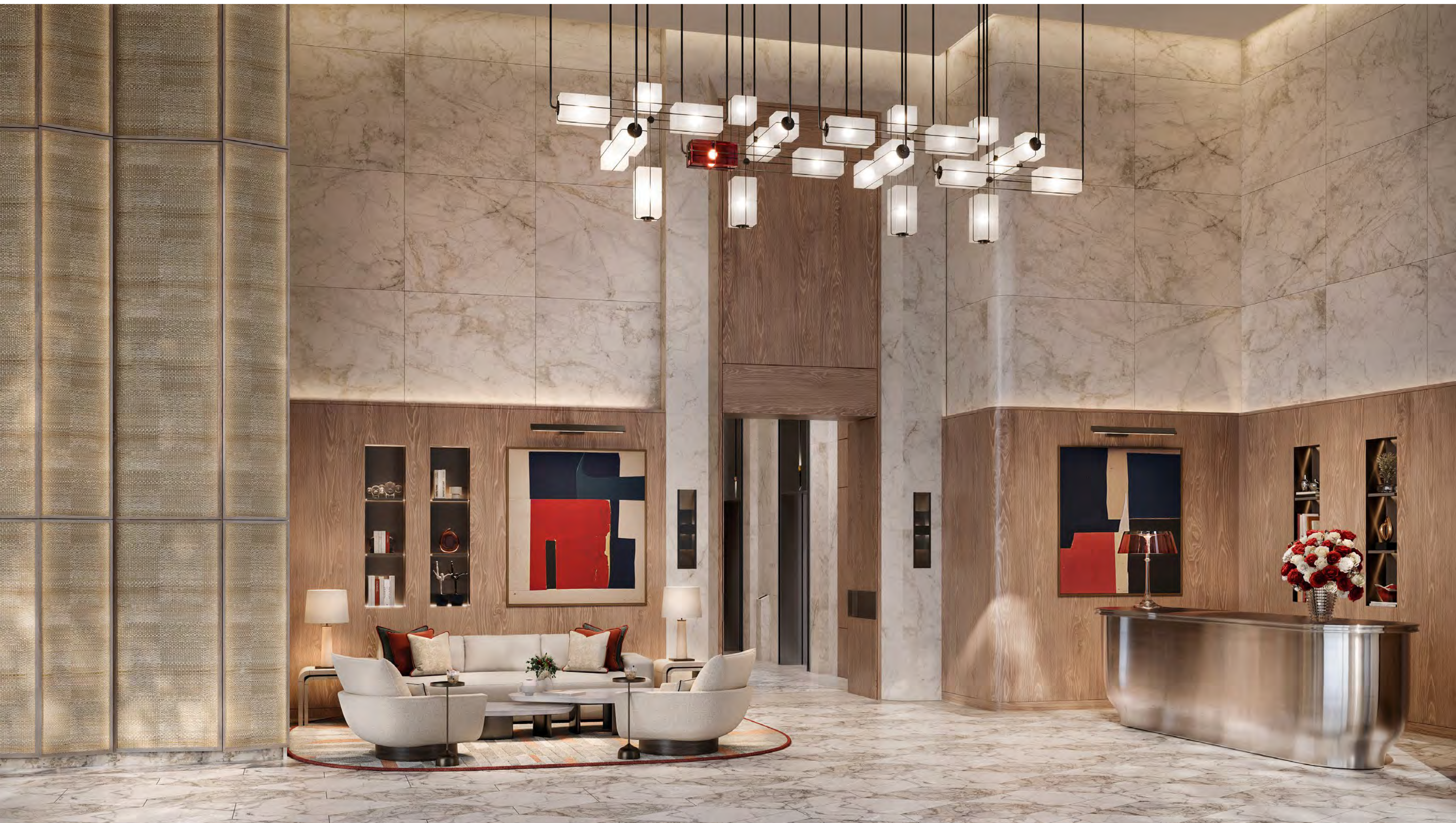
Arrival Lobby & Reception