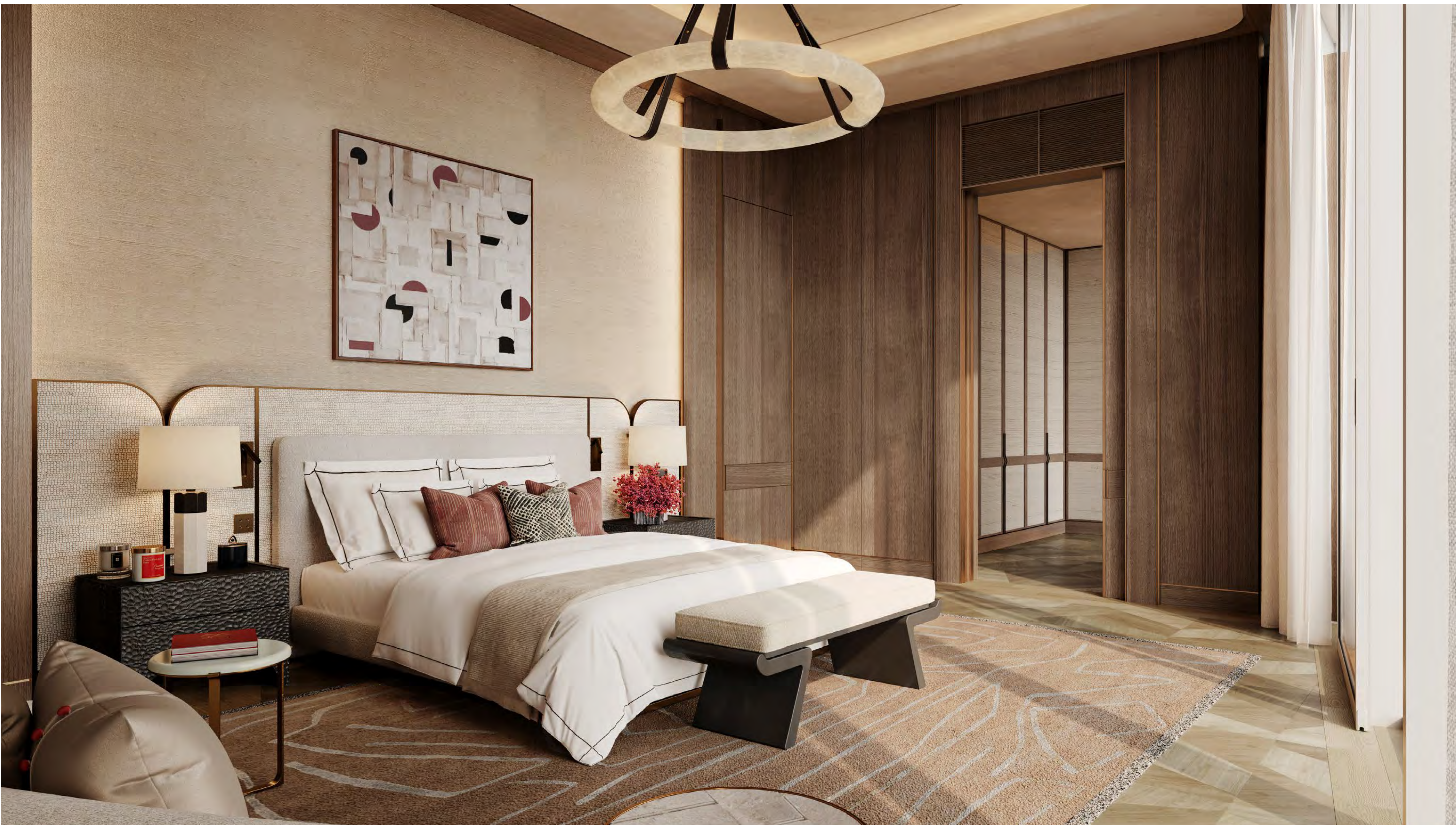
Penthouse Master Bedroom