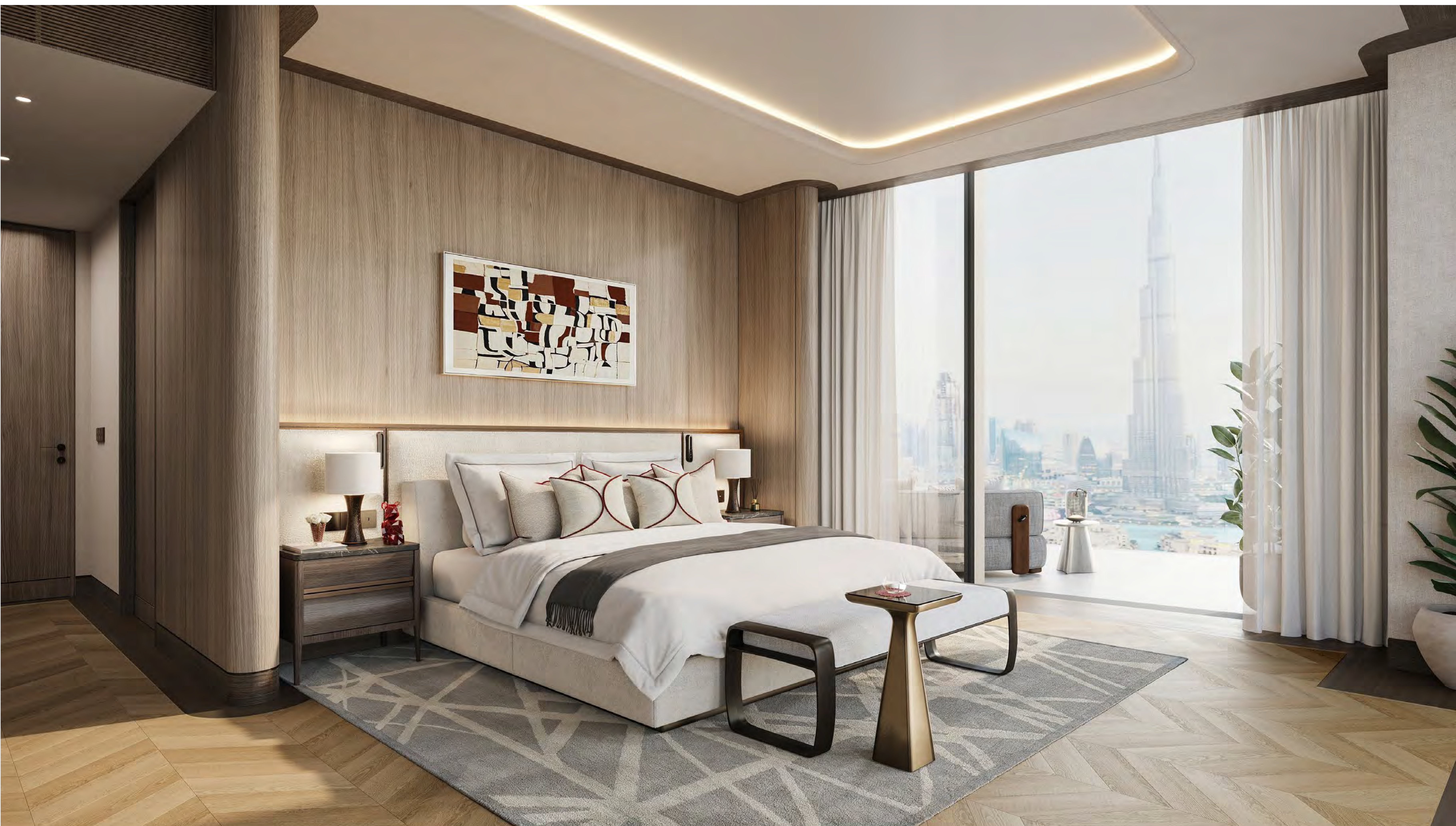
Apartment Master Bedroom