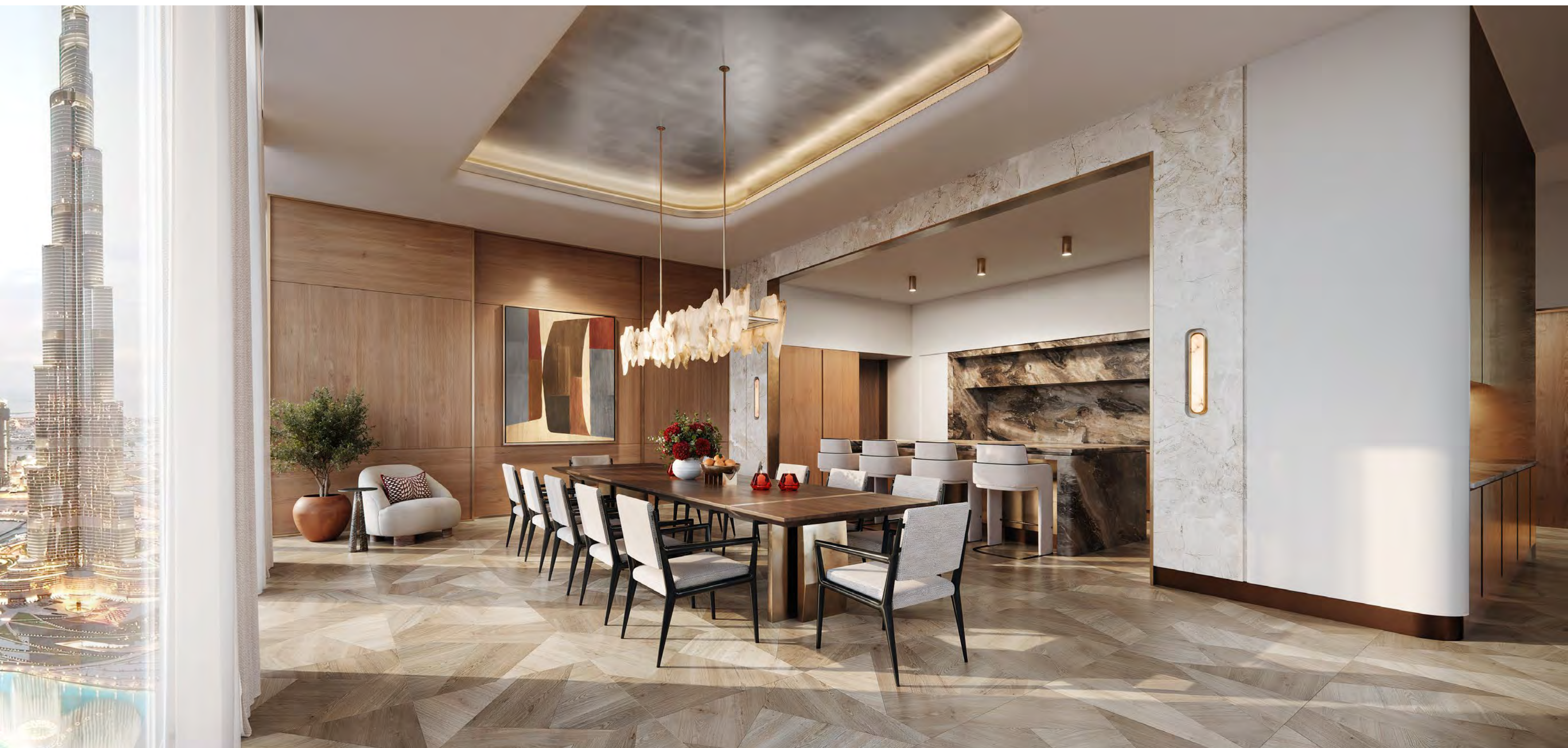
Penthouse Kitchen & Dining Room