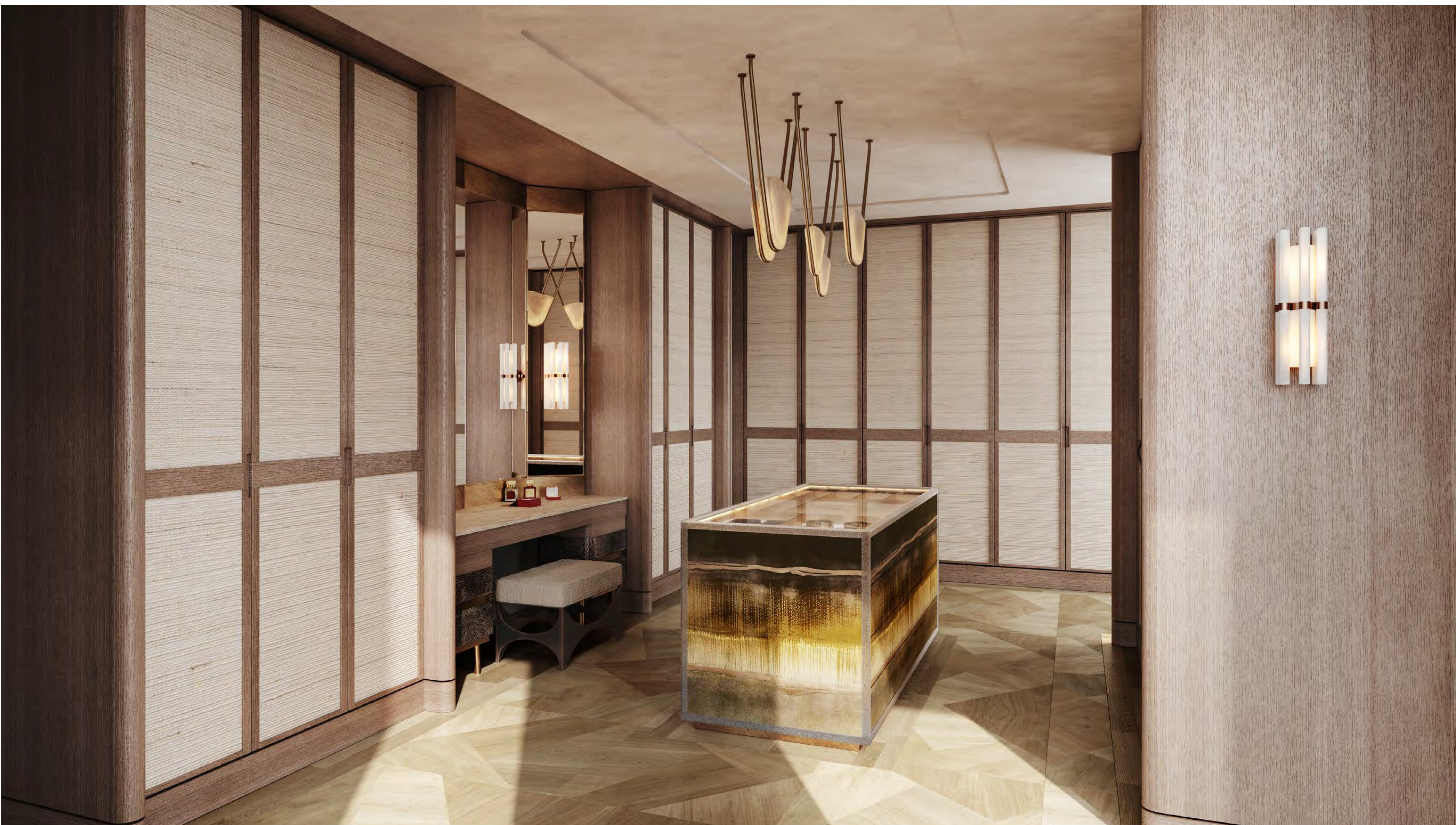
Penthouse Master Dressing Room