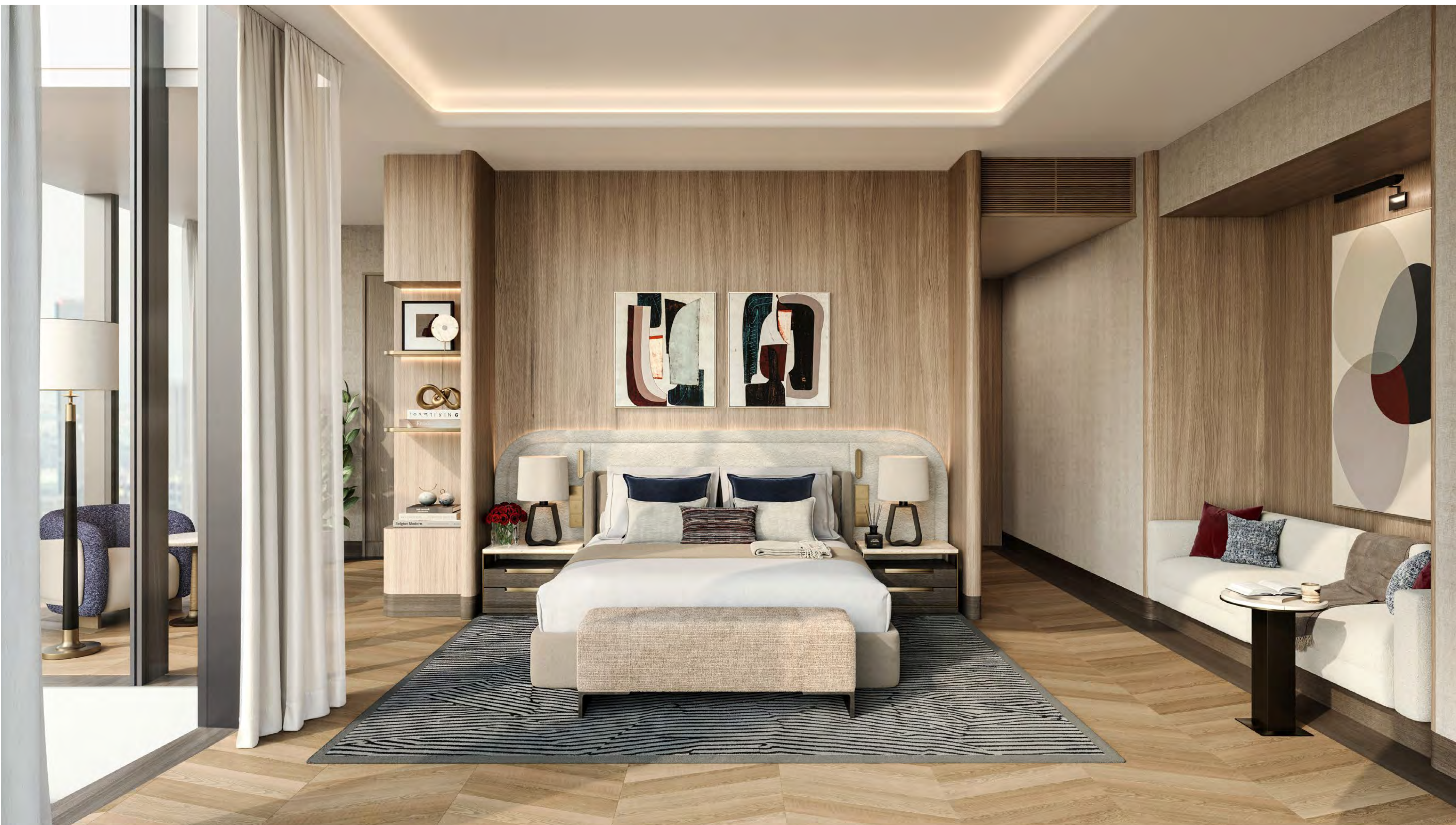
Apartment Secondary Bedroom