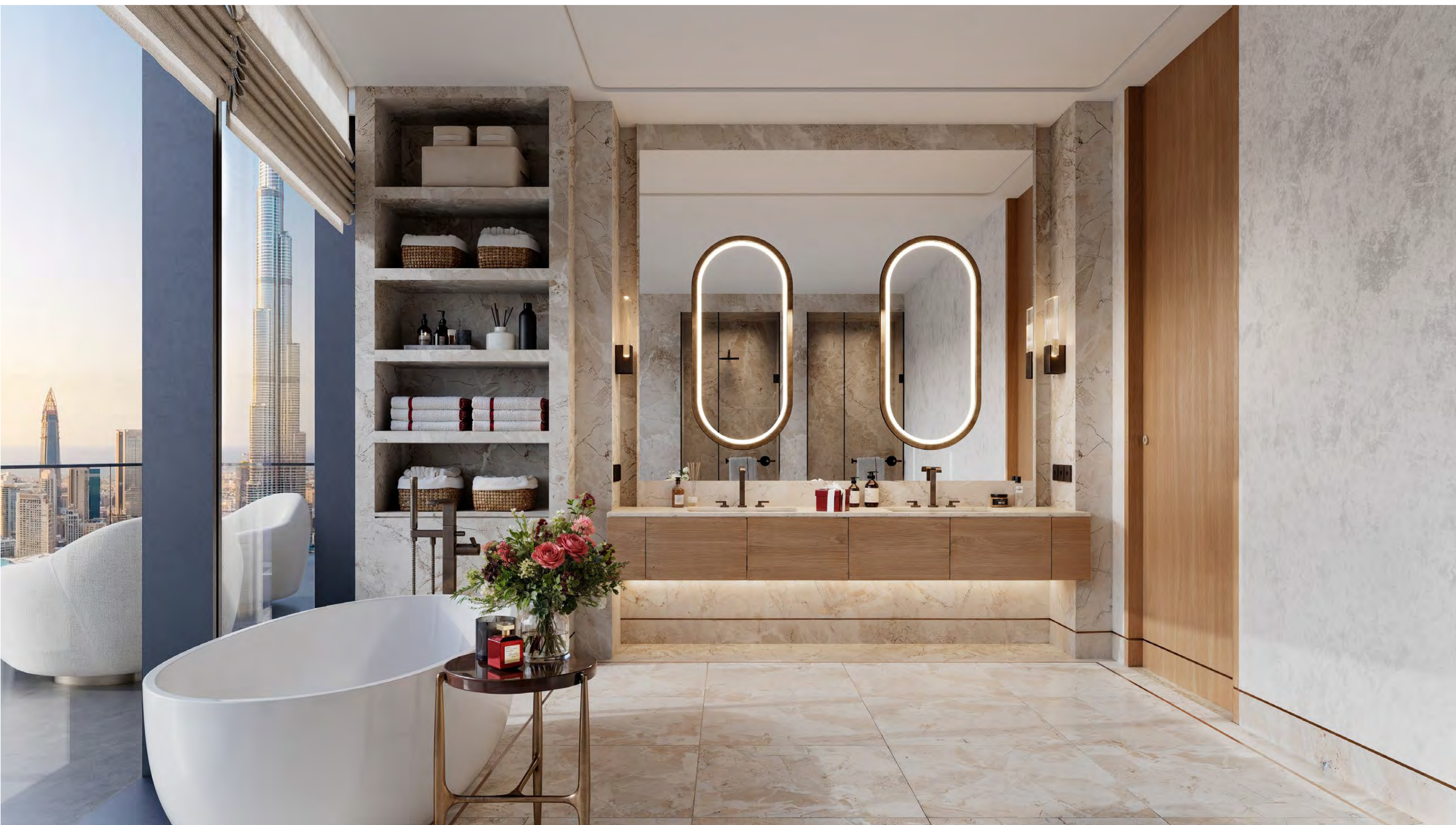
Apartment Master Bathroom