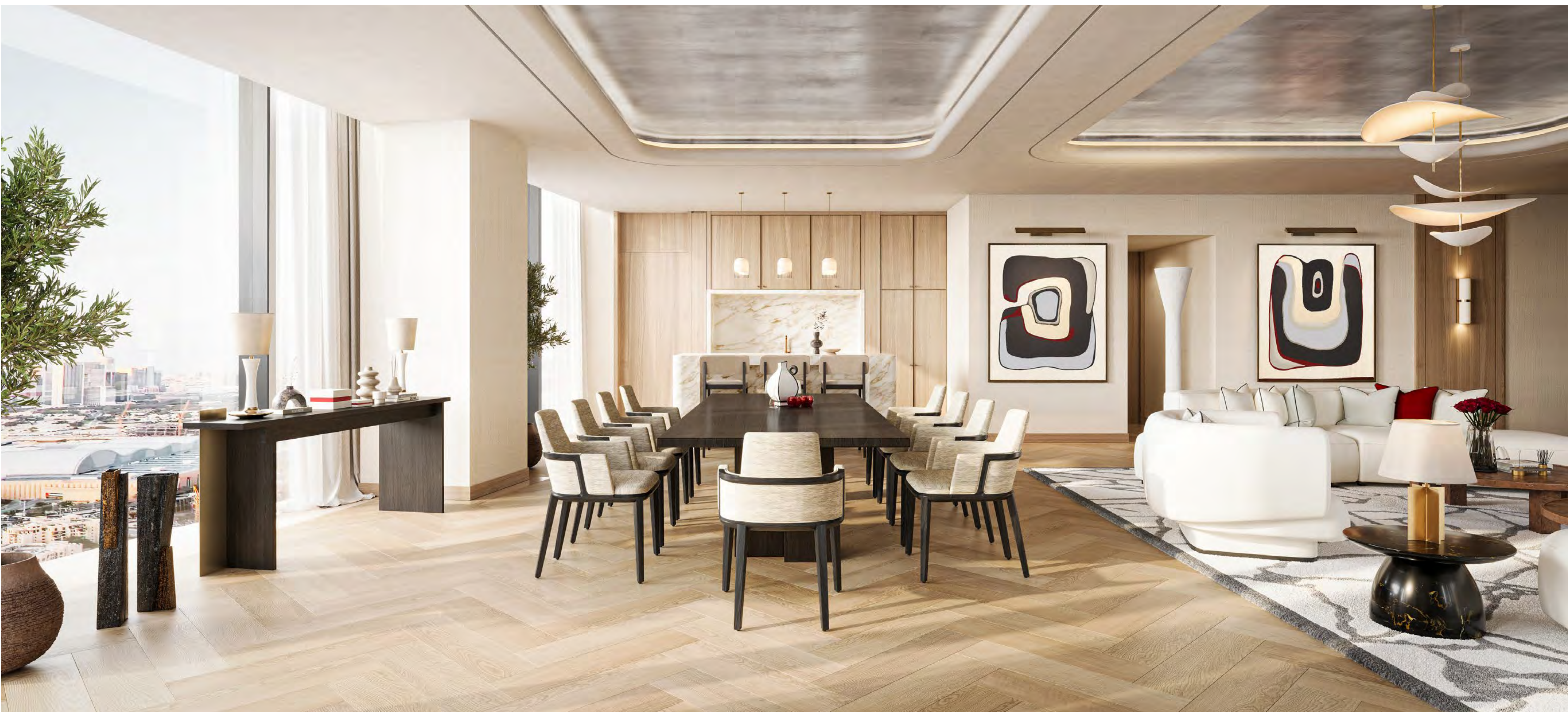
Apartment Kitchen & Dining Room