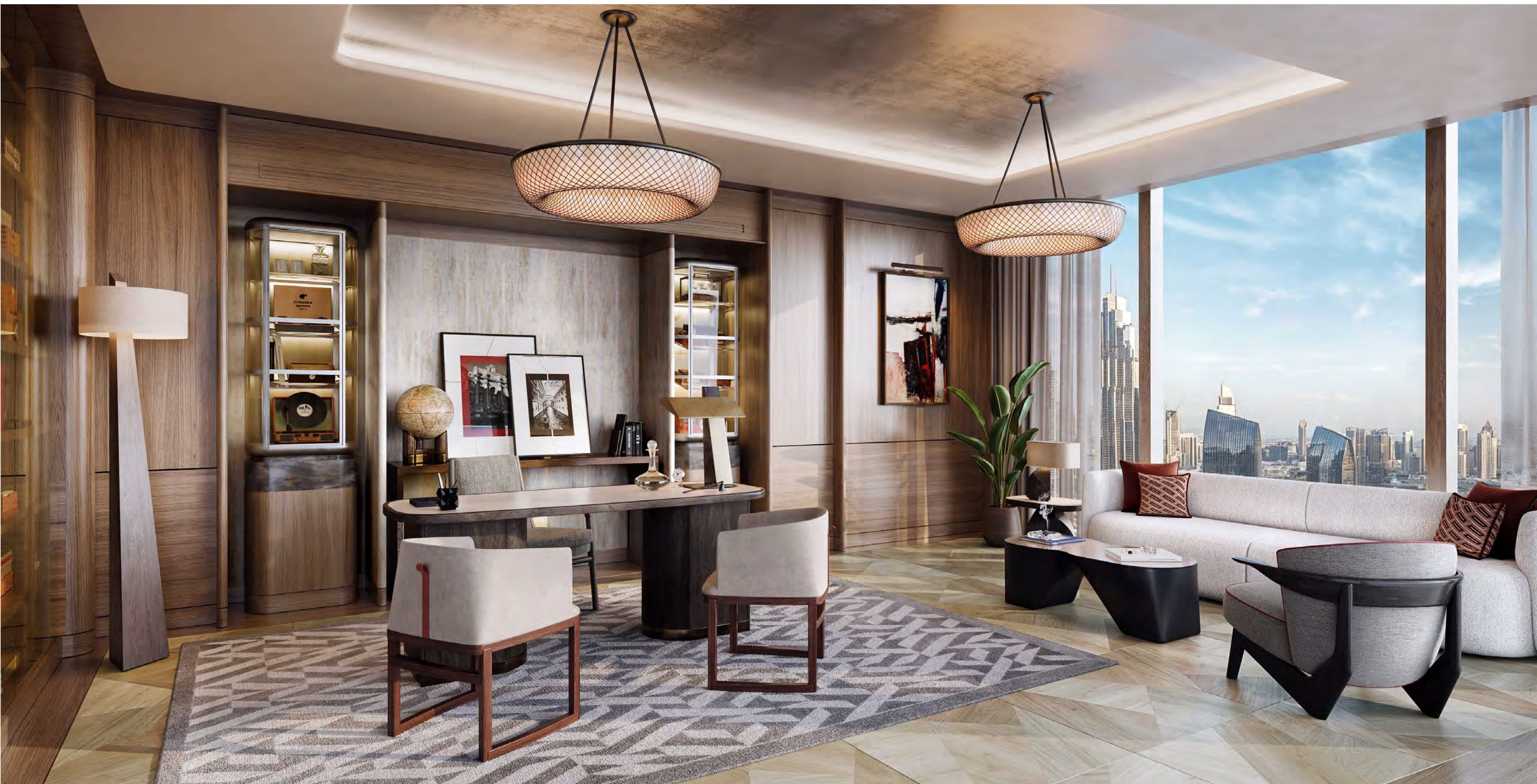
Penthouse Office & Cigar Room