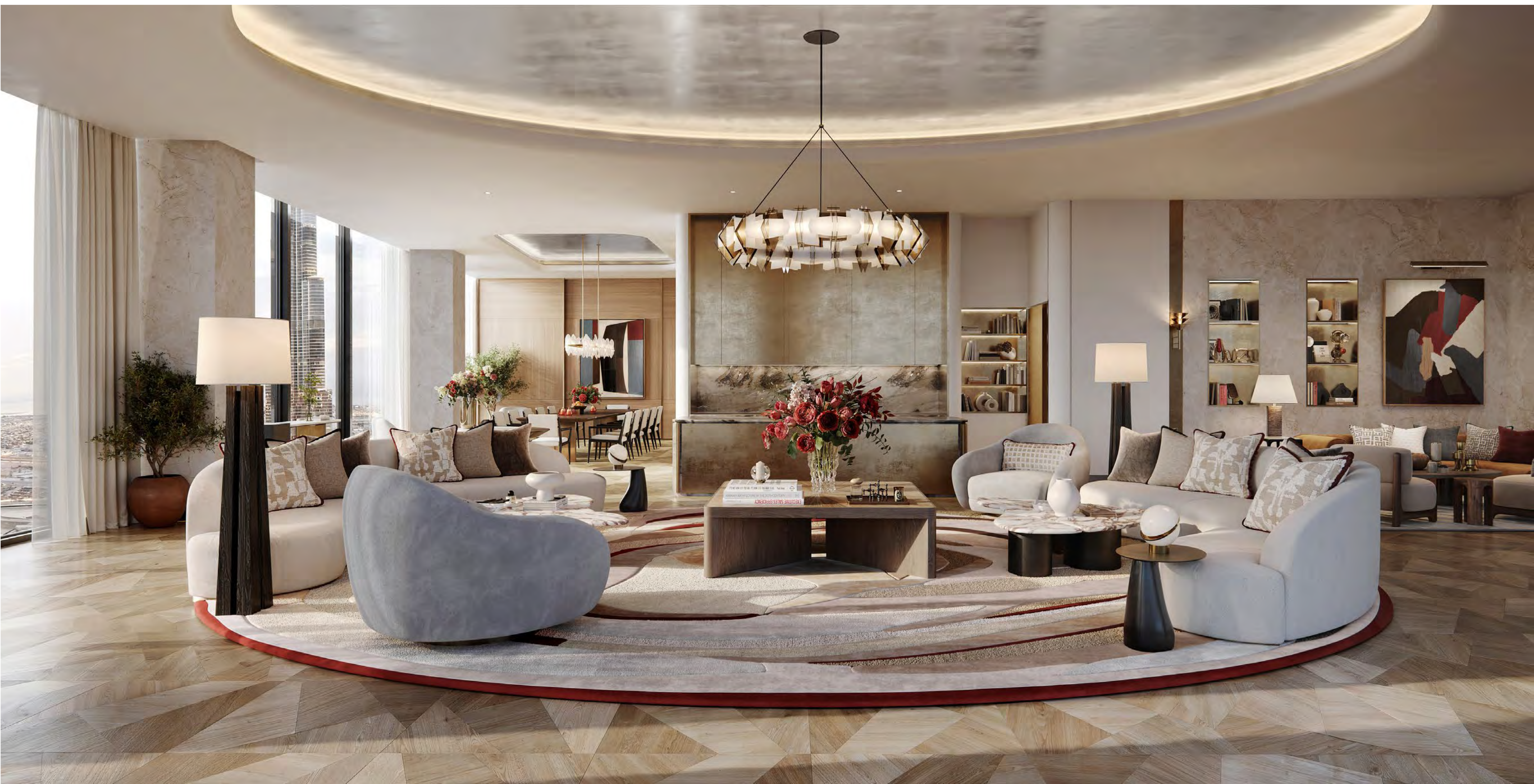
Penthouse Living Room