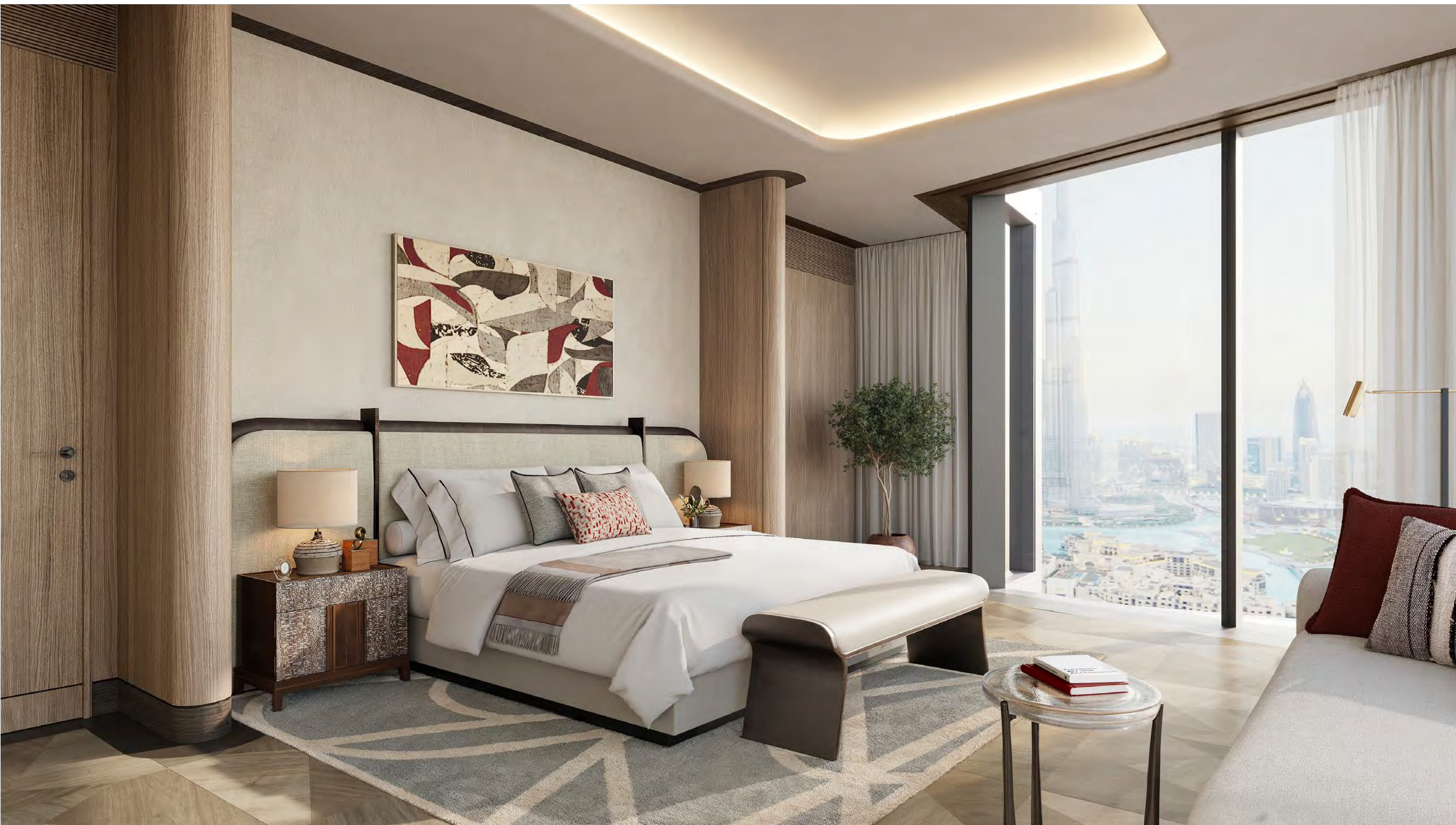
Penthouse Secondary Bedroom