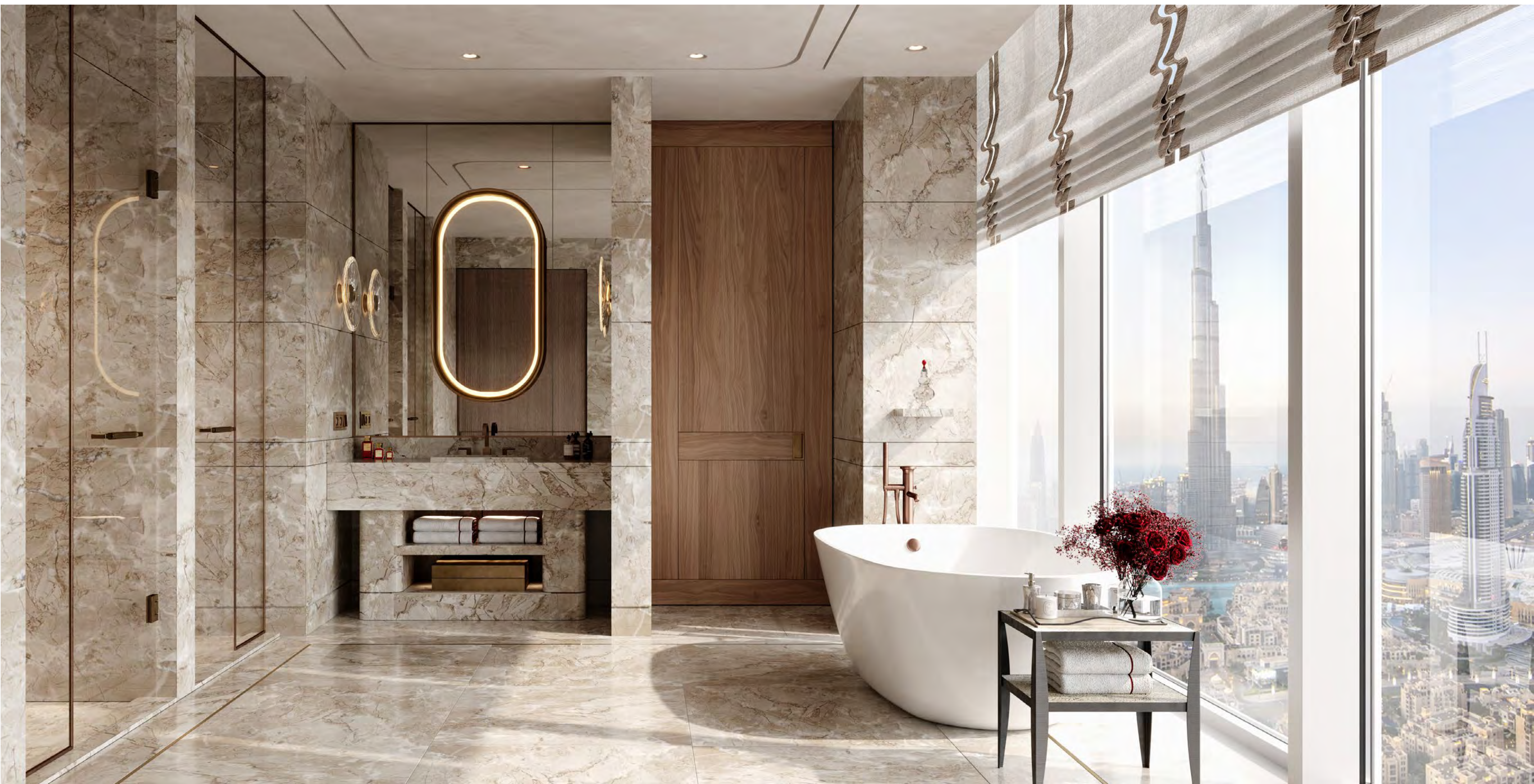
Penthouse Master Bathroom