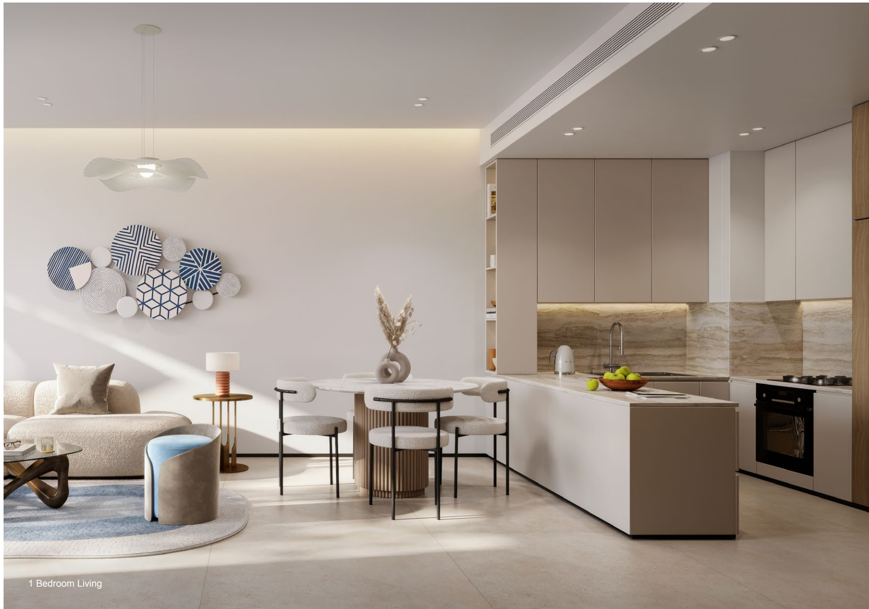
1 Bedroom Living