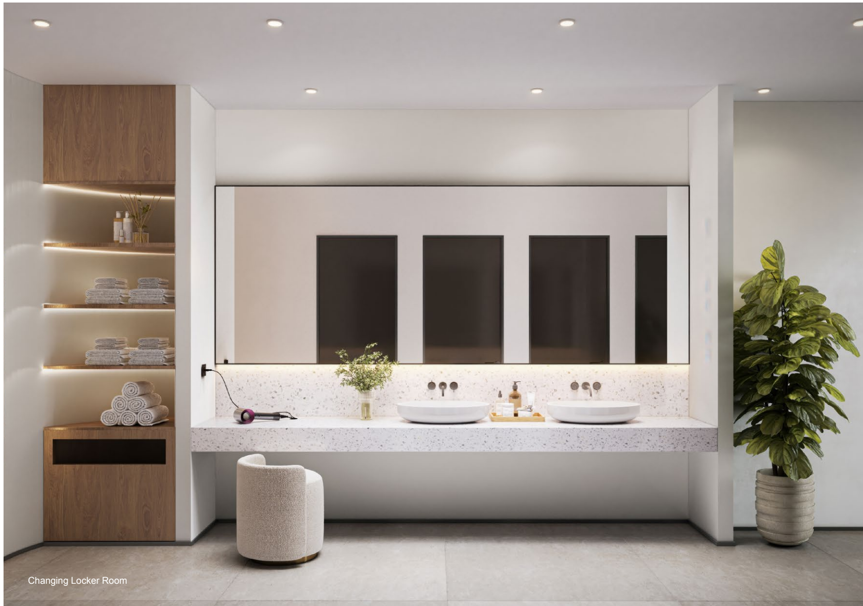
Changing Locker Room