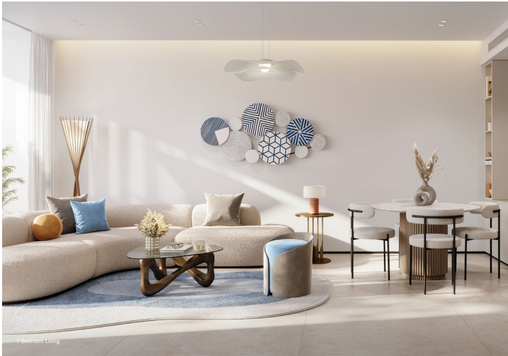
1 Bedroom Living