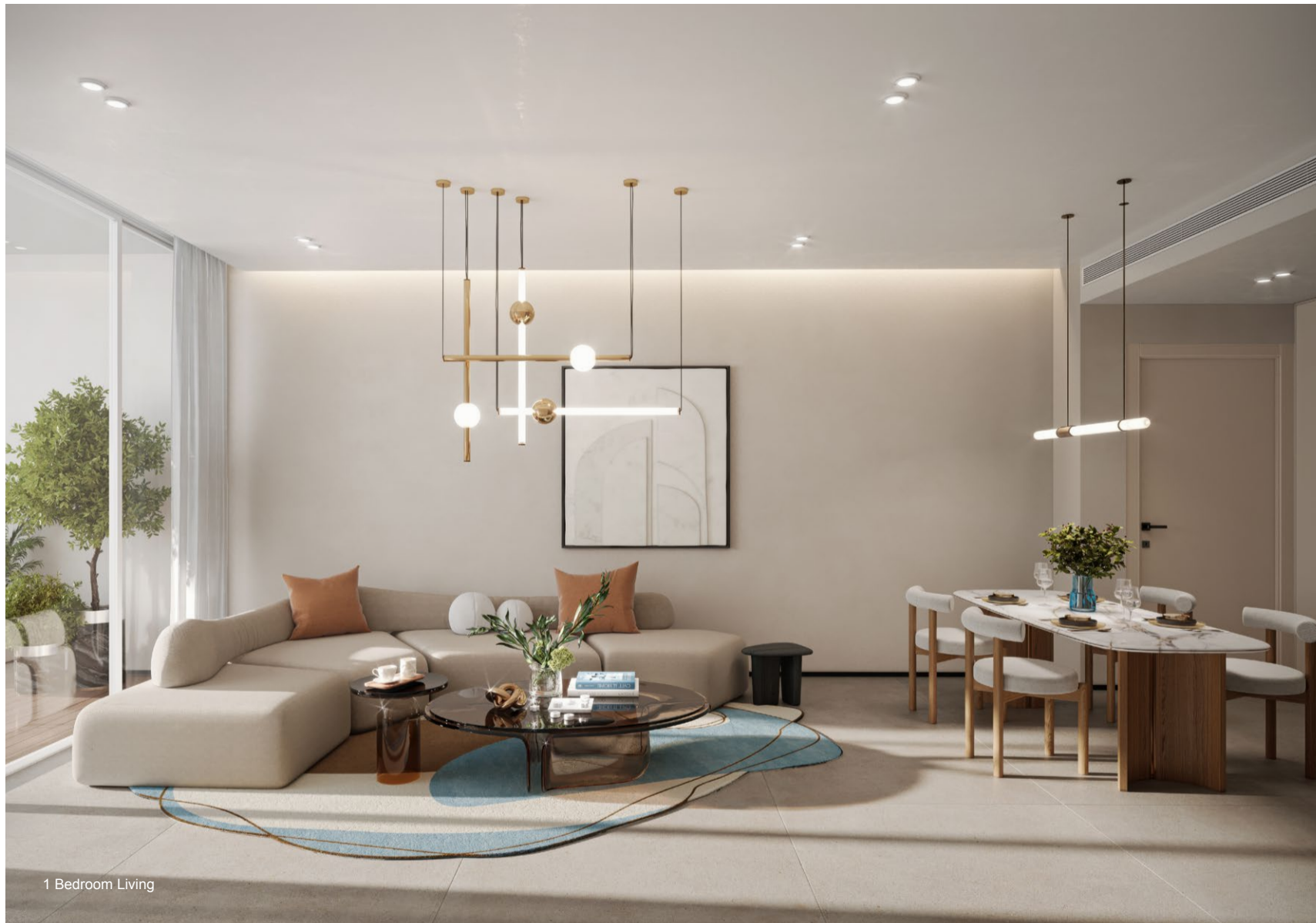
1 Bedroom Living