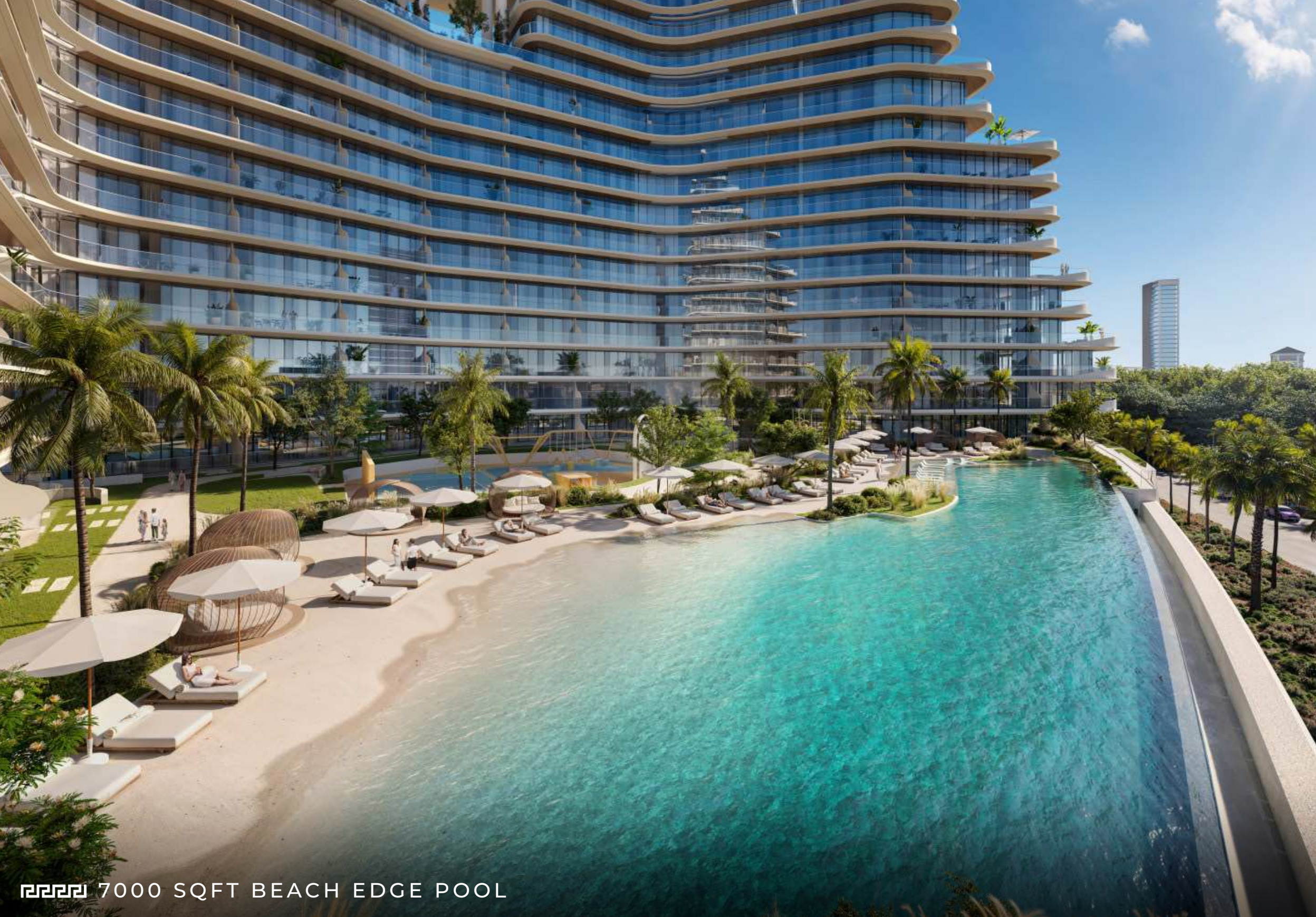
7000 SQFT BEACH EDGE POOL