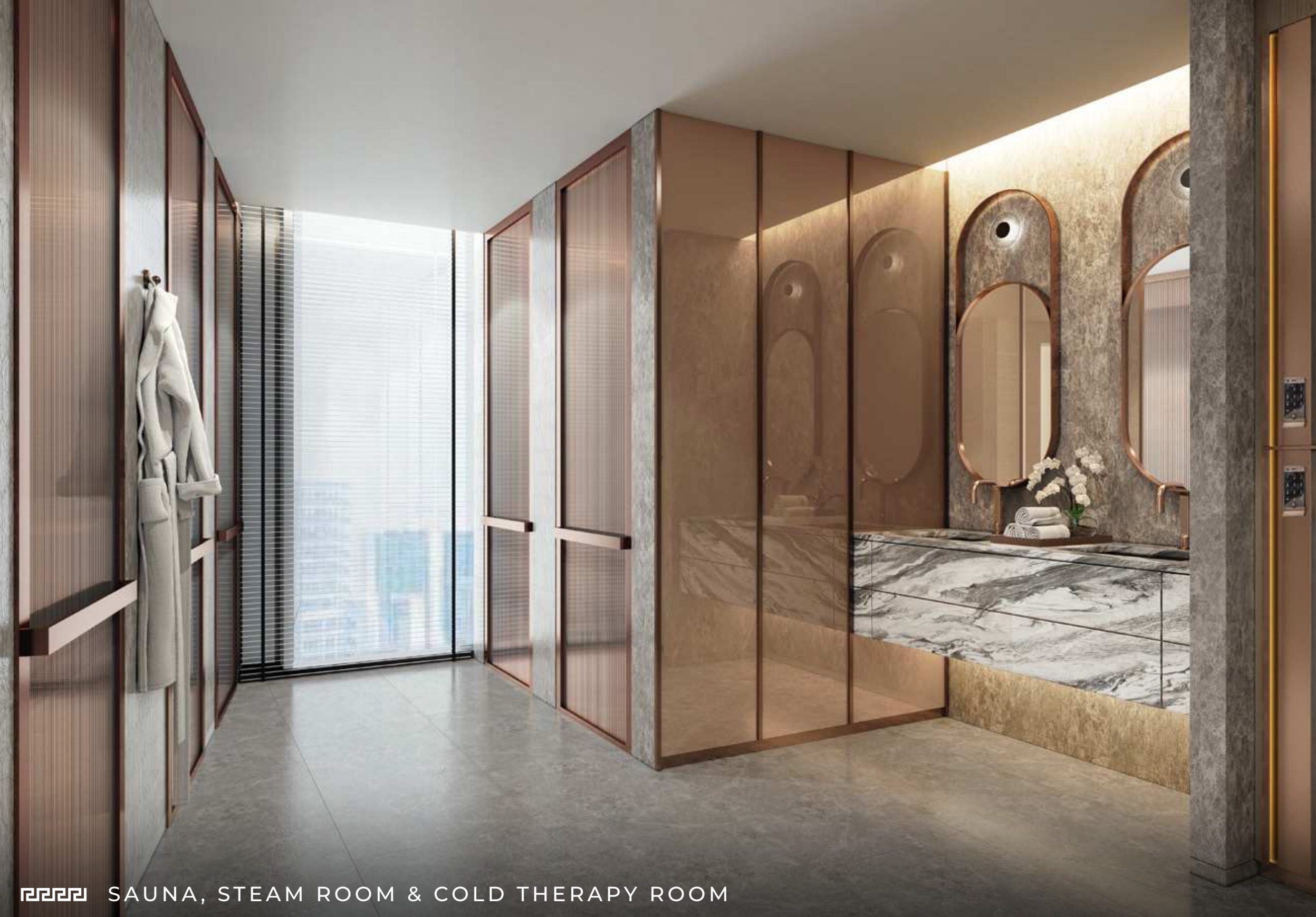
SAUNA, STEAM ROOM & COLD THERAPY ROOM