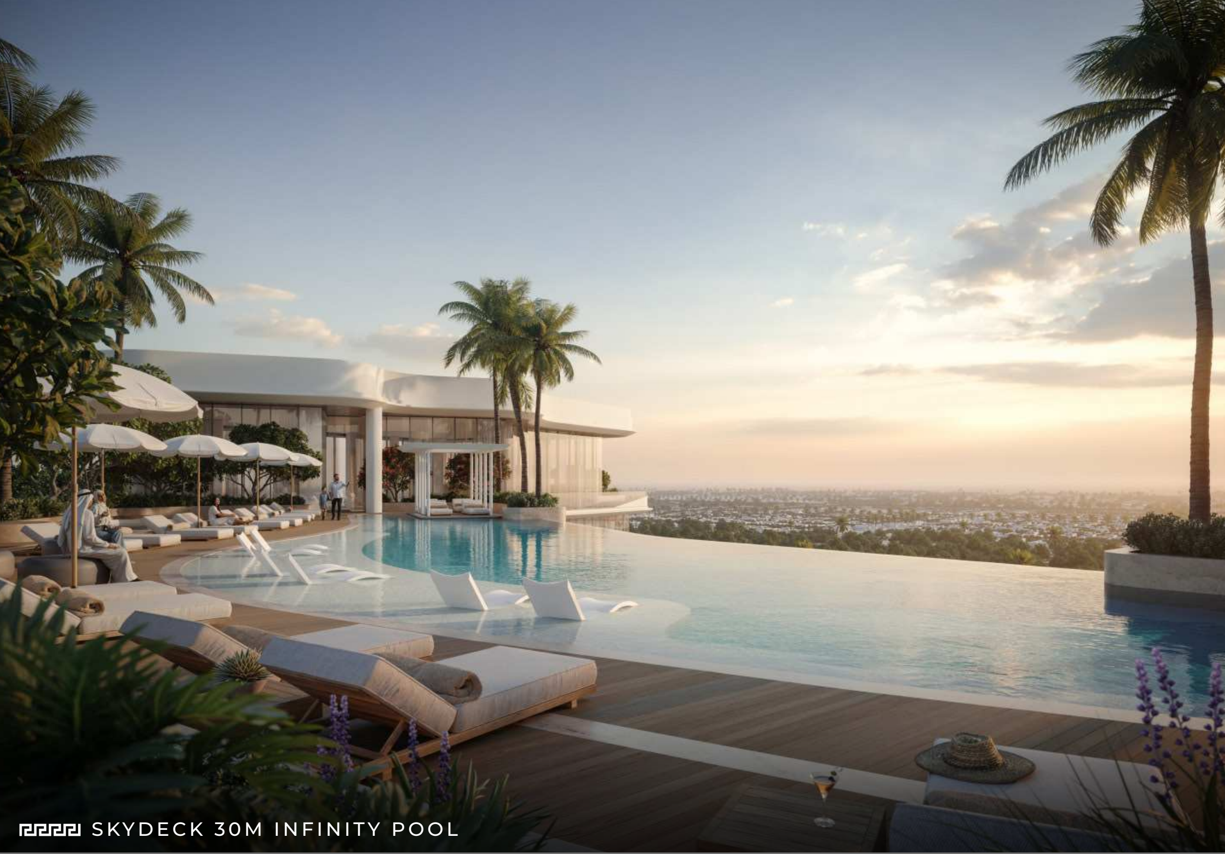
SKYDECK 30M INFINITY POOL