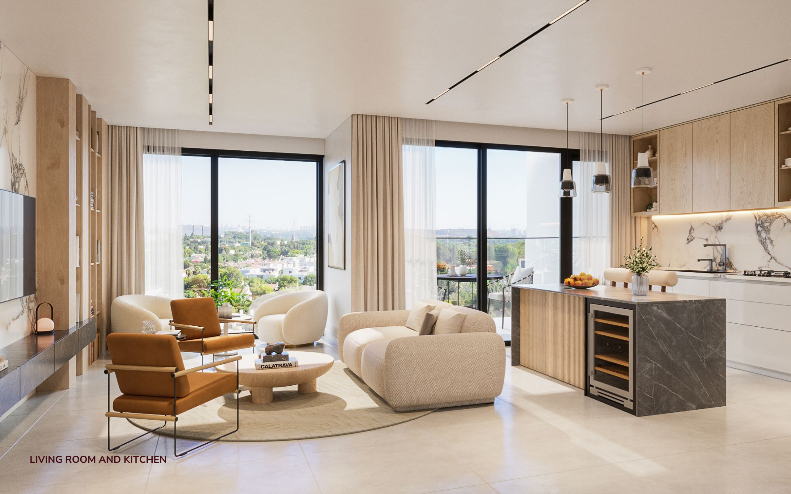
LIVING ROOM AND KITCHEN